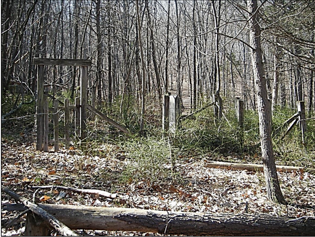
Photograph of 46-HM-133, looking northwest.