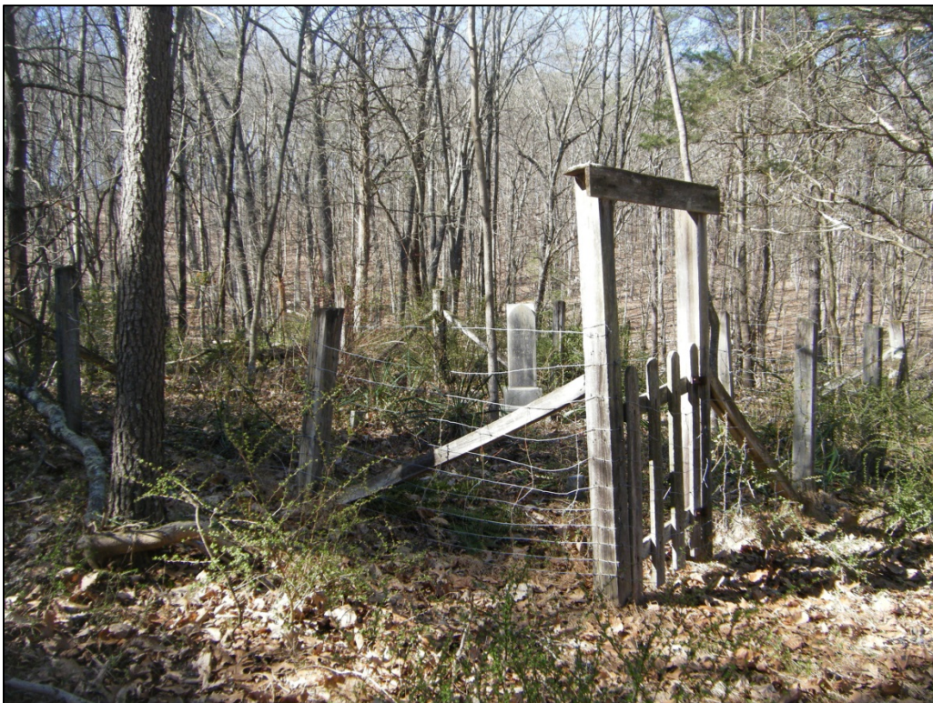
Photograph of 46-HM-133, looking northwest.