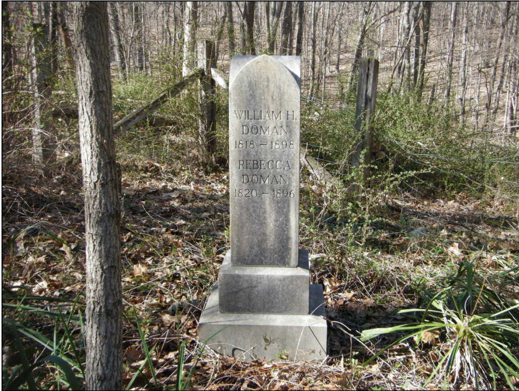
Photograph of a headstone at 46-HM-133.