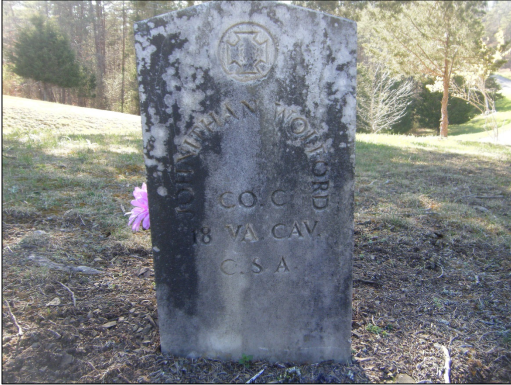
Photograph of a headstone at 46-HM-134.