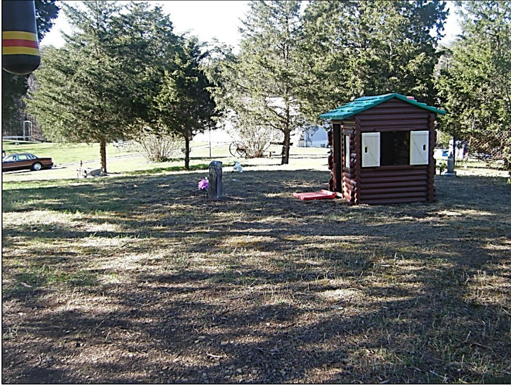
Photograph of 46-HM-134, looking north.