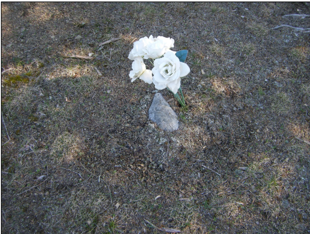
Photograph of an unmarked stone marker at 46-HM-134.