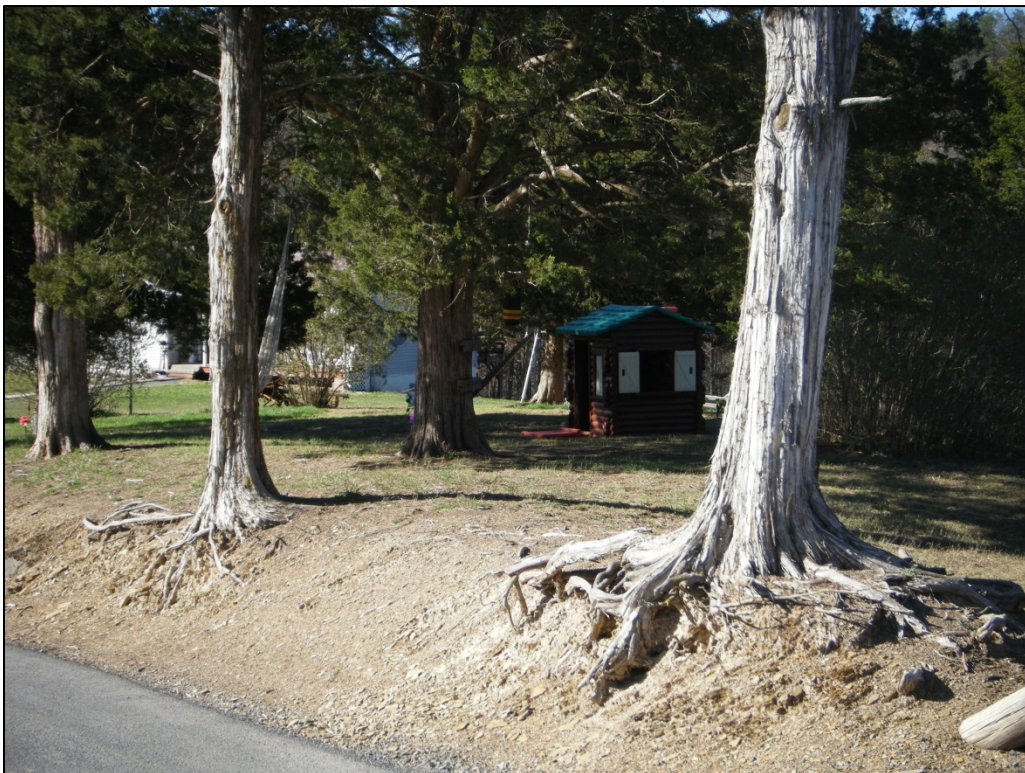
Photograph of 46-HM-134, looking northeast.