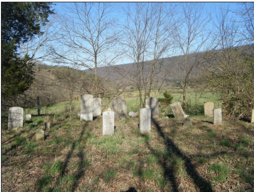
Photograph of 46-HM-136, looking northeast.