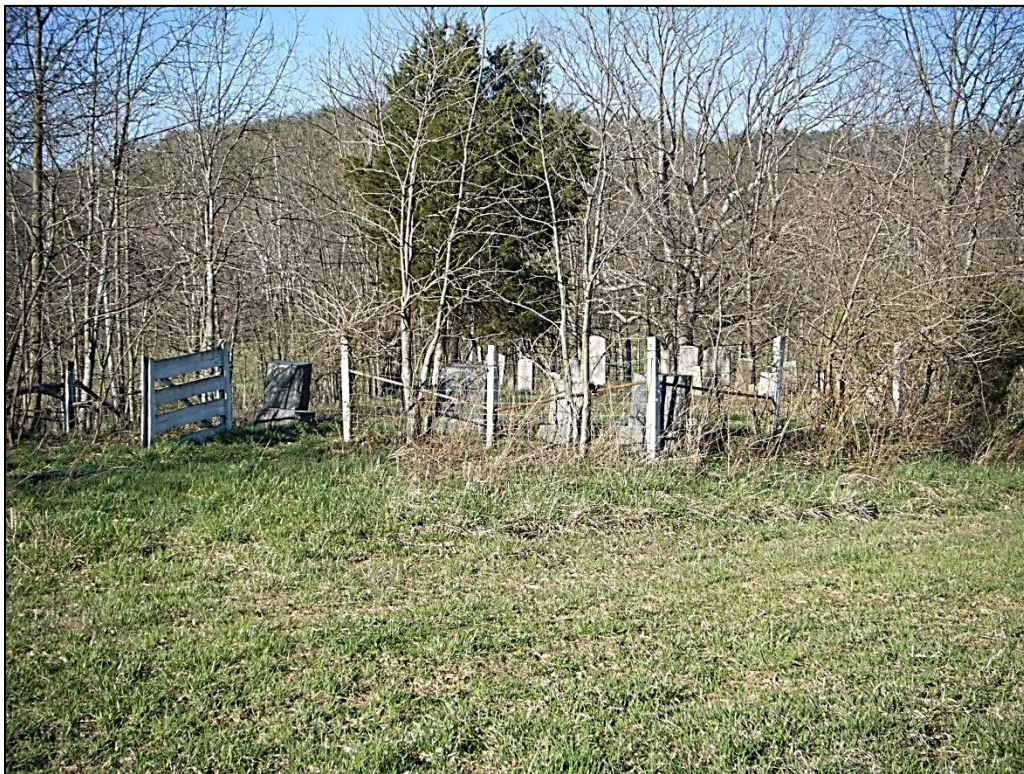
Photograph of 46-HM-136, looking northeast.