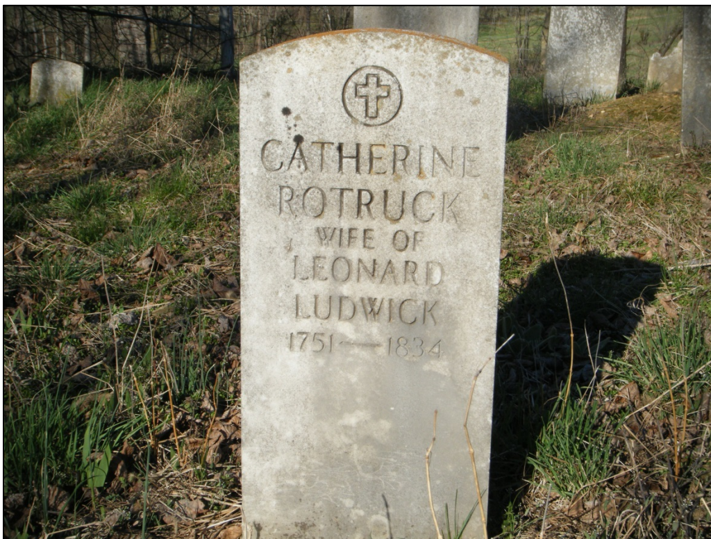
Photograph of a headstone documented at 46-HM-136.