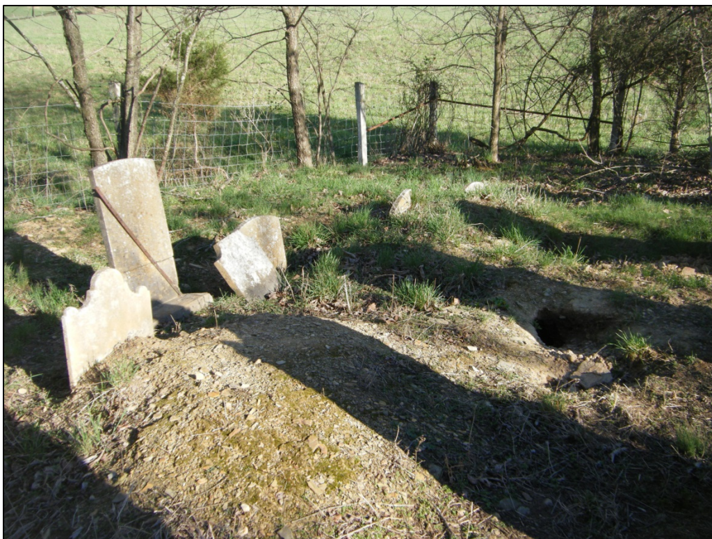
Photograph of disturbances from animal burrowing activities at 46-HM-136.