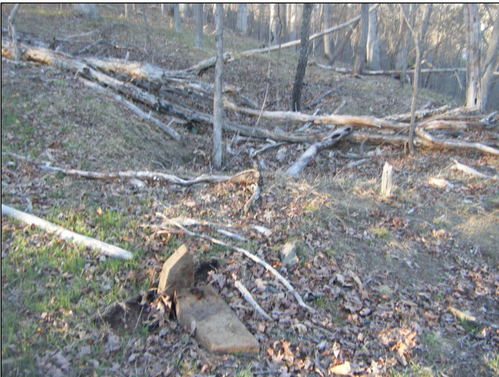
Photograph of 46-HM-138 showing removed burials and general appearance of the cemetery, looking northeast.