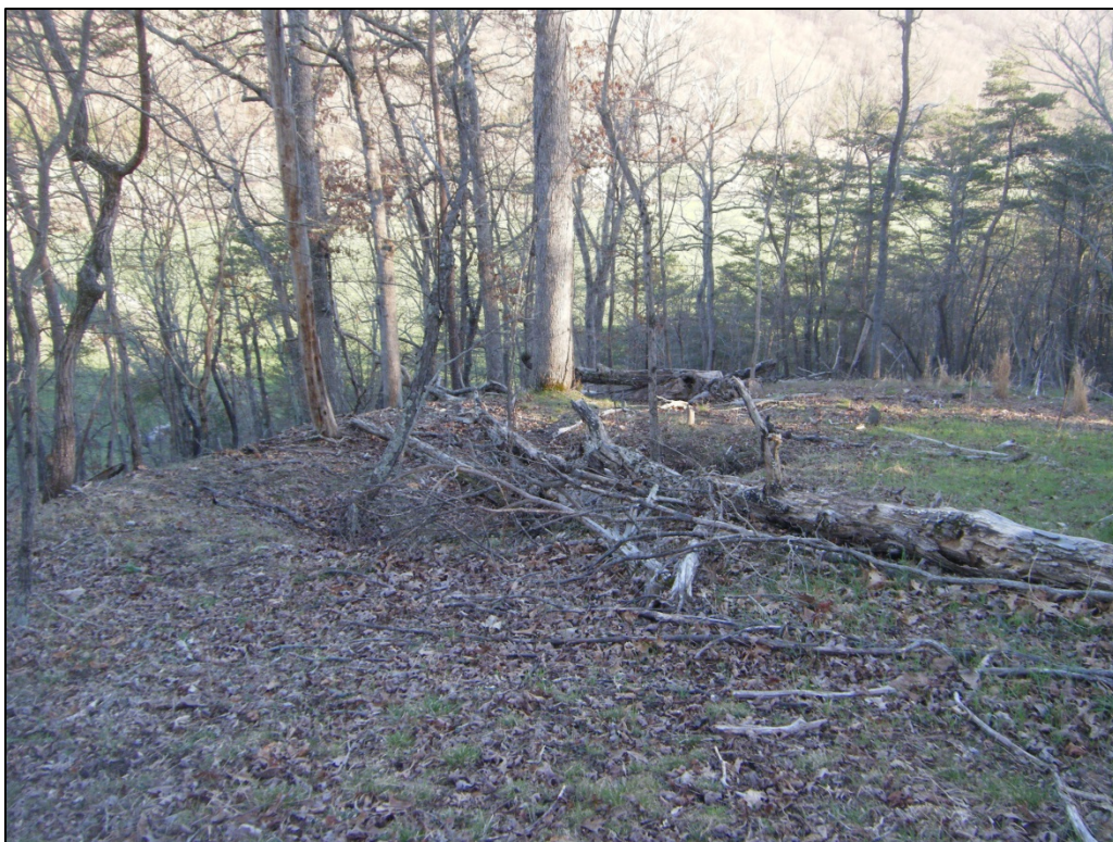
Photograph of 46-HM-138, looking south.