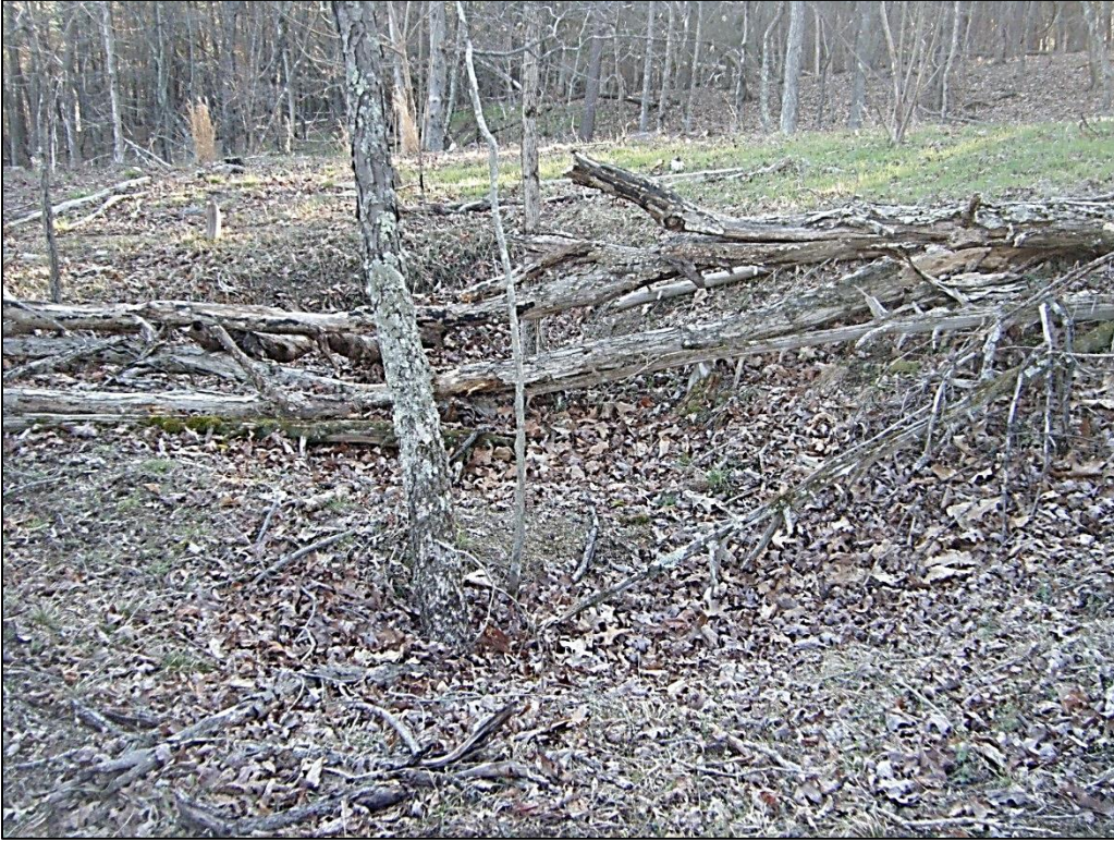
Photograph of 46-HM-138 showing possible grave depressions, looking west.