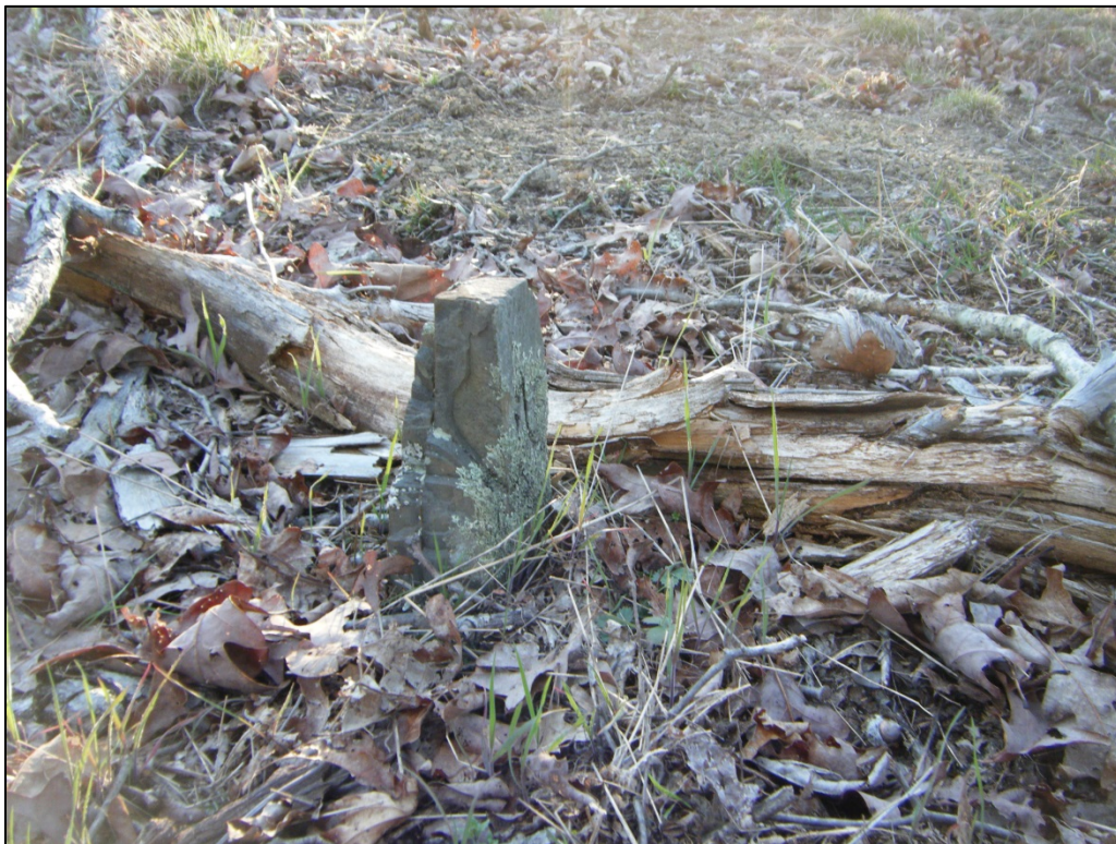
Photograph of a marker documented at 46-HM-138.