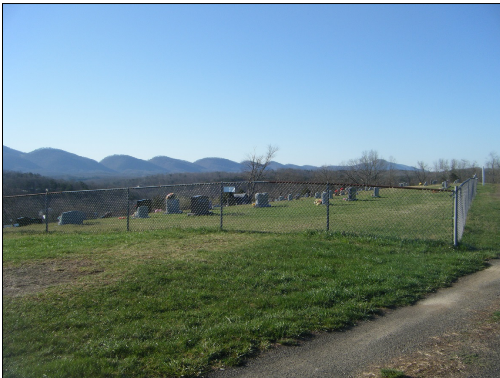
Photograph of 46-HM-139, looking south.