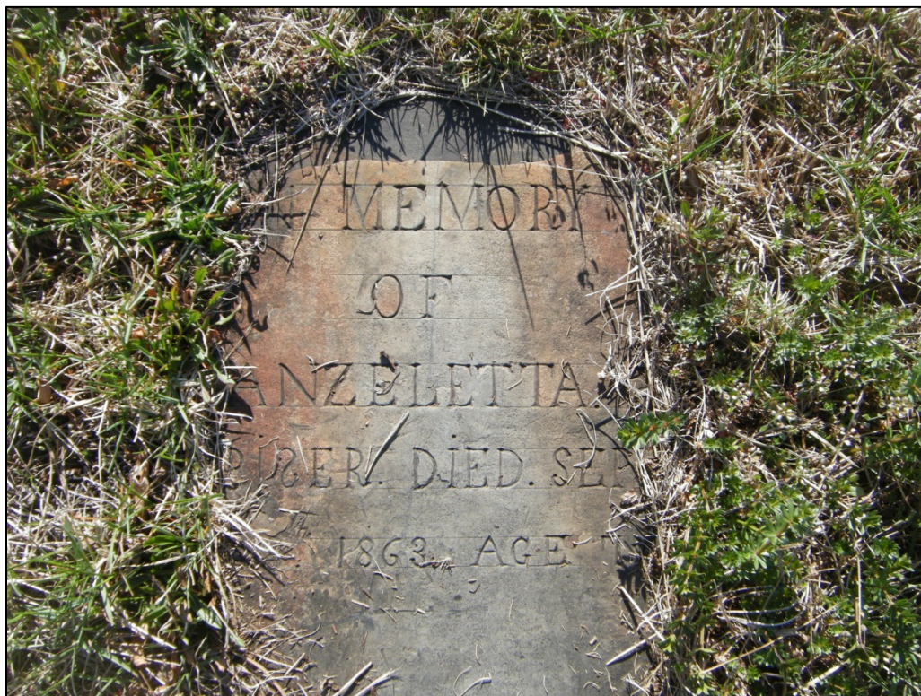
Photograph of a headstone documented at 46-HM-139.