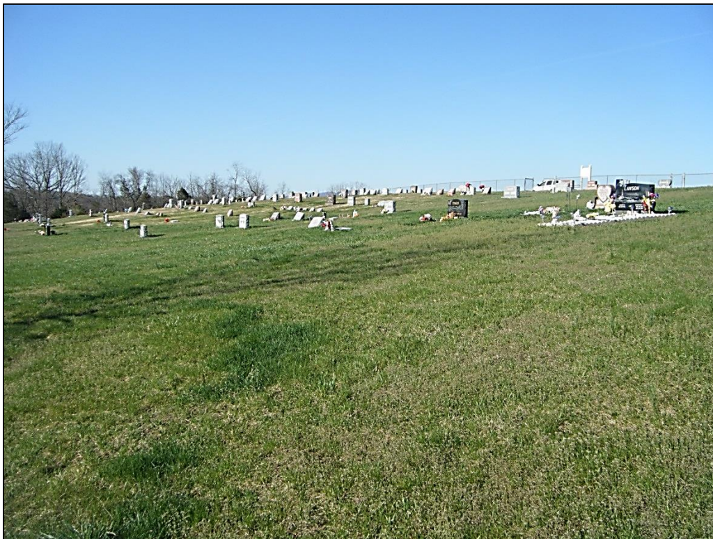
Photograph of 46-HM-139, looking southwest.