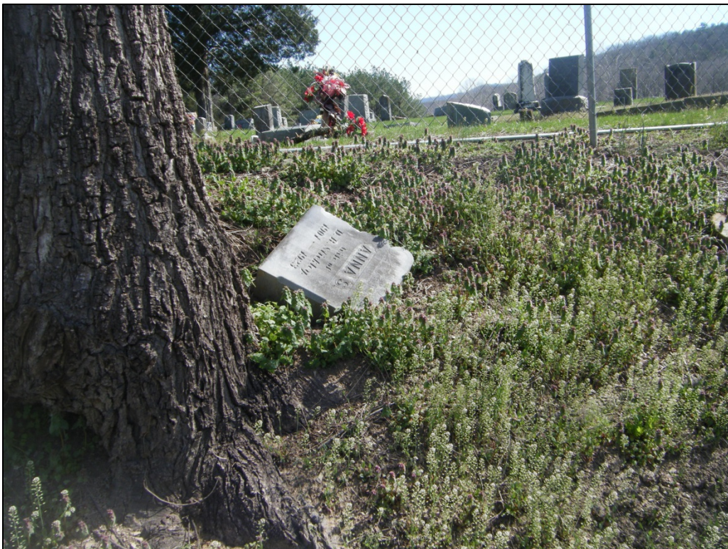
Photograph of 46-HM-141 showing a headstone outside of the fenced area, looking northeast.