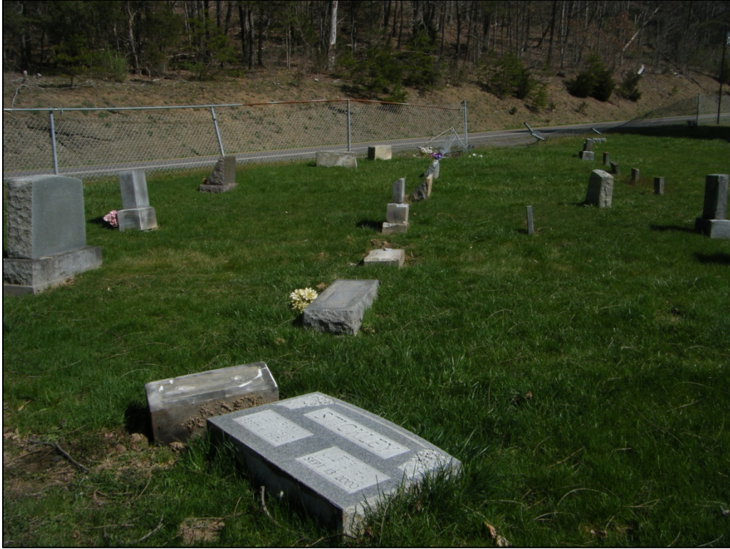
Photograph of 46-HM-141, looking northwest.