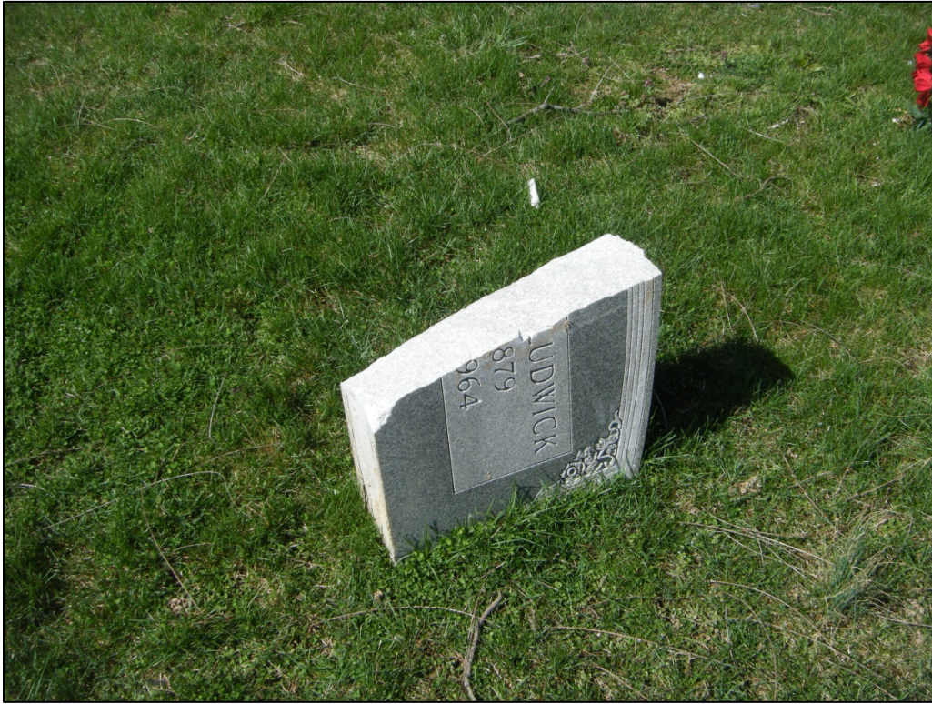
Photograph of a damaged headstone from the automobile accident at 46-HM-141.