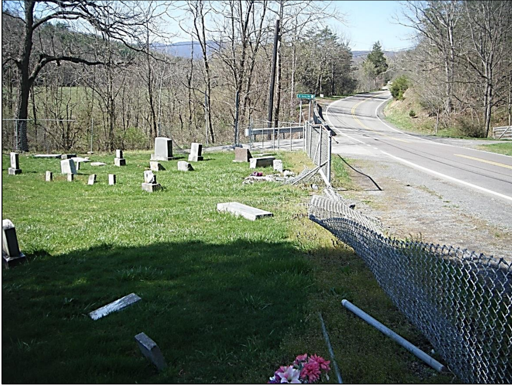
Photograph of 46-HM-141 showing damage from recent automobile accident, looking southwest.