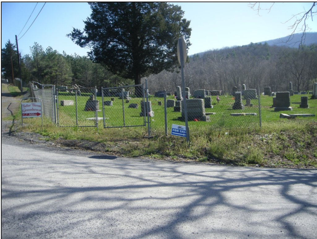
Photograph of 46-HM-141, looking northeast.