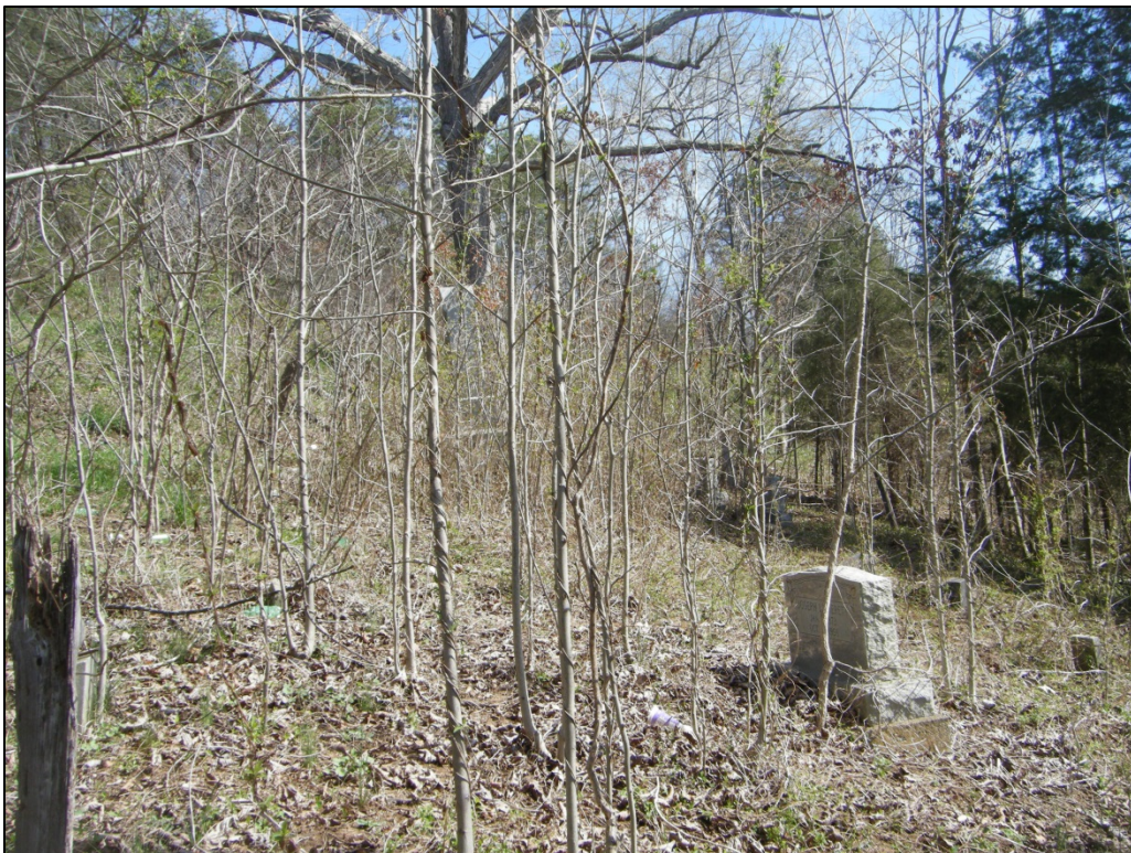
Photograph of 46-HM-142, looking northeast.