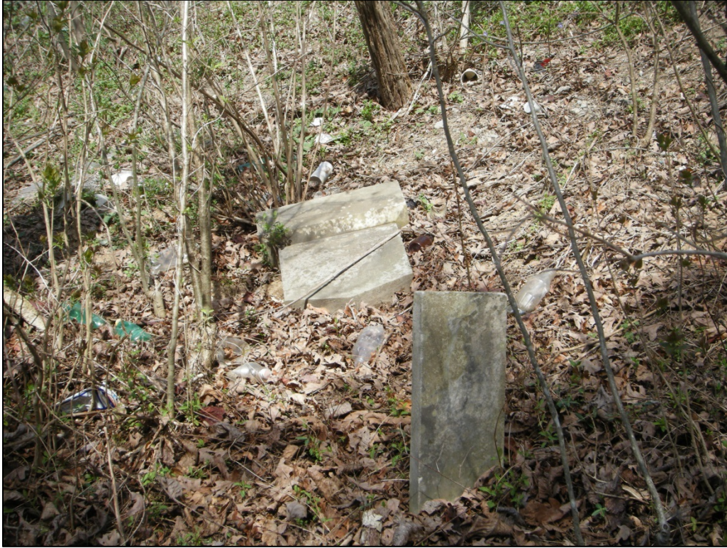
Photograph of a broken headstone documented at 46-HM-142.