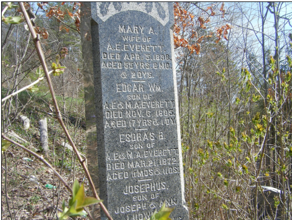
Photograph of a headstone encountered at 46-HM-142.