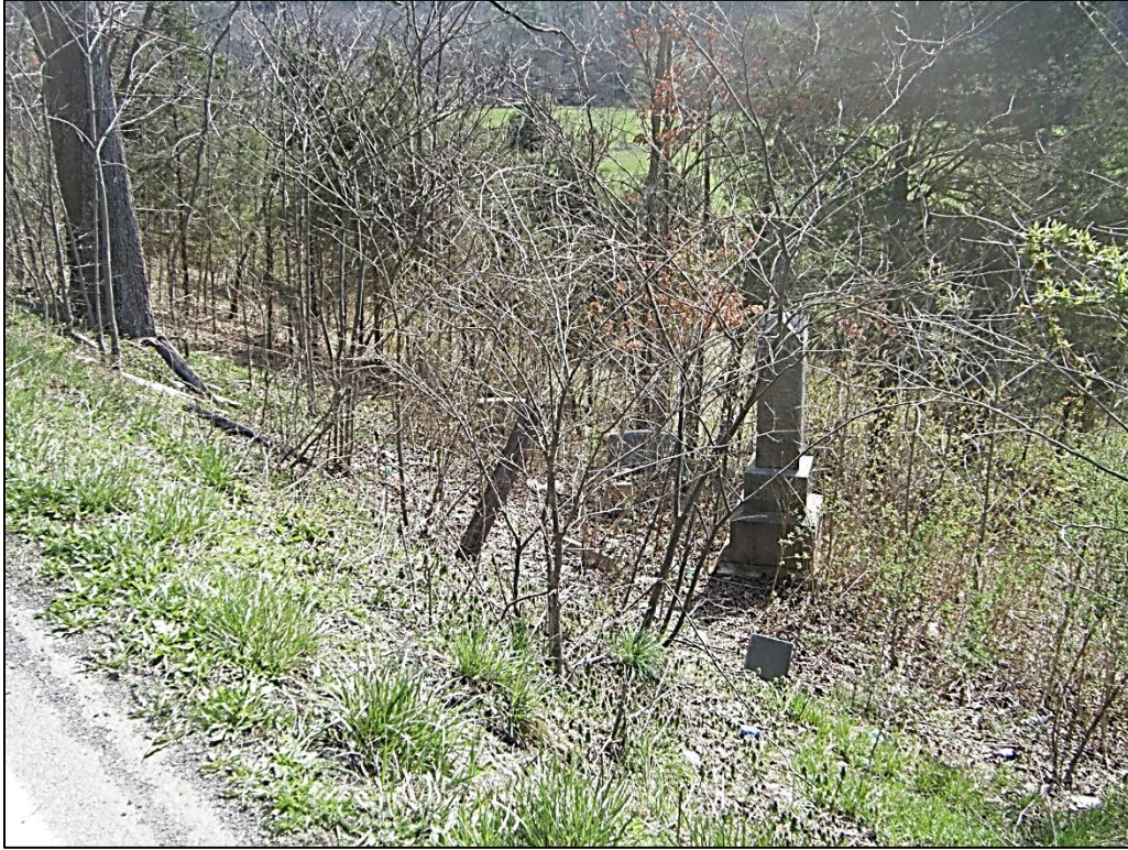
Photograph of 46-HM-142, looking northeast.