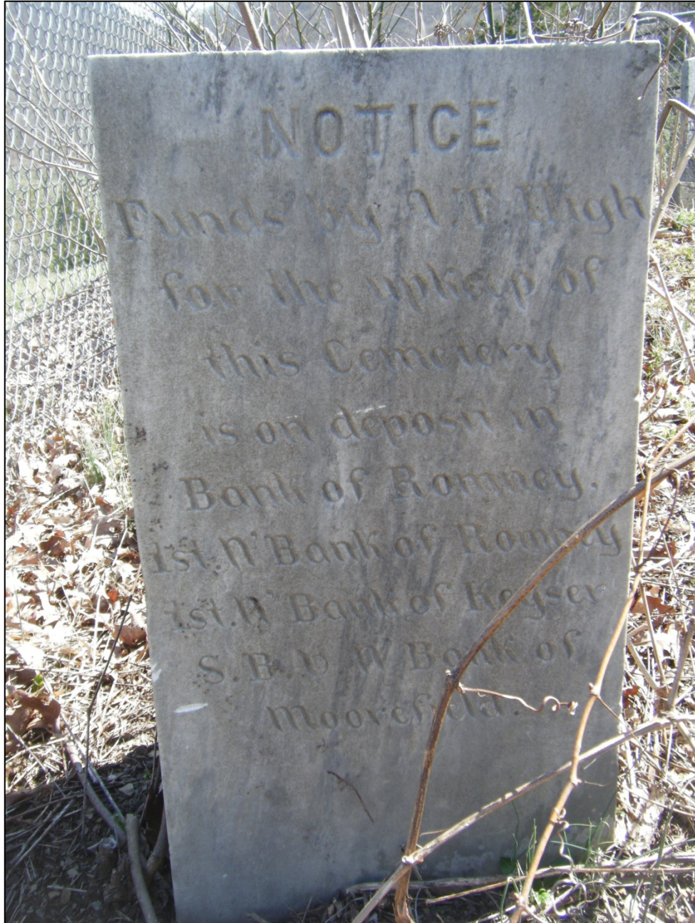
Photograph of a marker encountered at 46-HM-144.