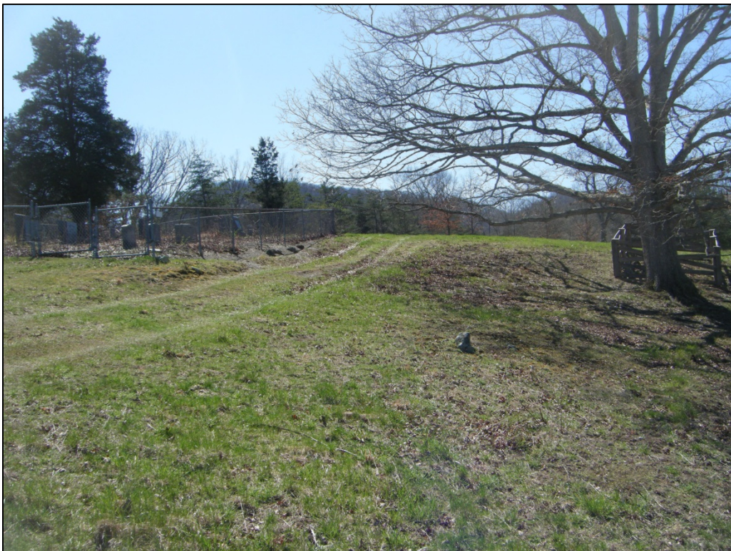
Photograph of 46-HM-144, looking southeast.