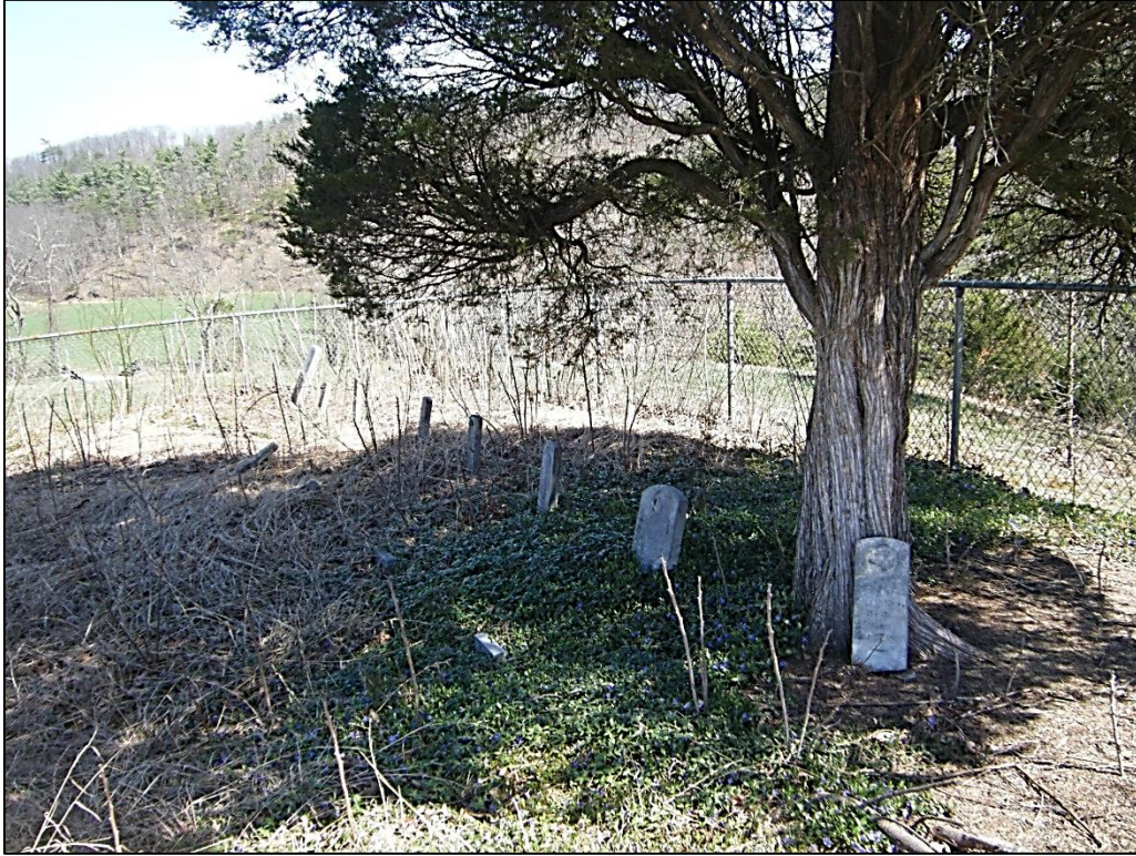
Photograph of 46-HM-144, looking northeast.