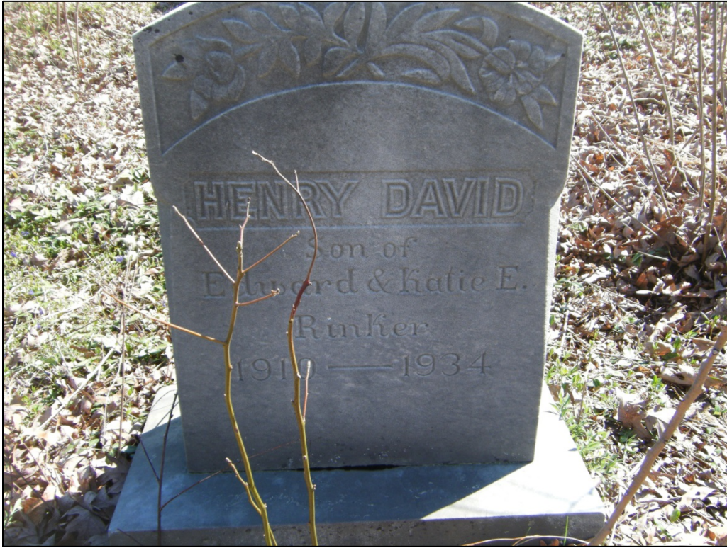
Photograph of a headstone documented at 46-HM-144.