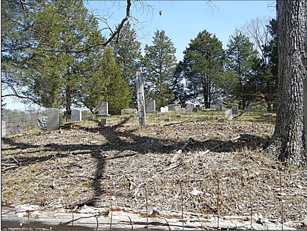
Photograph of 46-HM-146, looking south.