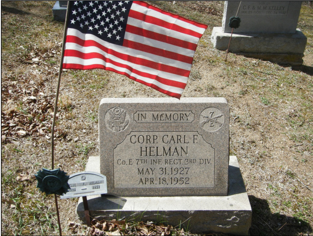
Photograph of a veteran's headstone documented at 46-HM-146.