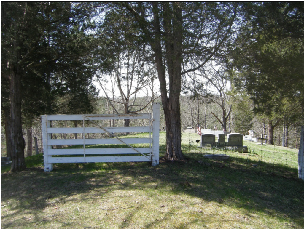
Photograph of 46-HM-146, looking north.