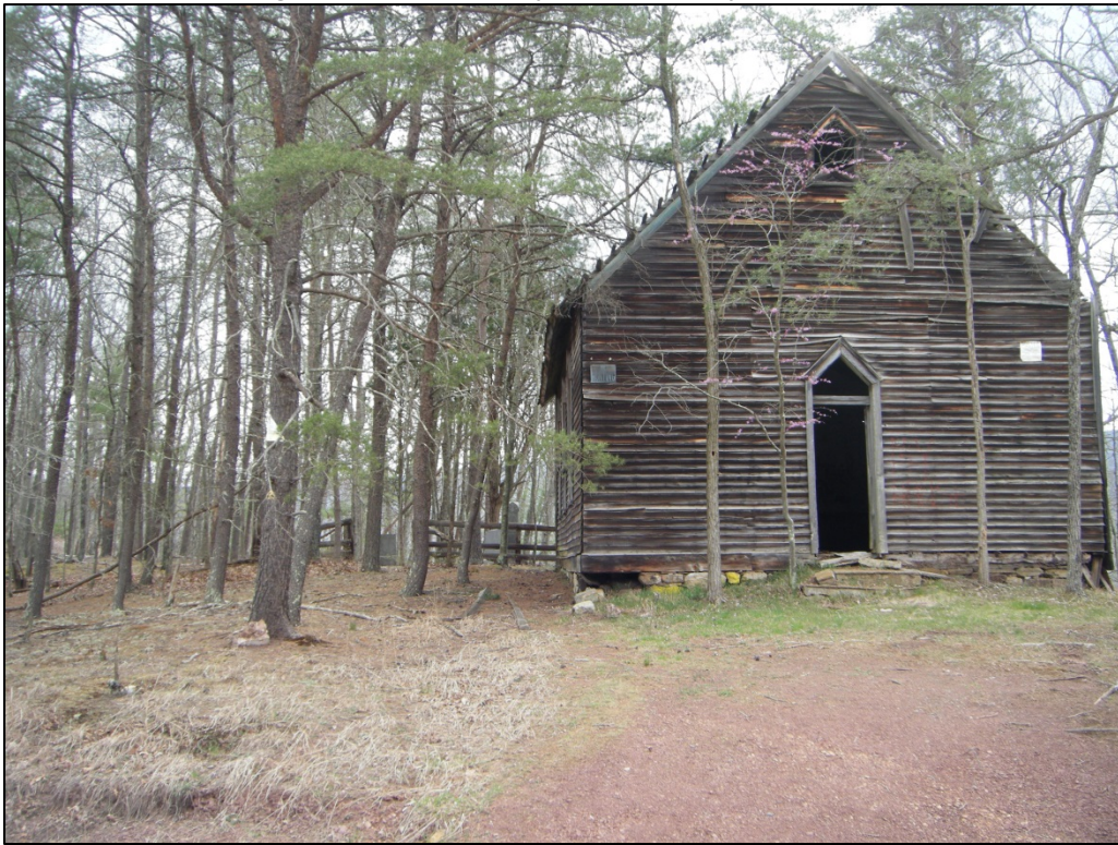
Photograph of 46-HM-149, looking southeast.