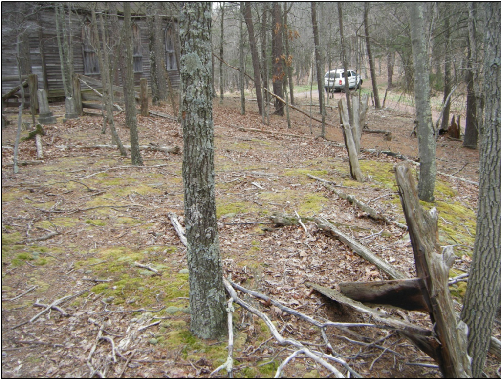
Photograph of 46-HM-149 showing depressions of unmarked graves.