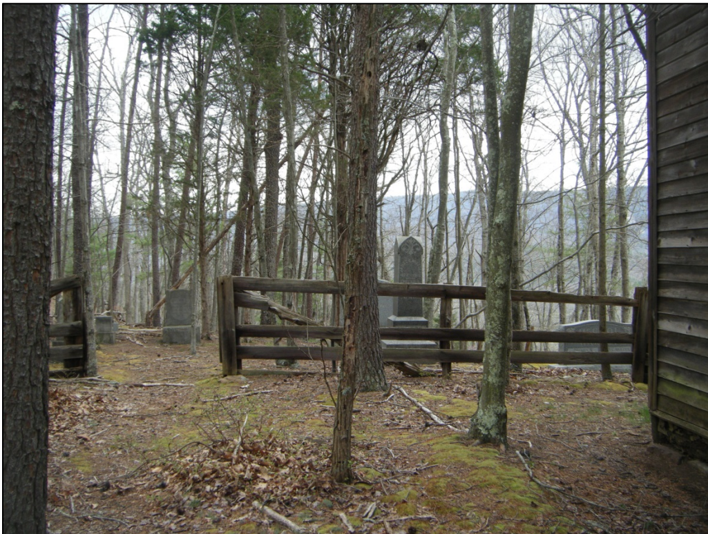
Photograph of 46-HM-149, looking southeast.