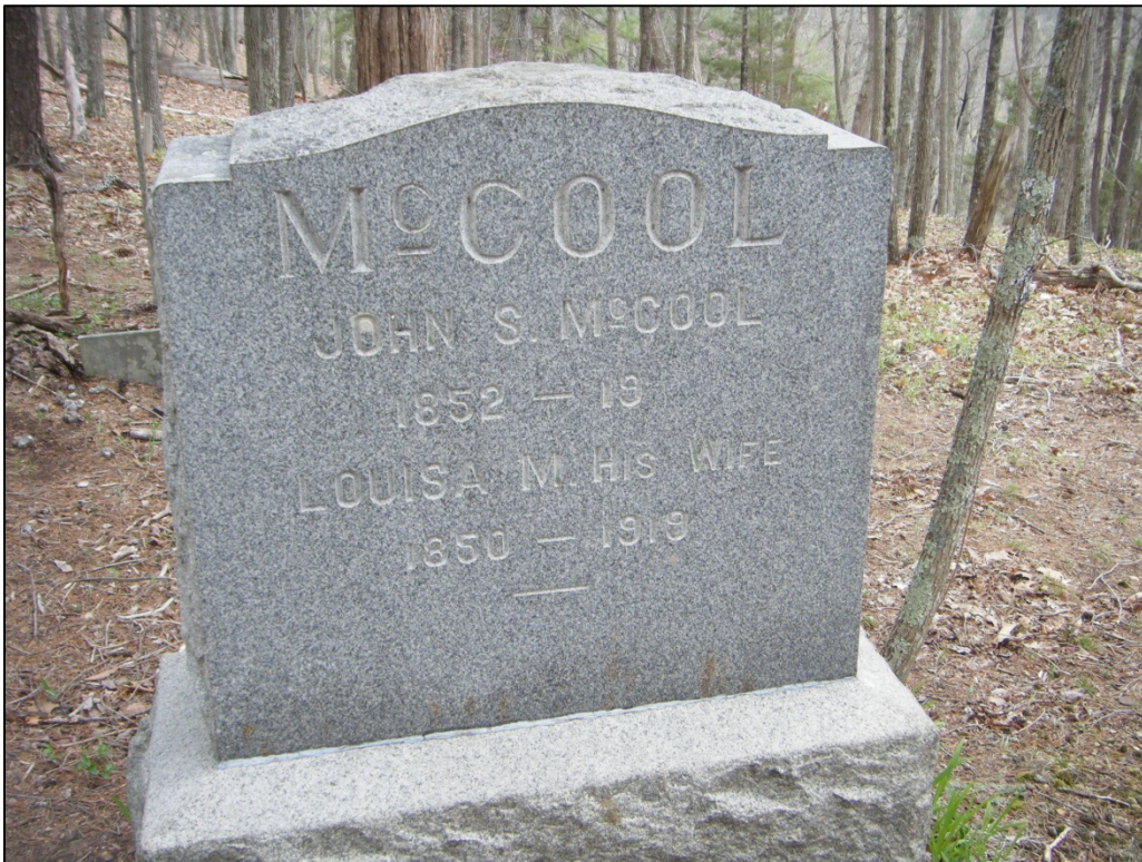
Photograph of a headstone documented at 46-HM-149.