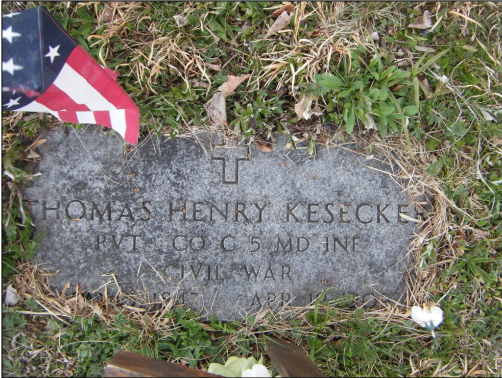
Photograph of a government issued headstone for a Civil War veteran documented at 46-HM-150.