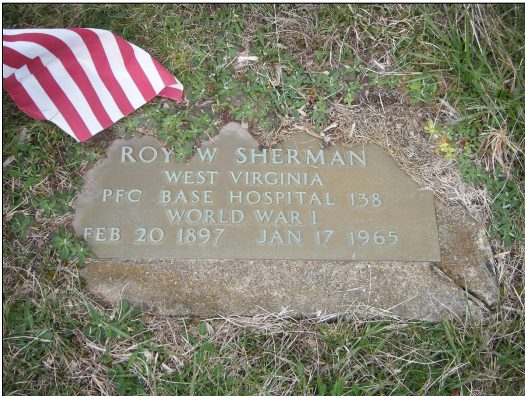
Photograph of a government issued World War I veteran headstone documented at 46-HM-150.