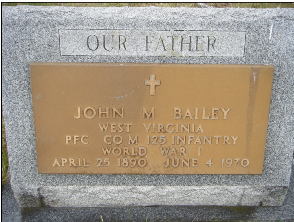
Photograph of a government issued World War I veteran placard on a headstone documented at 46-HM-150.