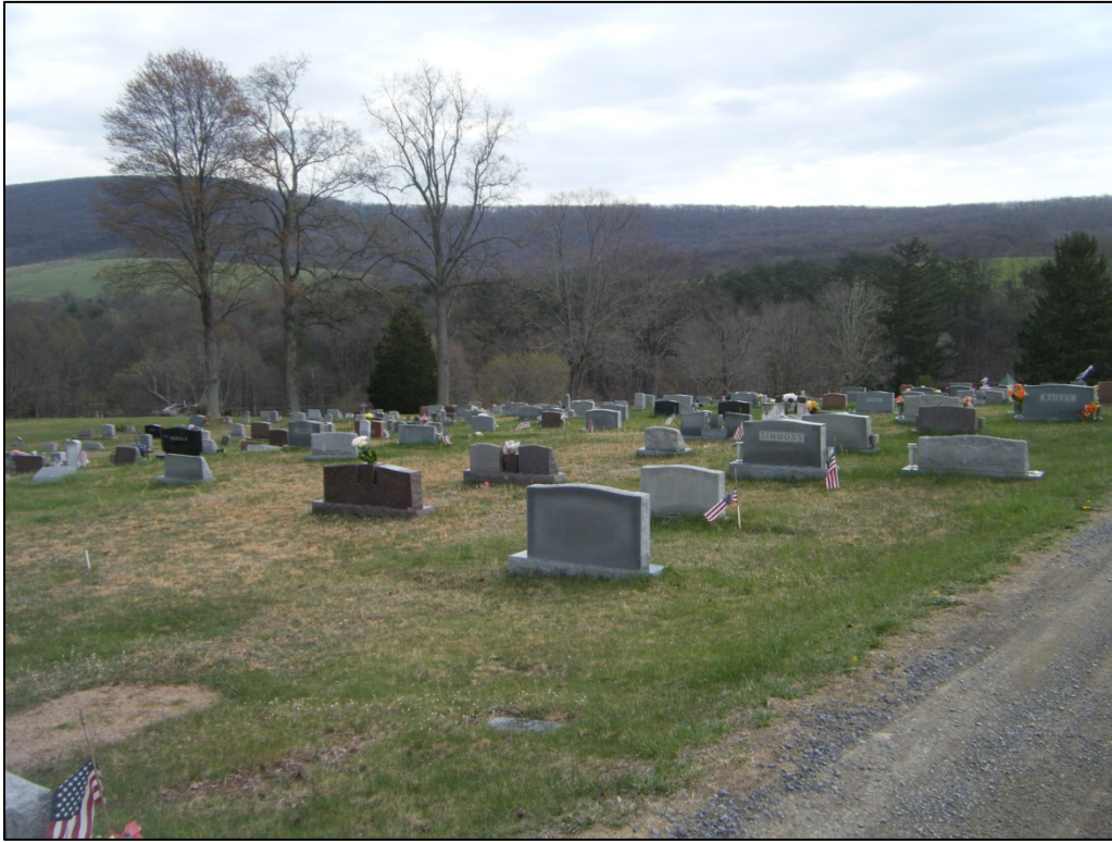
Photograph of 46-HM-150, looking northeast.