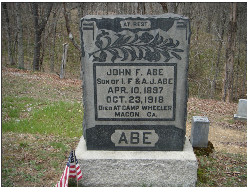
Photograph of a World War I soldier's headstone documented at 46-HM-151.