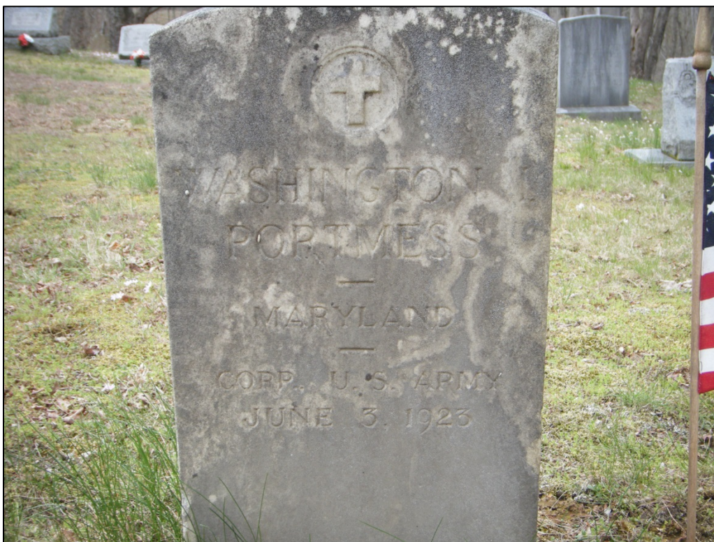
Photograph of a government issued veteran headstone documented at 46-HM-151.