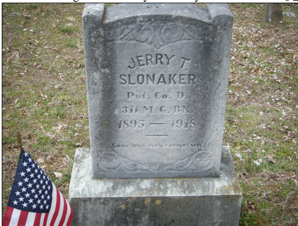
Photograph of a World War I soldier's headstone encountered at 46-HM-151.