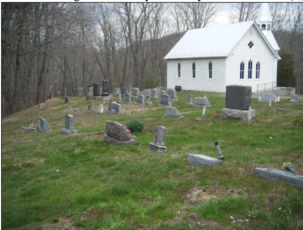
Photograph of 46-HM-151, looking north.