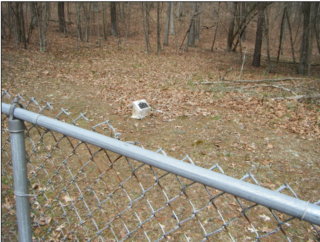
Photograph of a headstone outside of the fenced boundaries of 46-HM-154, looking southwest.