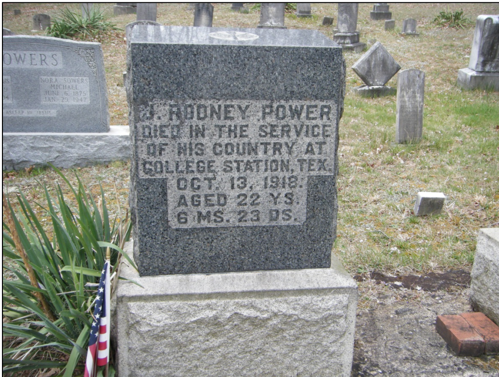
Photograph of a World War I veteran headstone documented at 46-HM-154.