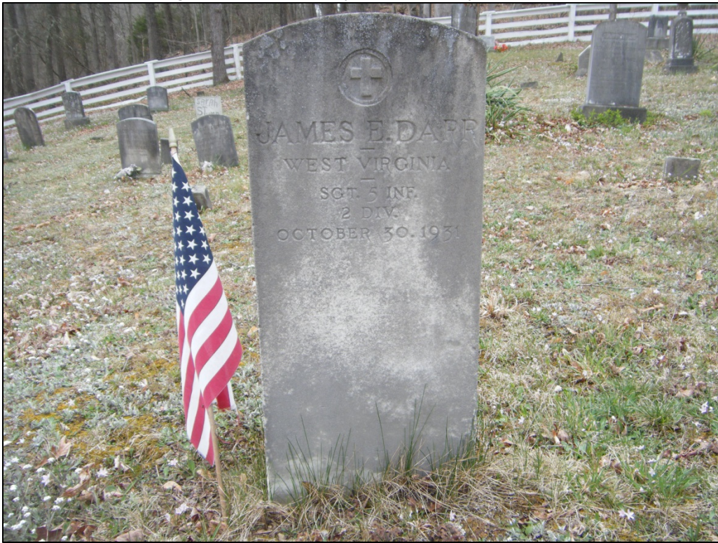
Photograph of a government issued veteran headstone documented at 46-HM-154.