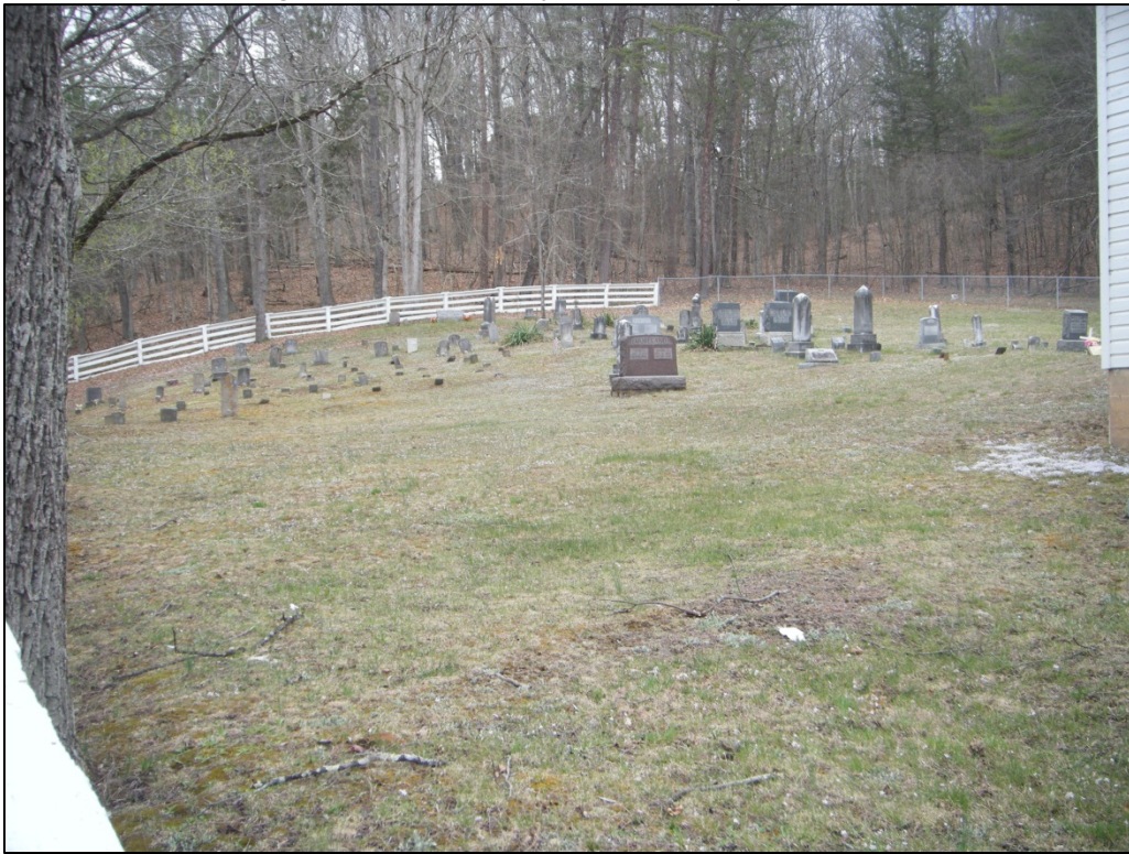
Photograph of 46-HM-154, looking southwest.