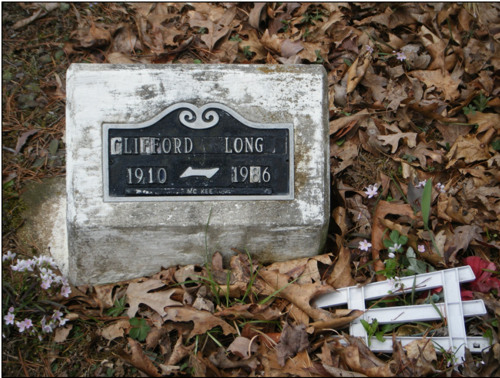
Photograph of a close-up view of the headstone that is situated outside of the fenced boundaries of 46-HM-154.