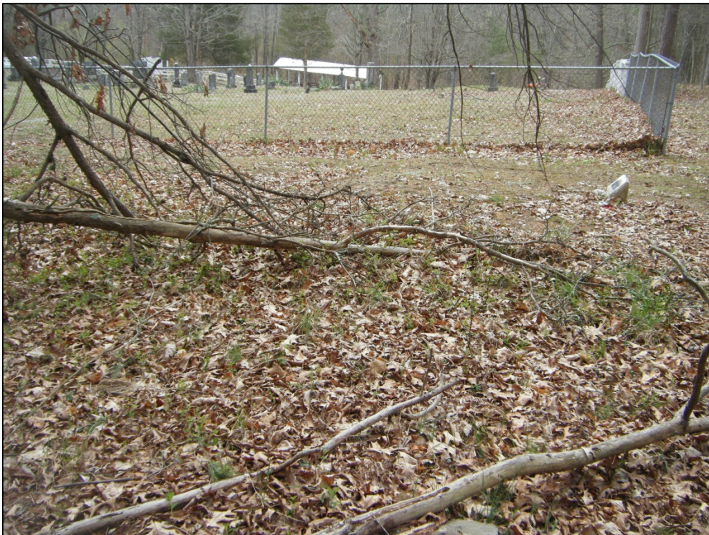
Photograph of 46-HM-154, looking northeast.