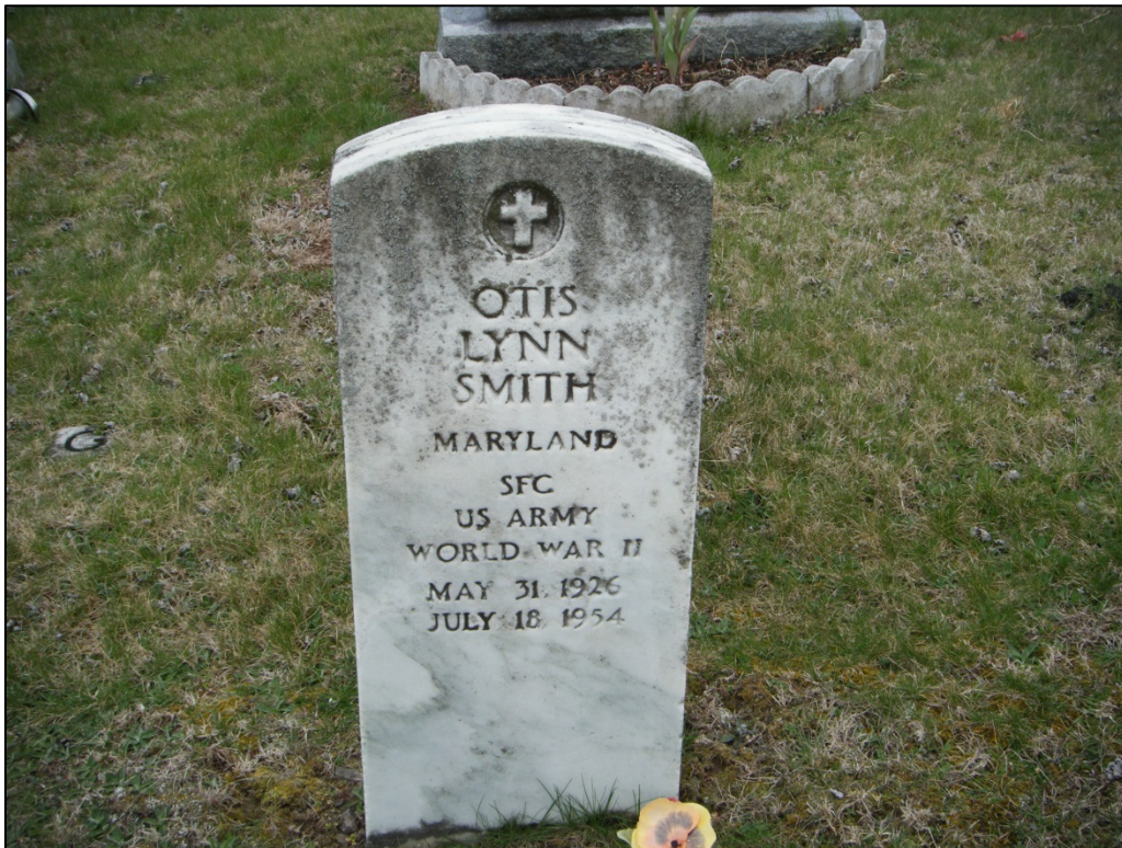
Photograph of a government issued World War II veteran headstone documented at 46-HM-156.