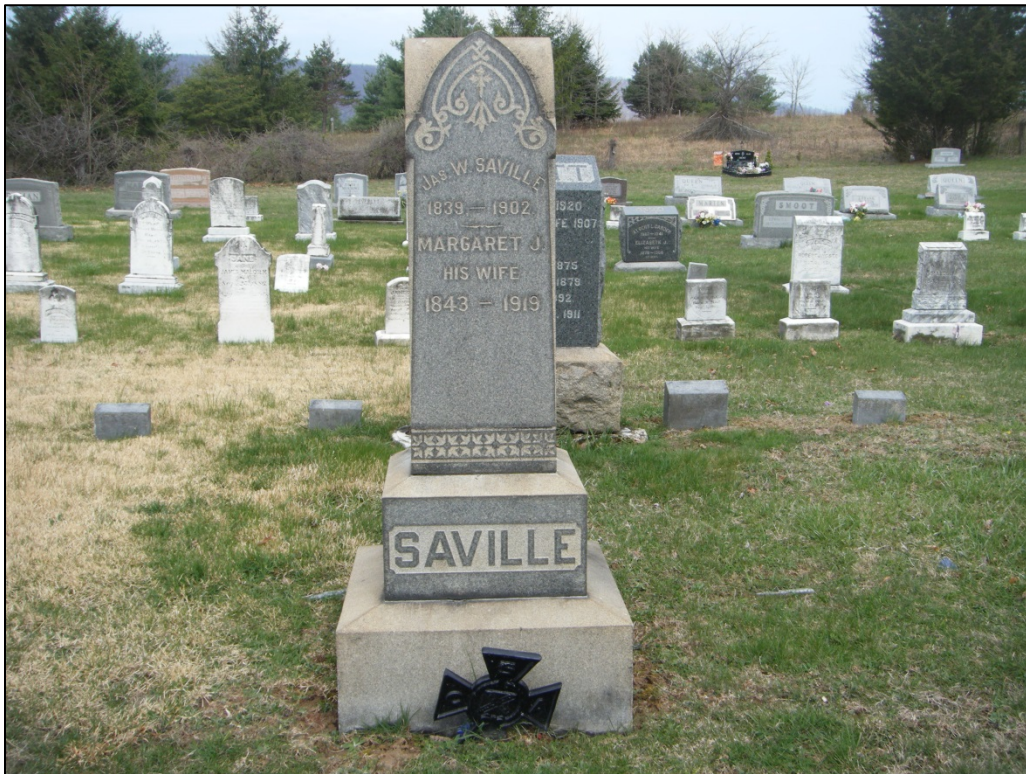
Photograph of a headstone and Confederate soldier marker documented at 46-HM-156.