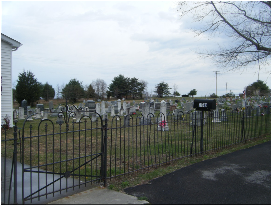
Photograph of 46-HM-156, looking northwest.