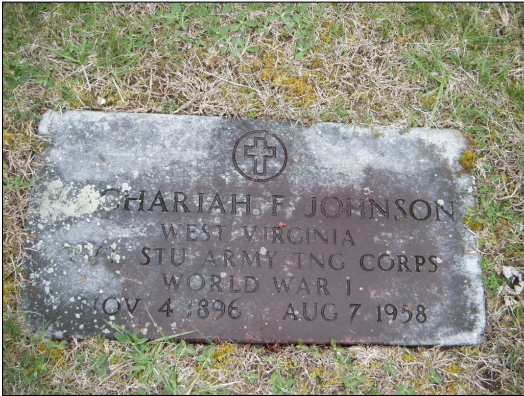
Photograph of a government issued World War I veteran headstone encountered at 46-HM-156.