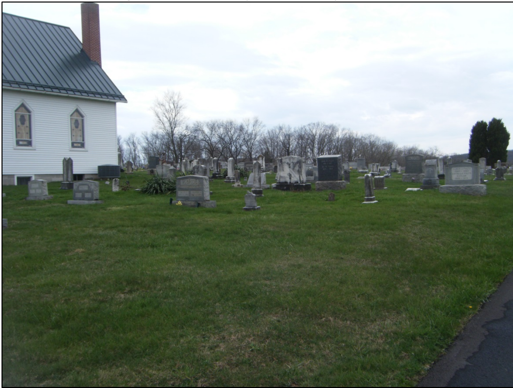
Photograph of 46-HM-157, looking west.