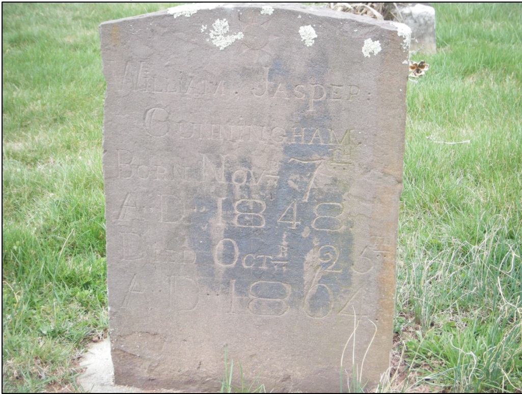
Photograph of a headstone documented at 46-HM-157.