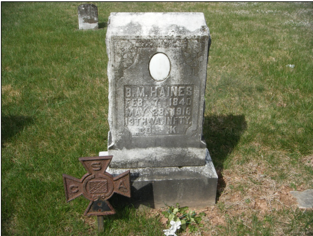
Photograph of a headstone and Confederate Soldier's Marker documented at 46-HM-157.