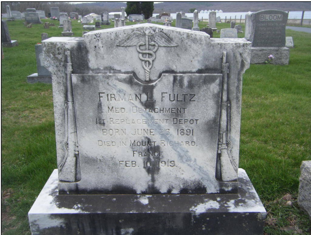
Photograph of a headstone documented at 46-HM-157.