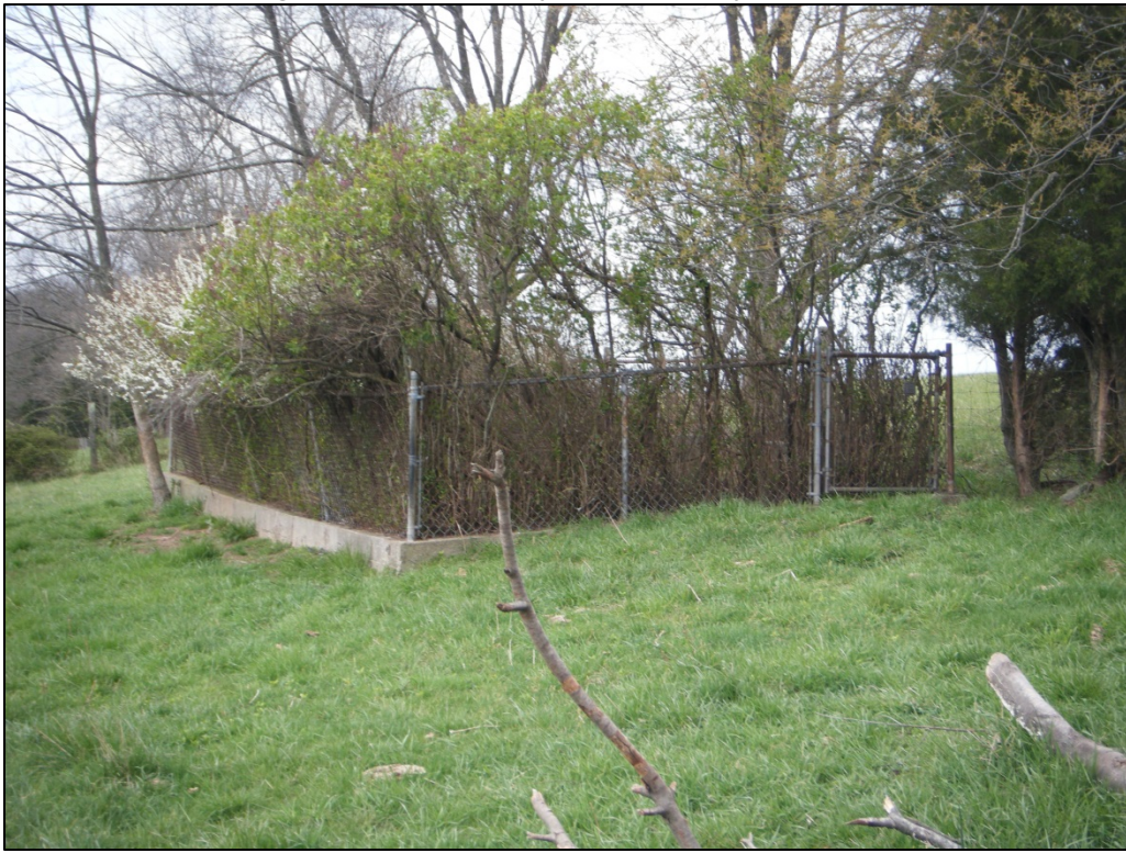
Photograph of 46-HM-158, looking southwest.