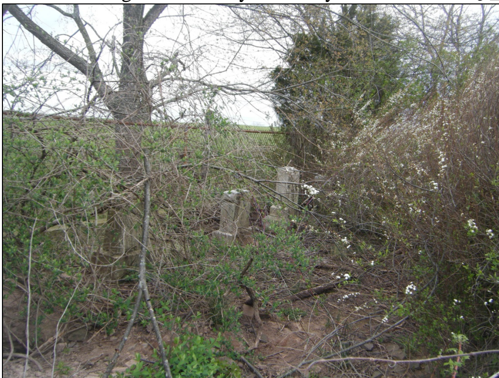
Photograph of 46-HM-158, looking west.