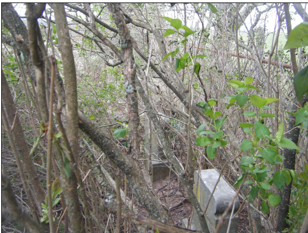
Photograph of headstones documented at 46-HM-158 showing the vegetation overgrowth.