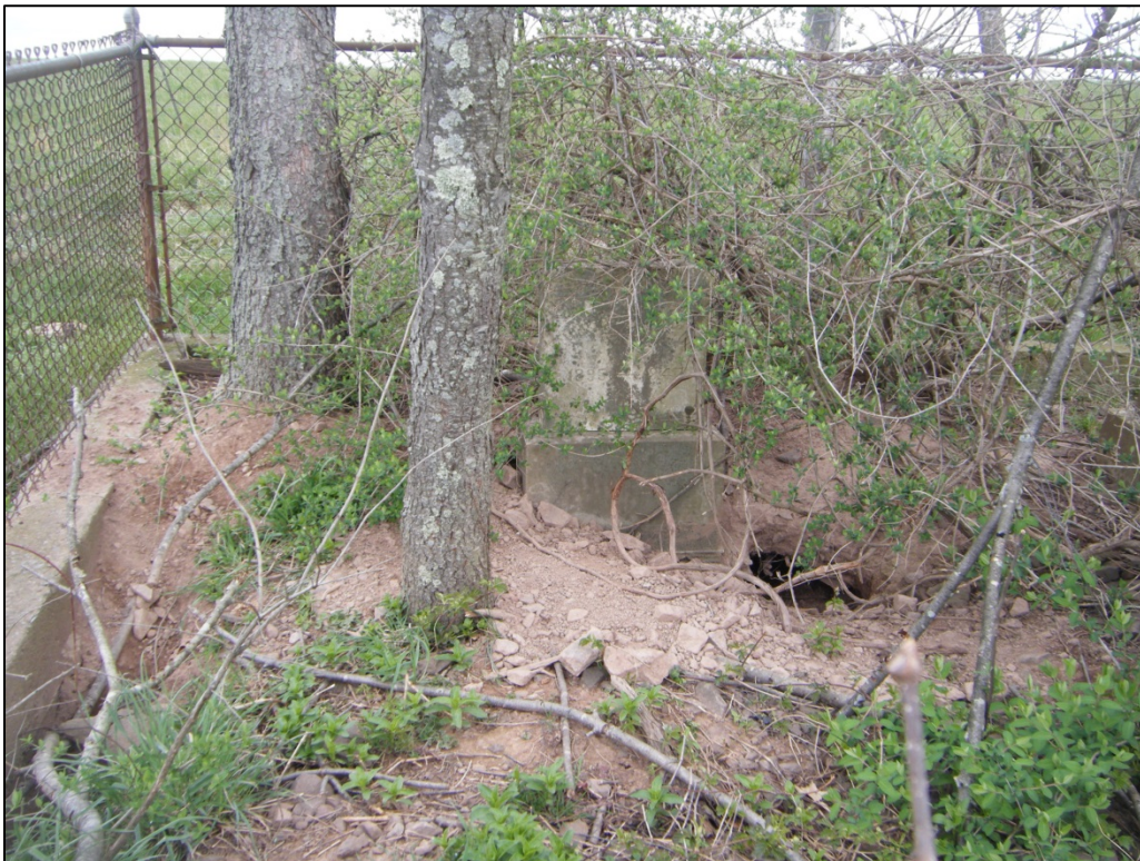
Photograph of 46-HM-158 showing damage from trees and animal burrowing activities, looking south.