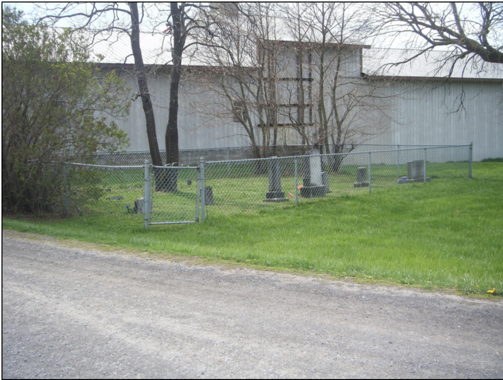
Photograph of 46-HM-160, looking southeast.