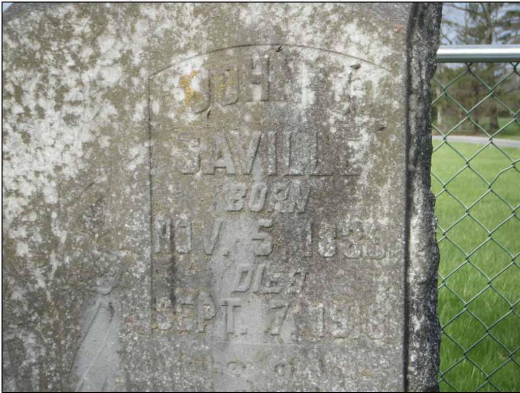
Photograph of an unusual headstone with the inscription to the side of the marker; documented at 46-HM-160.