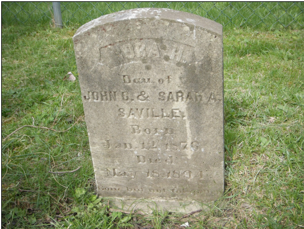
Photograph of a headstone encountered at 46-HM-160.