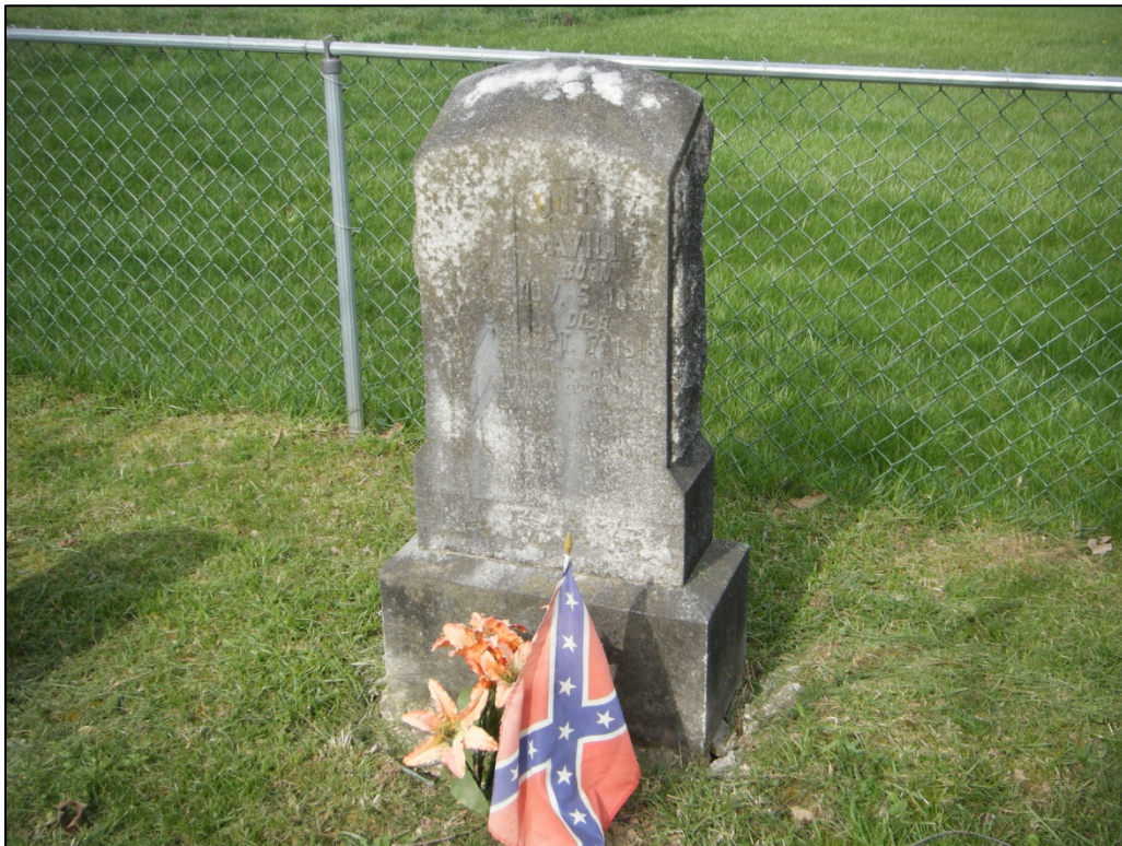
Photograph of the unusual headstone documented at 46-HM-160.