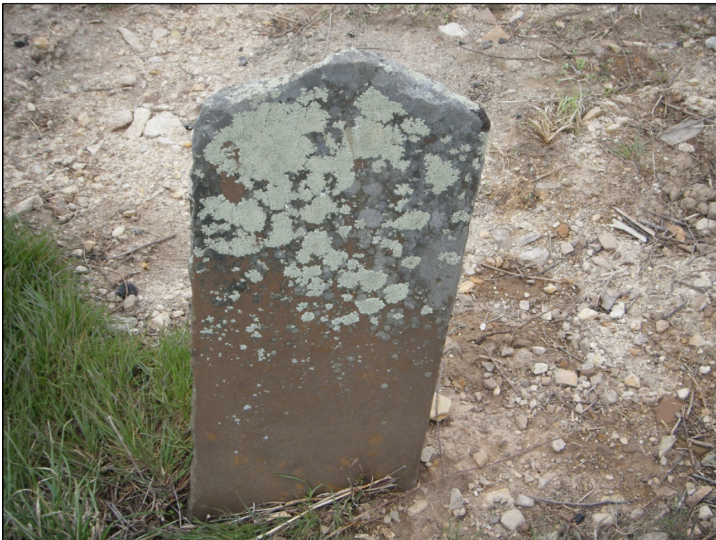
Photograph of a broken and standing headstone encountered at 46-HM-162.