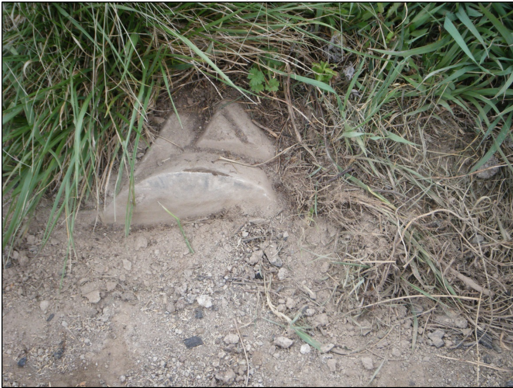
Photograph of a broken and partially buried headstone documented at 46-HM-162.