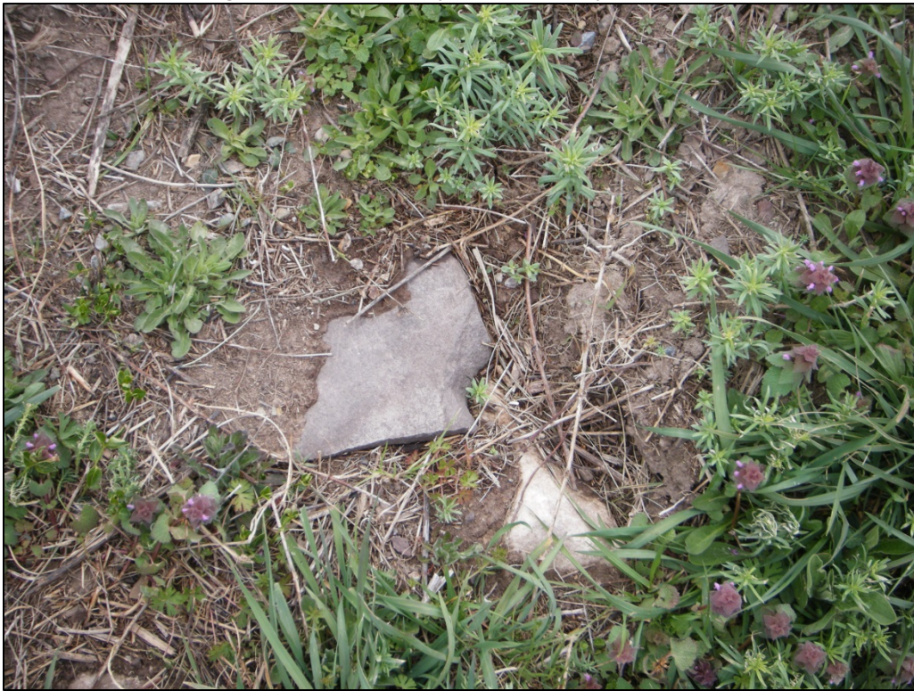
Photograph of buried and broken markers encountered at 46-HM-162.