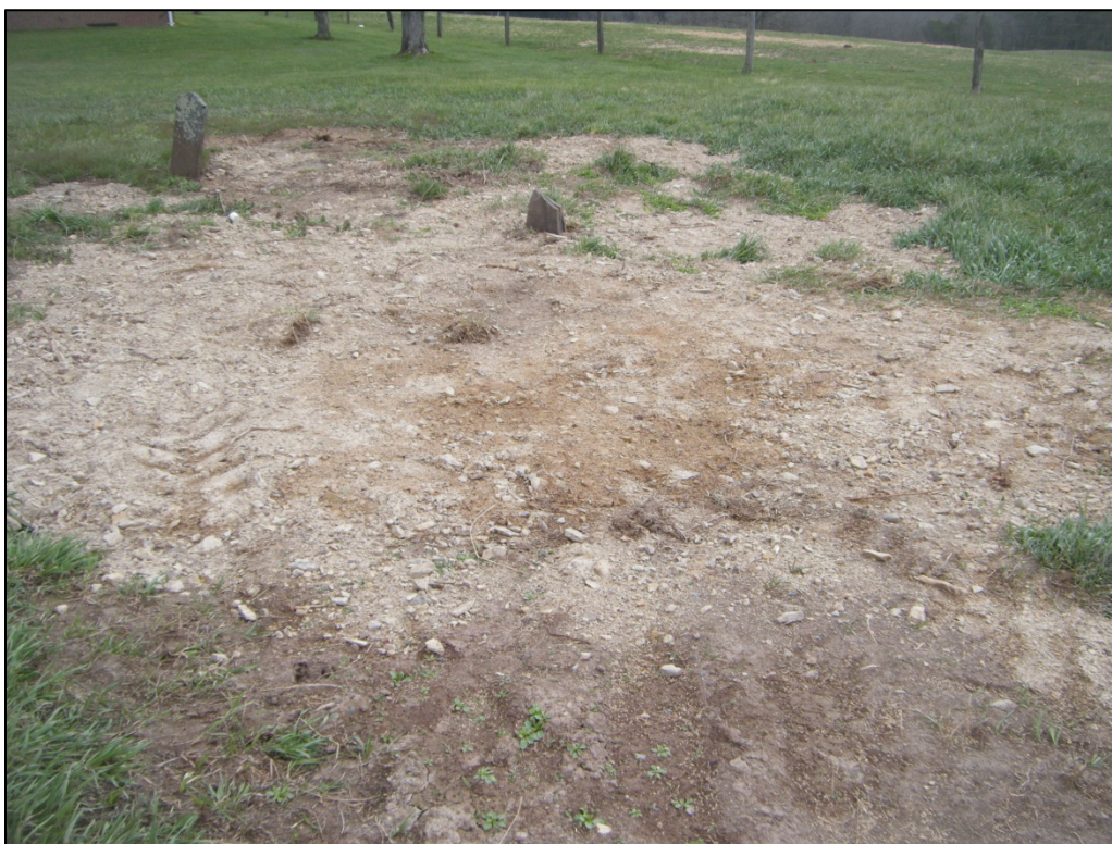
Photograph of disturbances documented at 46-HM-162.