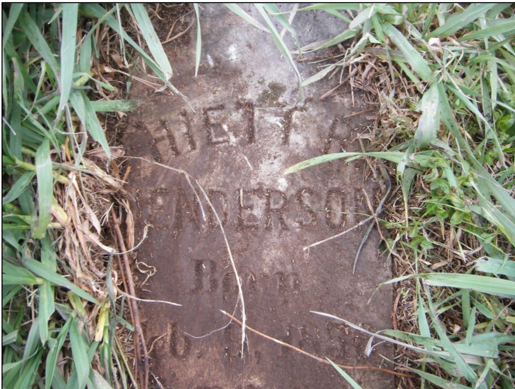
Photograph of a fallen marker documented at 46-HM-162.