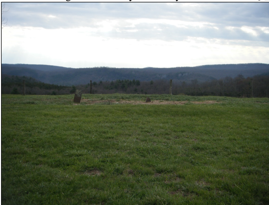
Photograph of 46-HM-162, looking south.