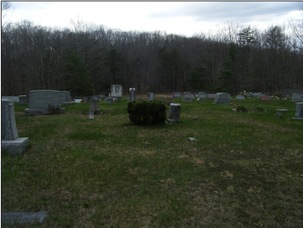
Photograph of 46-HM-168, looking west.