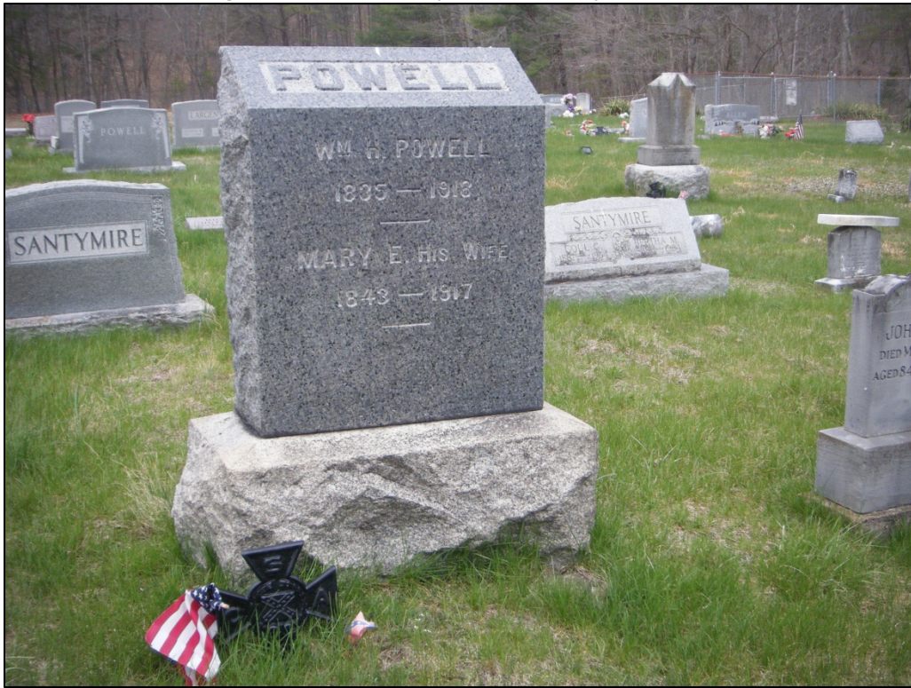
Photograph of a headstone documented at 46-HM-168.