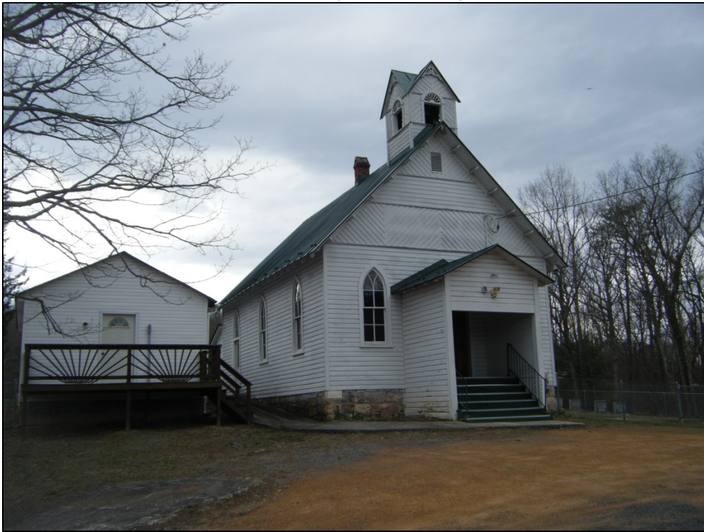
Photograph of 46-HM-168, looking west.