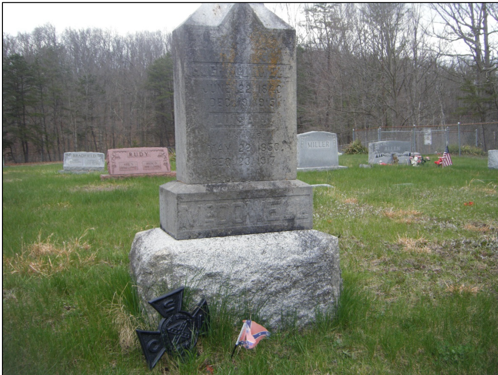
Photograph of a headstone documented at 46-HM-168.