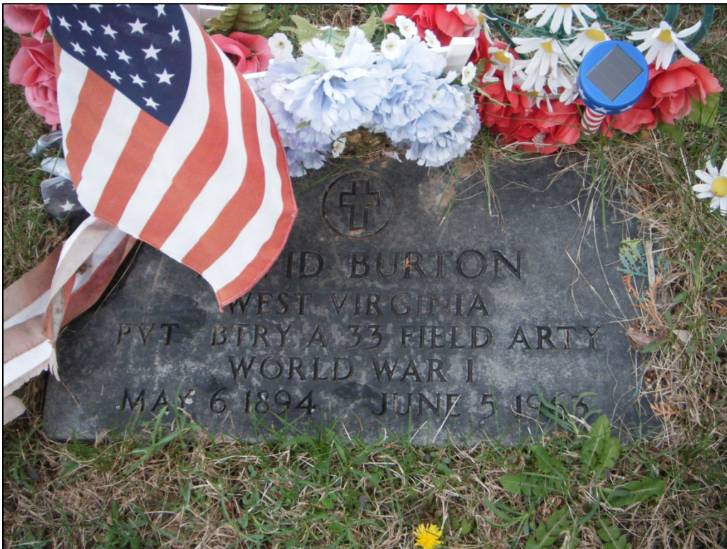
Photograph of a government issued World War I veteran headstone encountered at 46-HM-169.