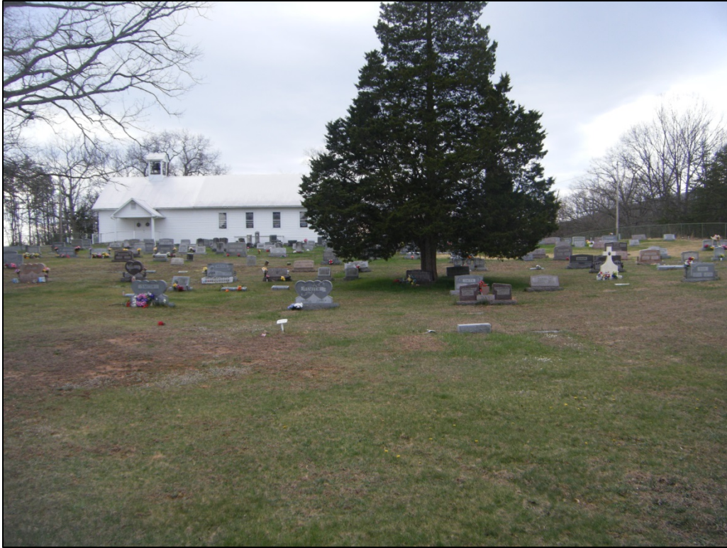
Photograph of 46-HM-169, looking south.