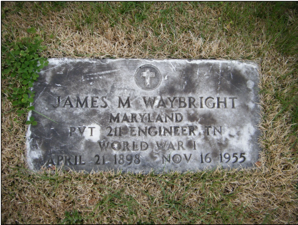
Photograph of a government issued World War I veteran headstone documented at 46-HM-169.