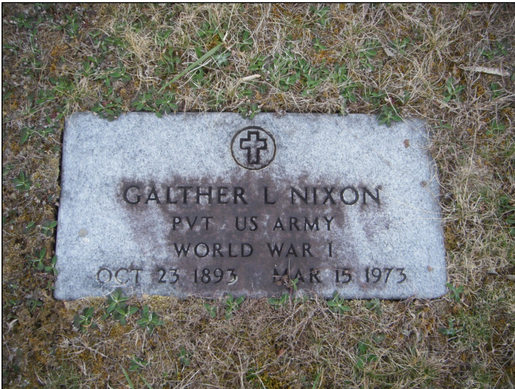
Photograph of a government issued World War I veteran headstone documented at 46-HM-169.