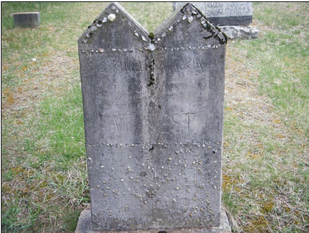
Photograph of a double headstone for a husband and wife documented at 46-HM-170.