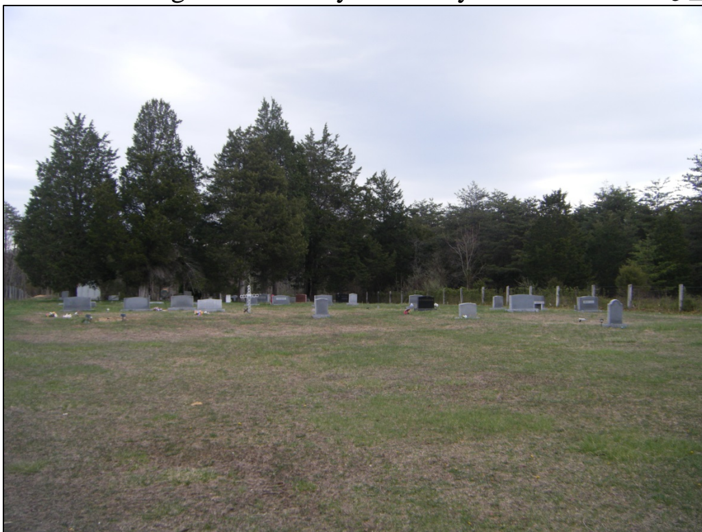
Photograph of 46-HM-170, looking northeast.