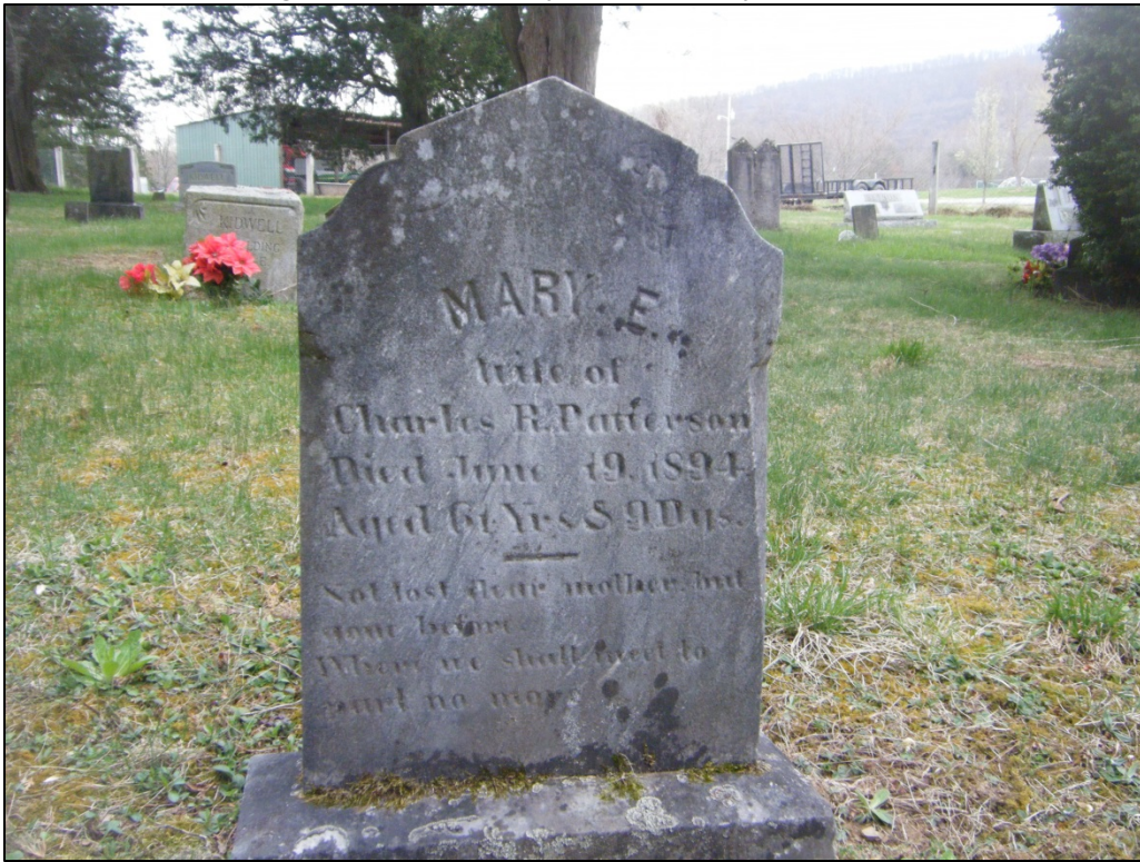
Photograph of a headstone documented at 46-HM-170.