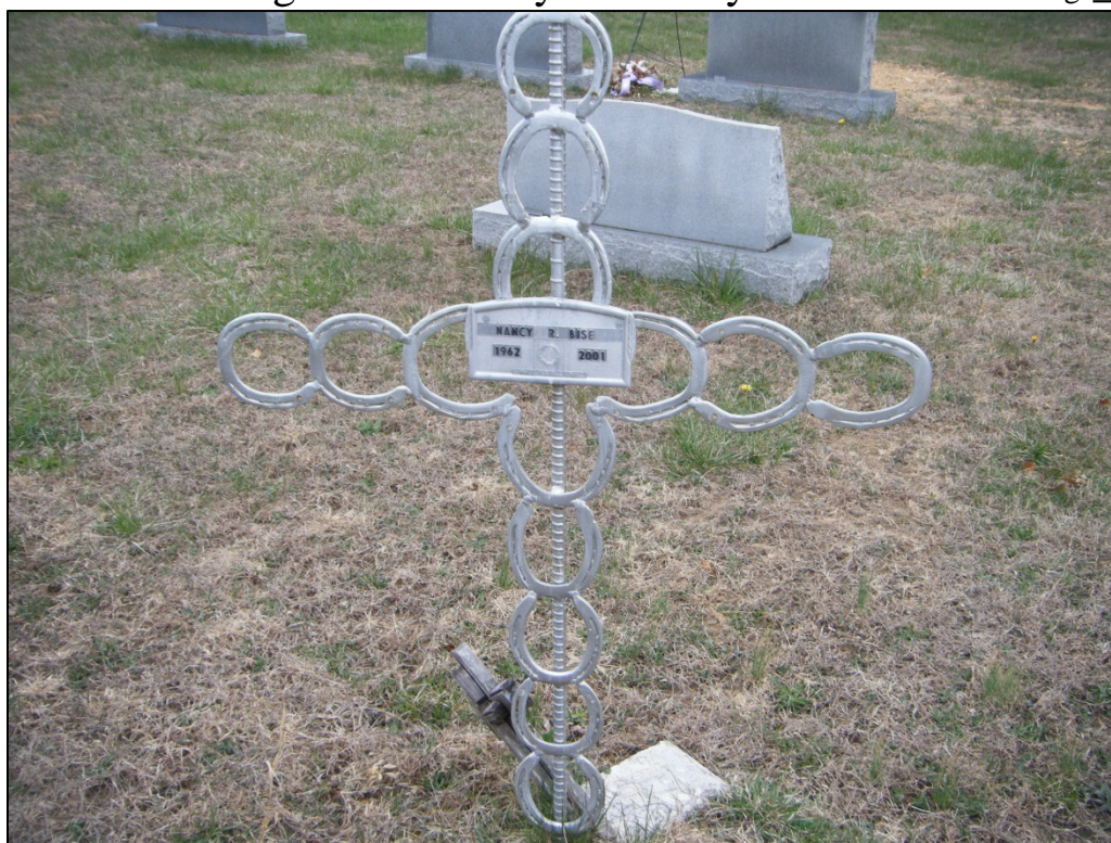
Photograph of a marker documented at 46-HM-170.