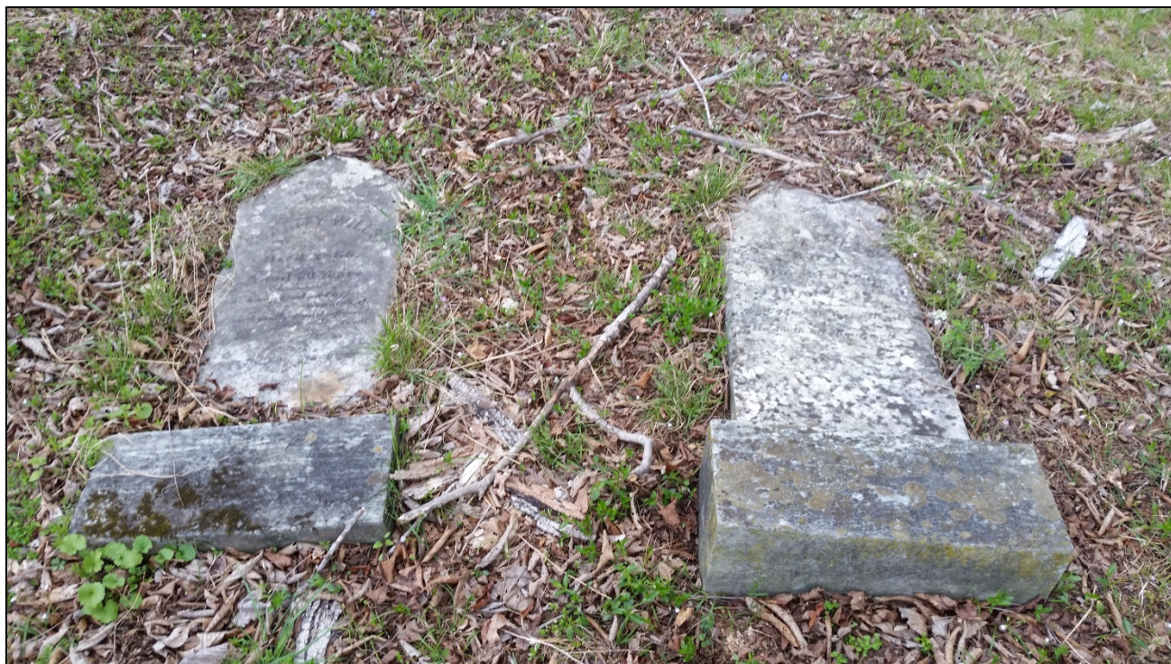
Photograph of toppled headstones documented at 46-HM-171.