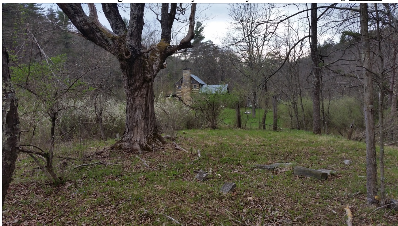
Photograph of 46-HM-171, looking west.