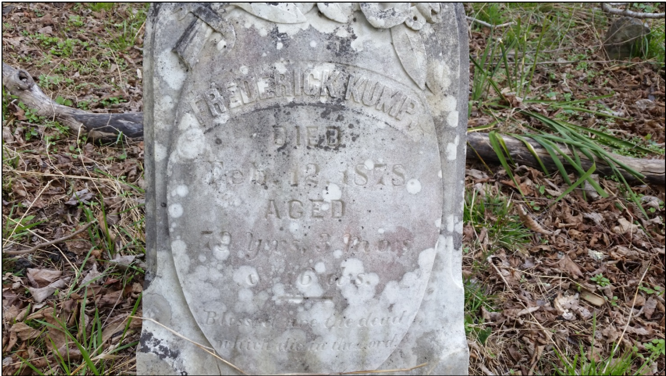
Photograph of a government issued Civil War Union veteran headstone documented at 46-HM-171.