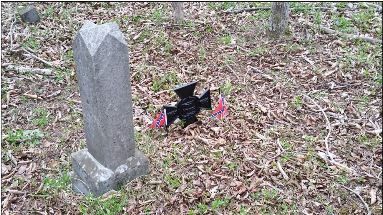
Photograph of a headstone and Confederate soldier marker documented at 46-HM-171.