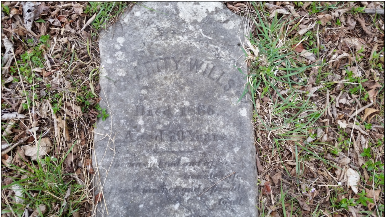
Photograph of a toppled headstone encountered at 46-HM-171.