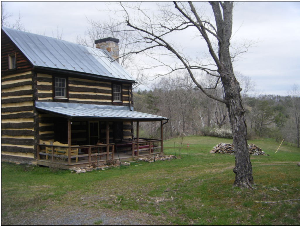
Photograph of 46-HM-171, looking east.