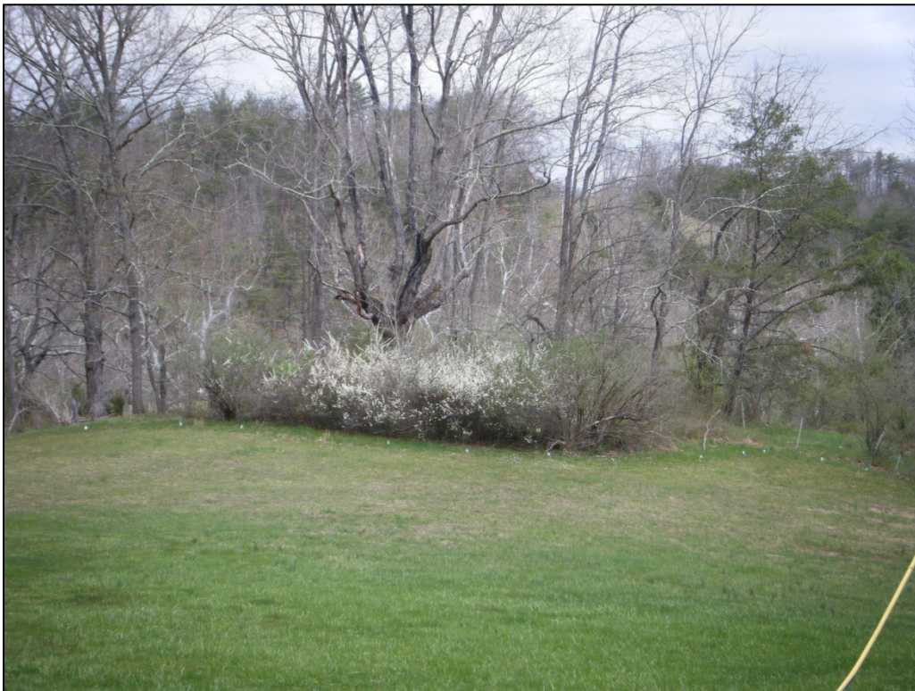
Photograph of 46-HM-171, looking east.