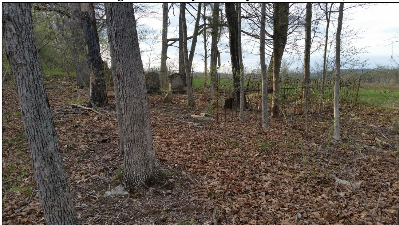
Photograph of 46-HM-172, looking west.