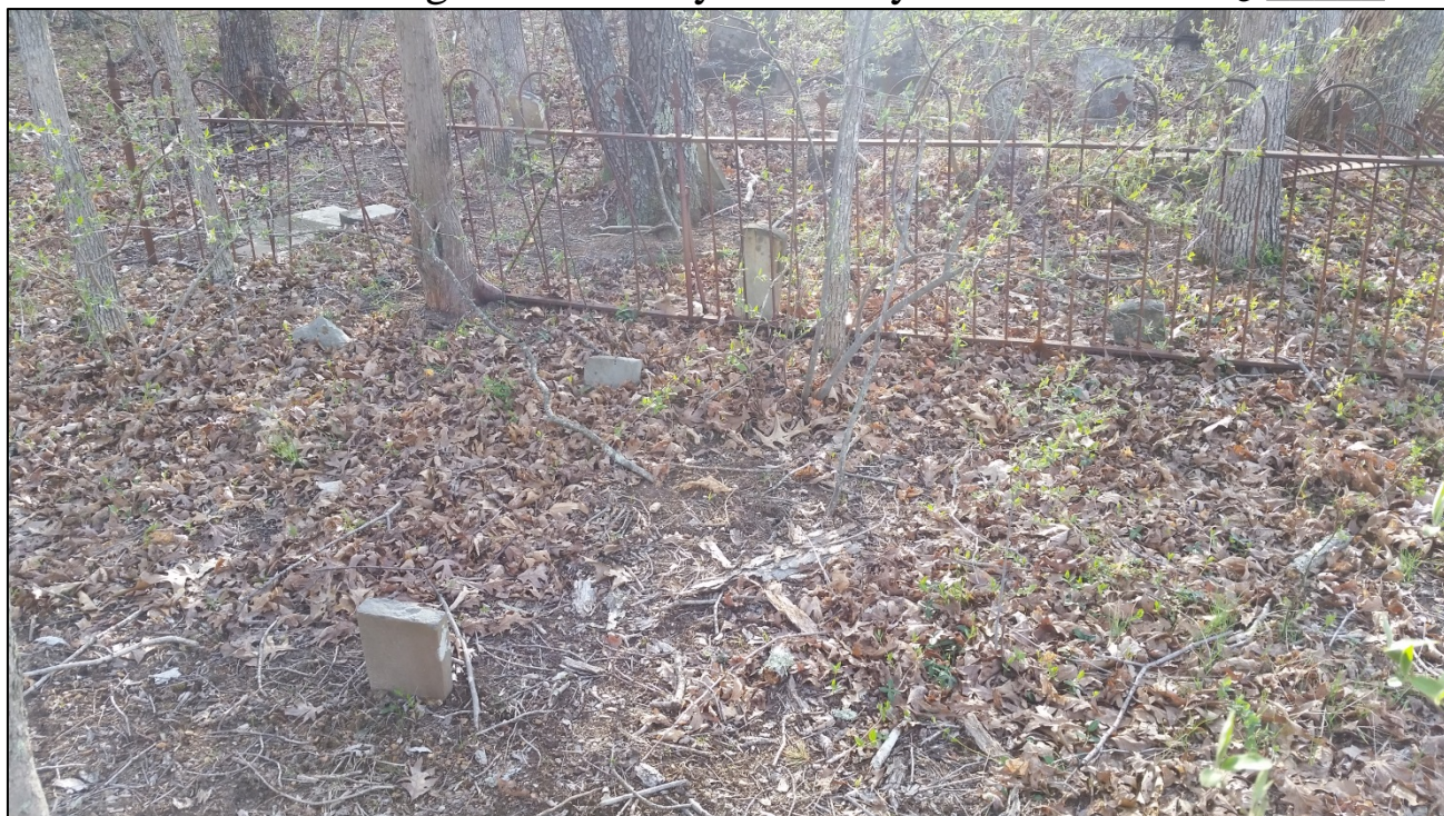
Photograph of headstone situated outside of the fenced area of 46-HM-172.