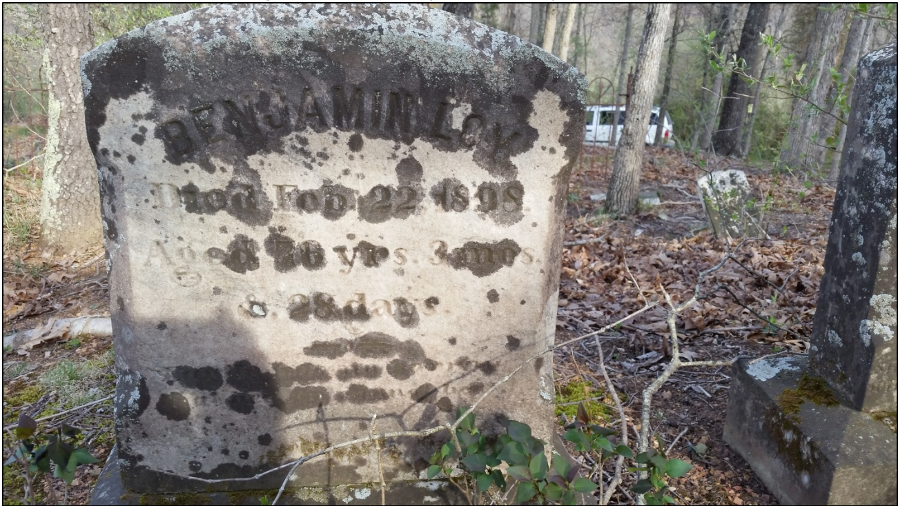
Photograph of a headstone documented at 46-HM-172.