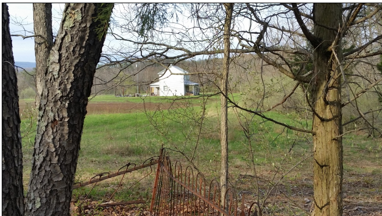
Photograph of 46-HM-172, looking north.