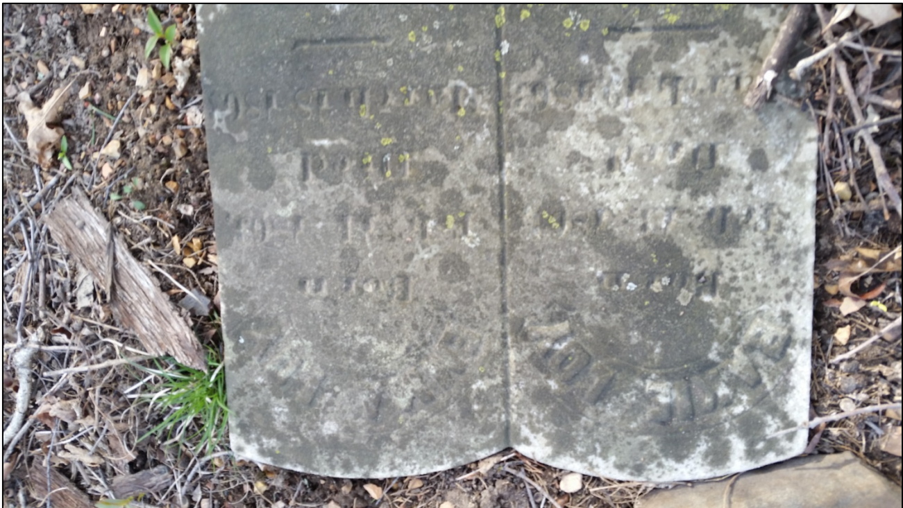
Photograph of a toppled headstone documented at 46-HM-172.