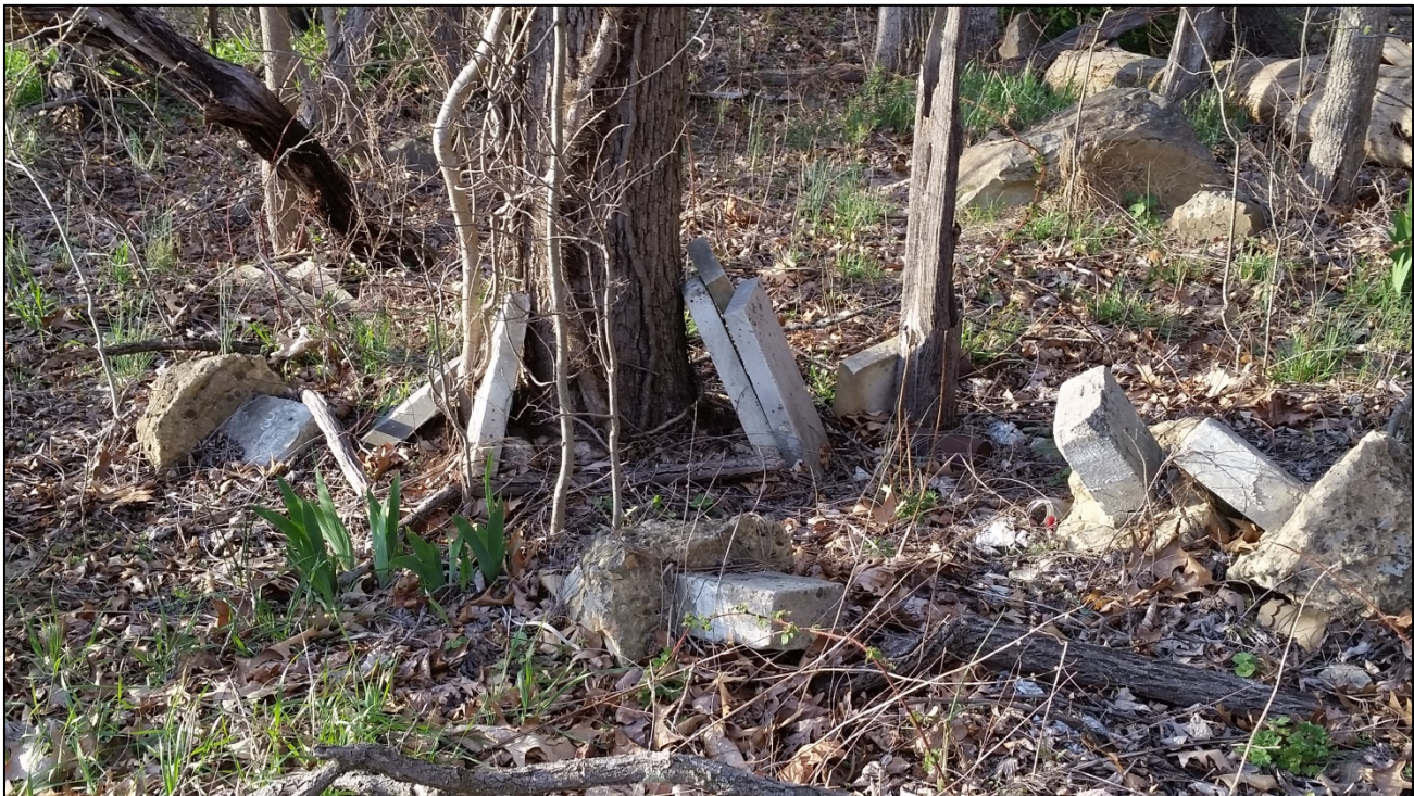
Photograph of a pile of broken and/or removed headstones and footstones documented at 46-HM-173.