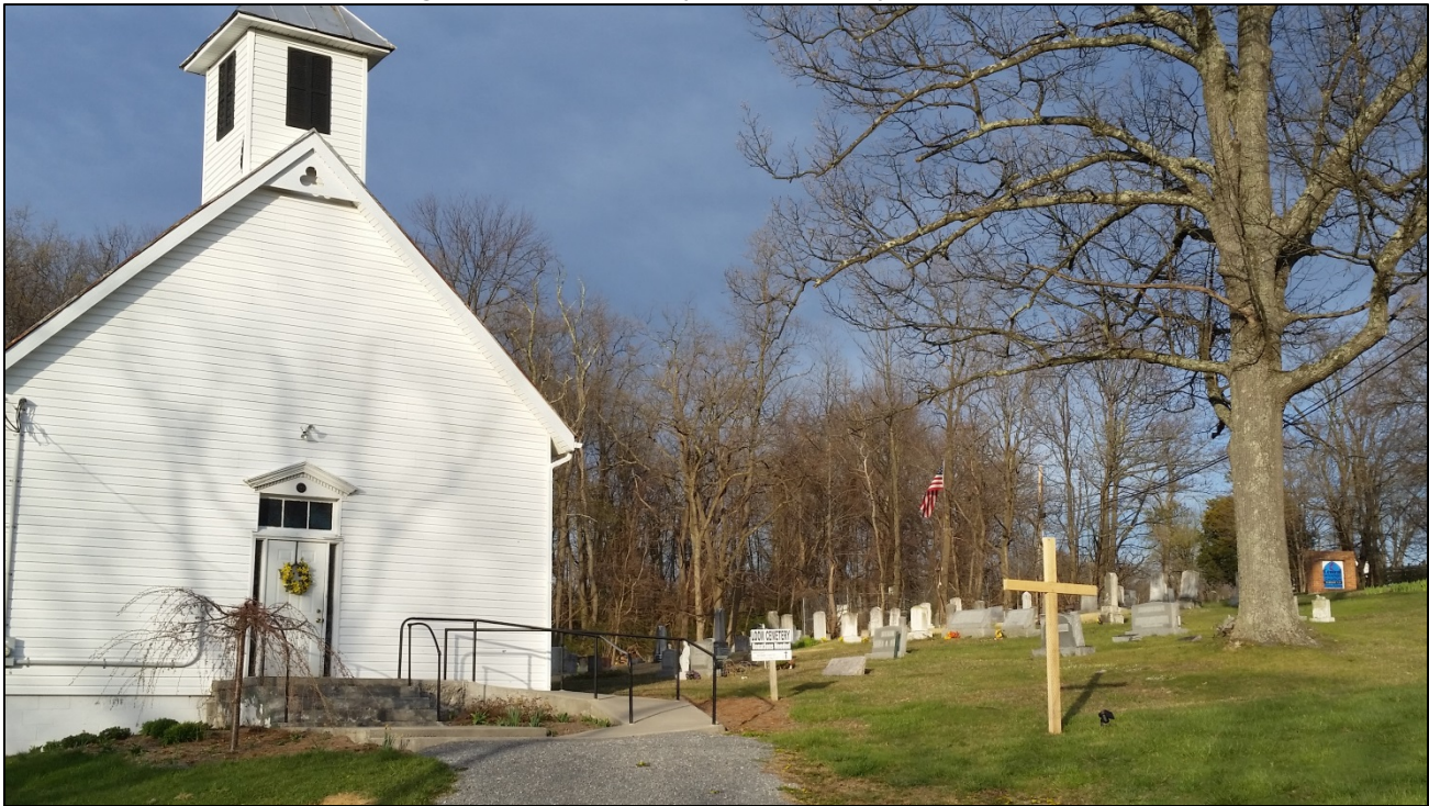
Photograph of 46-HM-173, looking northeast.