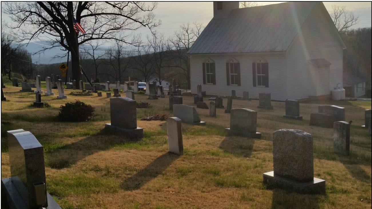
Photograph of 46-HM-173, looking southwest.