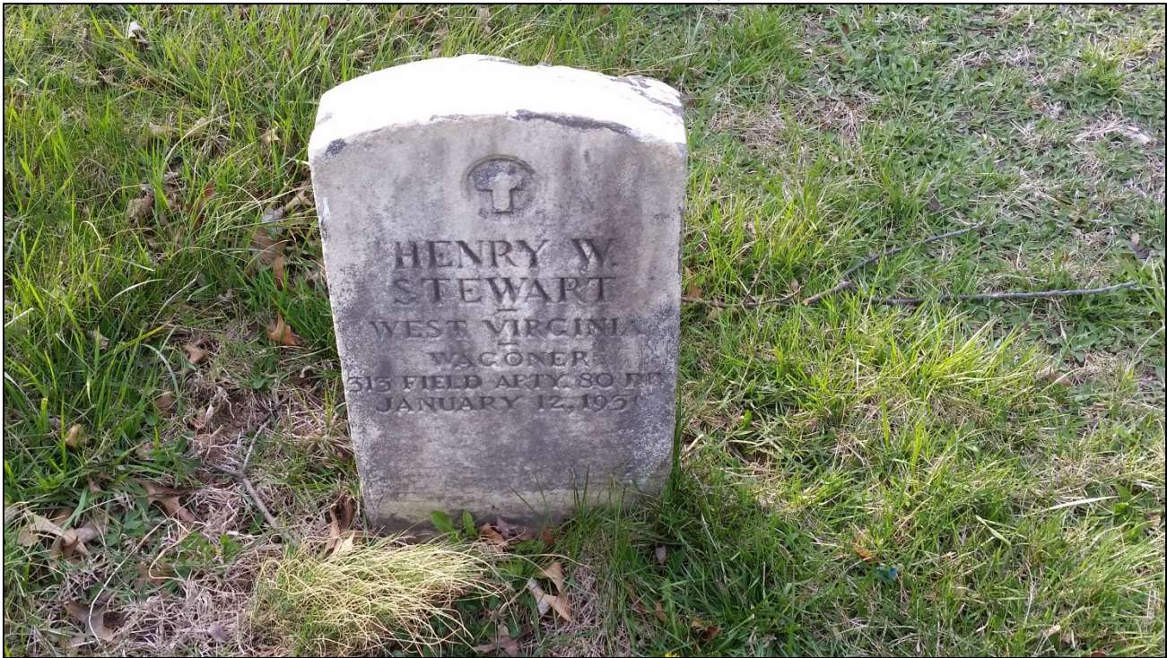
Photograph of a government issued veteran headstone documented at 46-HM-173.