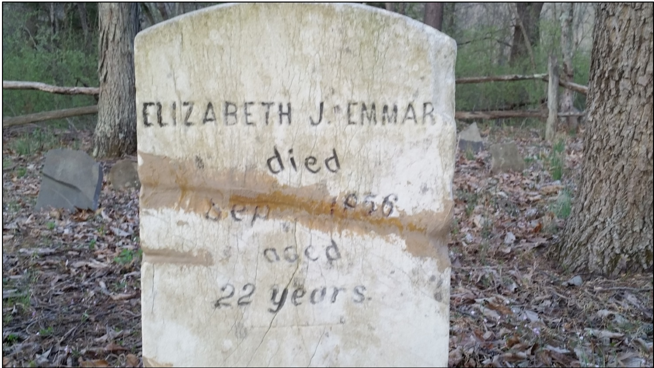
Photograph of a headstone documented at 46-HM-174.