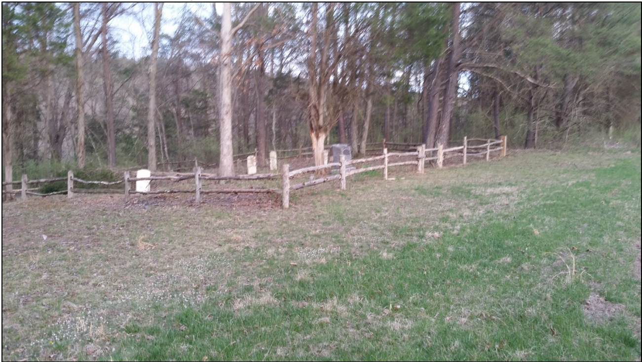
Photograph of 46-HM-174, looking southeast.