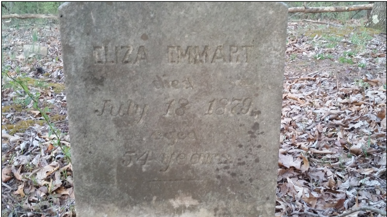
Photograph of a headstone documented at 46-HM-174.