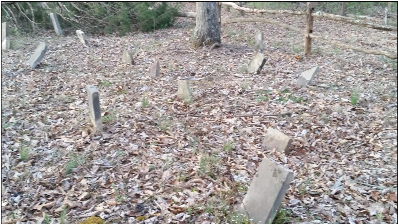
Photograph of tilted headstones documented at 46-HM-174, looking northeast.