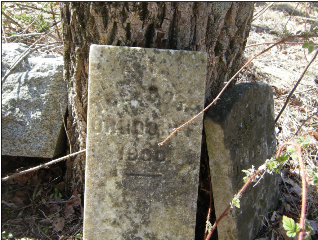
Photograph of a pile of headstones documented at 46-HM-177.