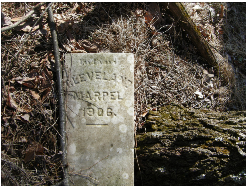
Photograph of a headstone documented at 46-HM-177.