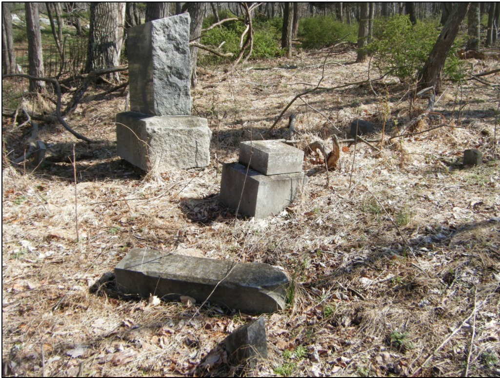
Photograph of toppled headstones documented at 46-HM-177.