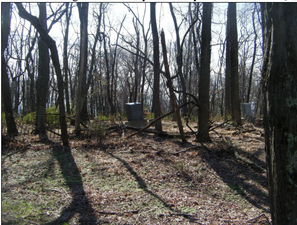
Photograph of 46-HM-177, looking northeast.