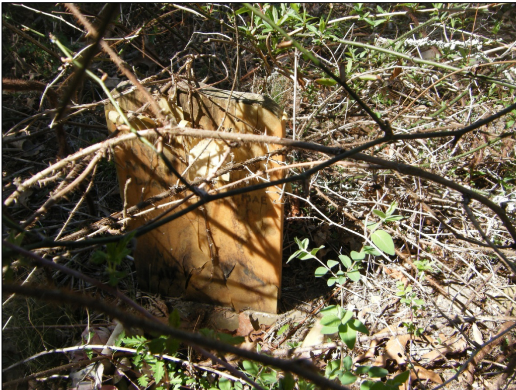
Photograph of a wood marker/headstone documented at 46-HM-178.