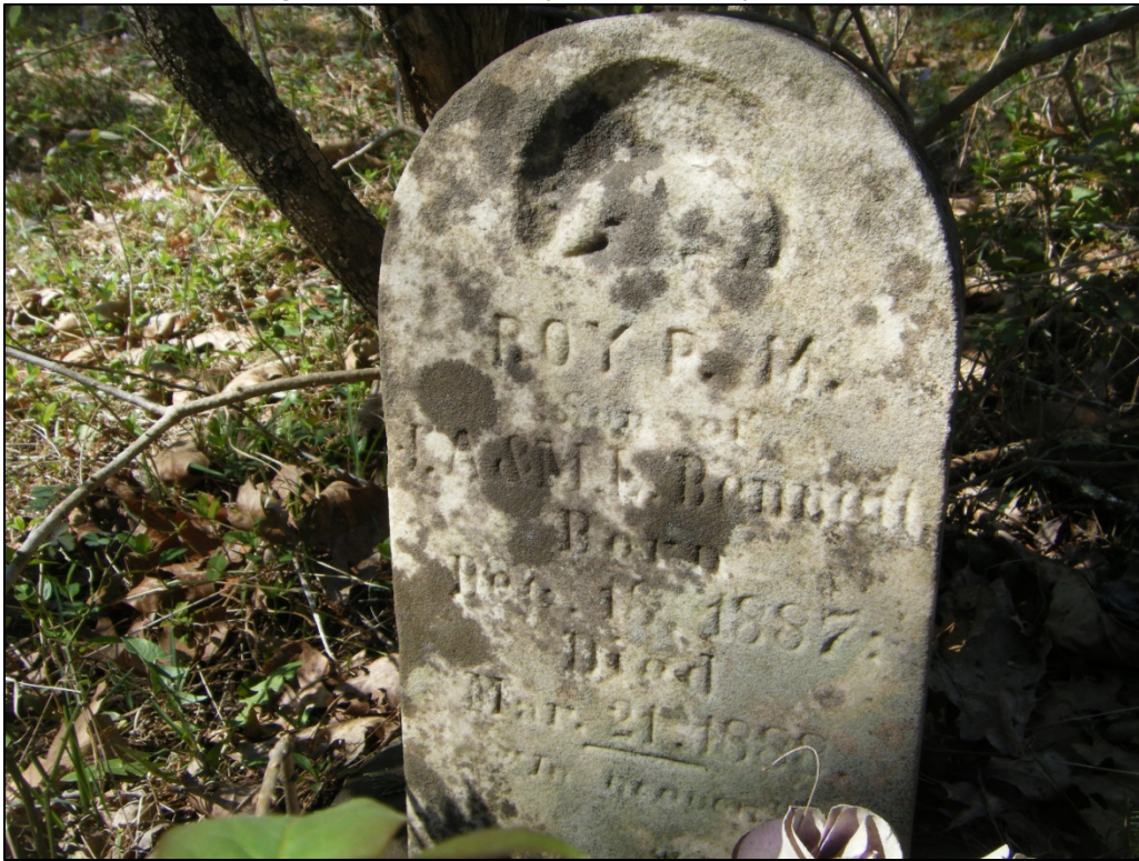
Photograph of a headstone with a dove motif documented at 46-HM-178.