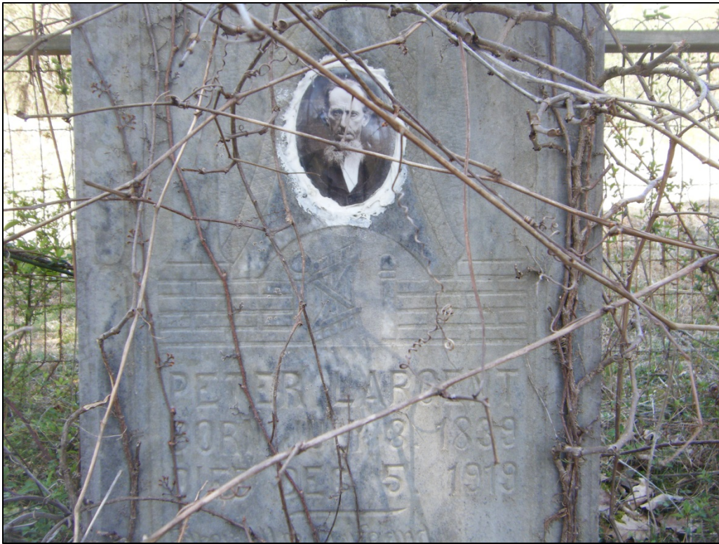
Photograph of a headstone documented at 46-HM-178.