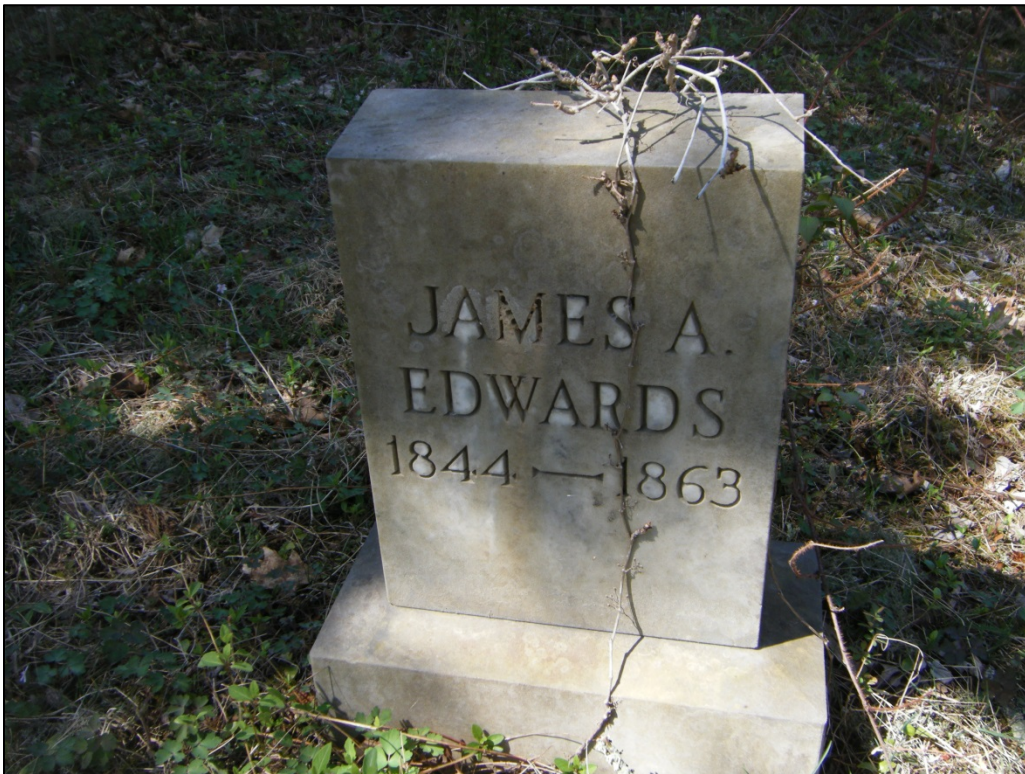
Photograph of a headstone at 46-HM-178.