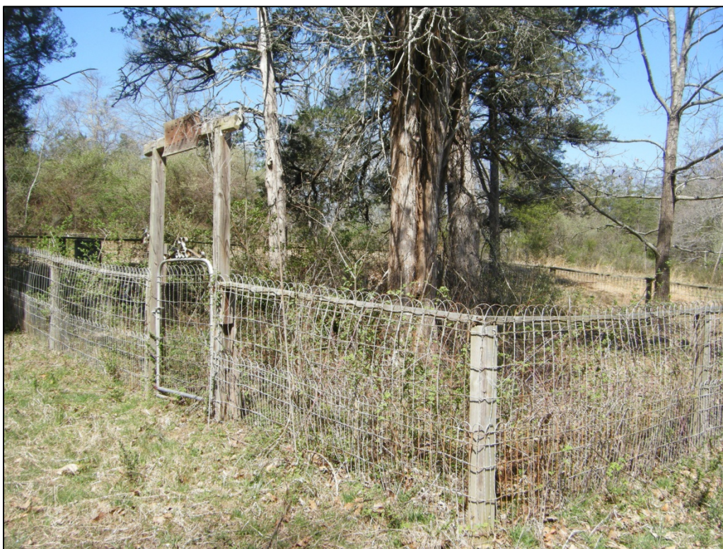
Photograph of 46-HM-178, looking southeast.