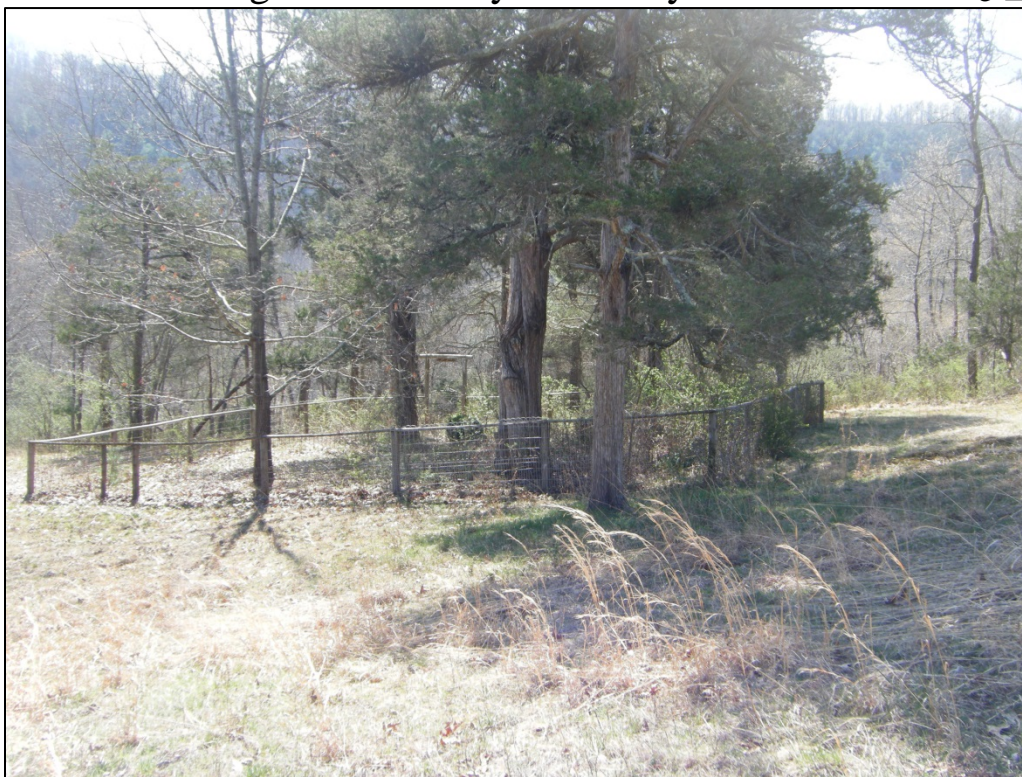
Photograph of 46-HM-178, looking northwest.