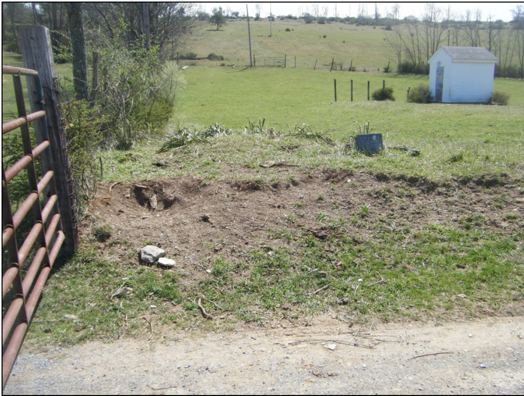
Photograph of 46-HM-179 showing disturbance, looking south.