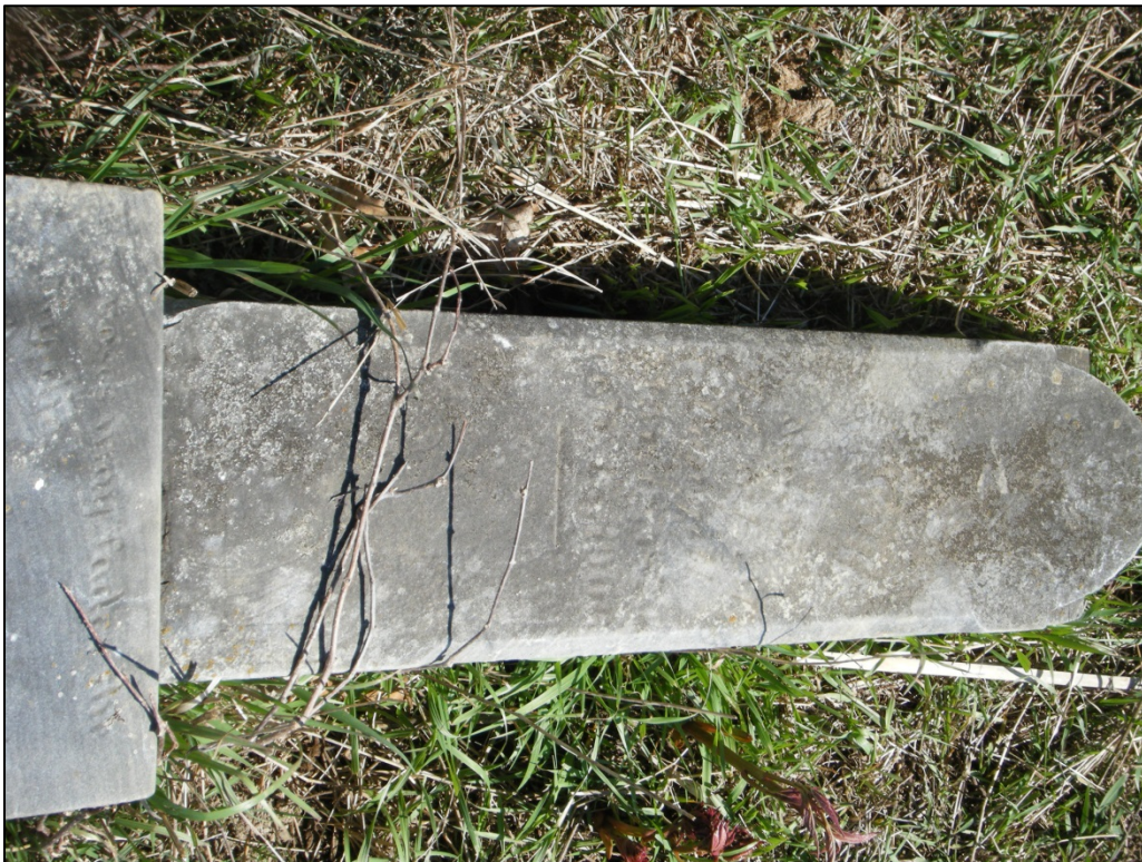
Photograph of toppled headstone documented at 46-HM-179.