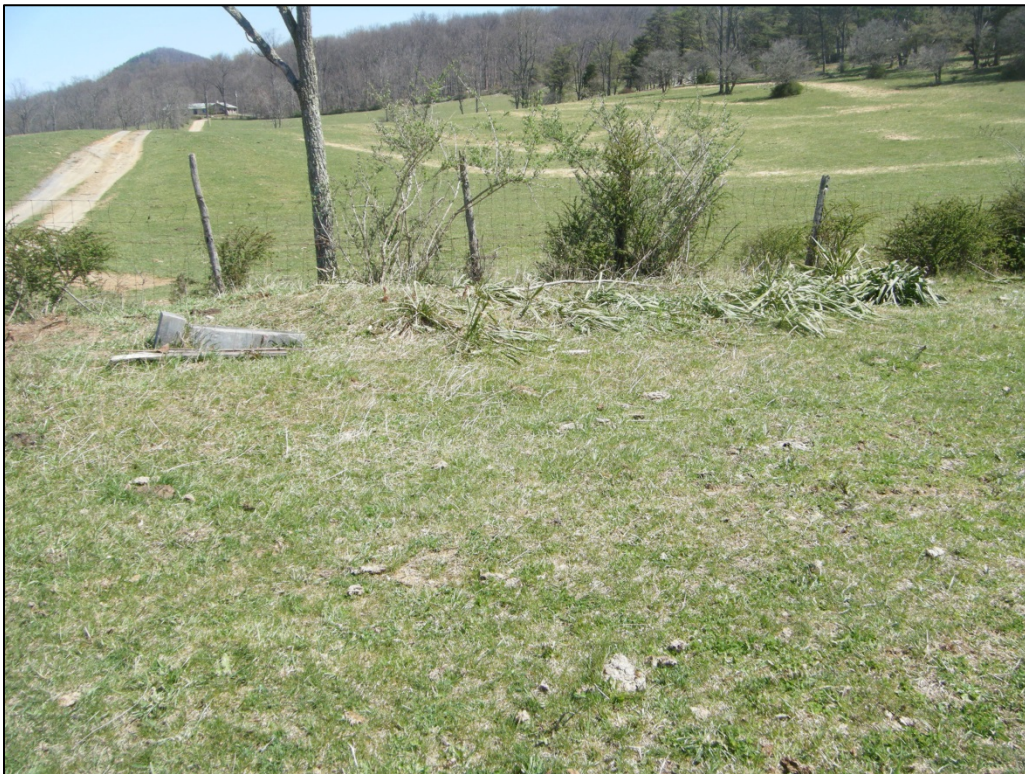
Photograph of 46-HM-179, looking east.