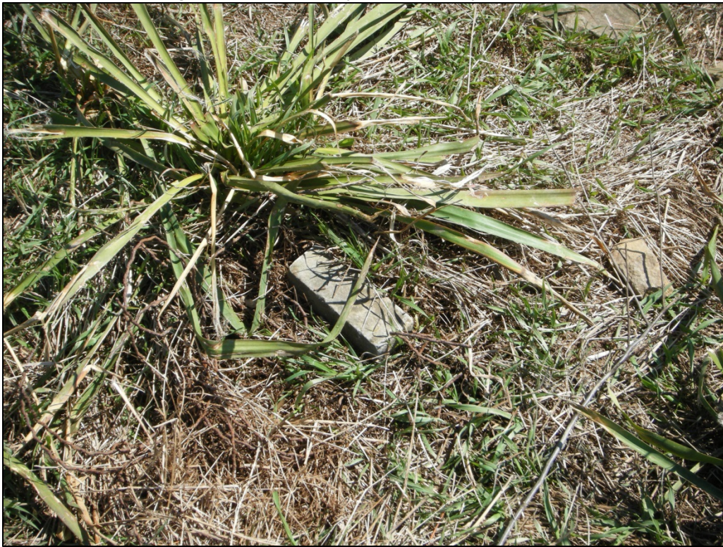
Photograph of a broken headstone documented at 46-HM-179.