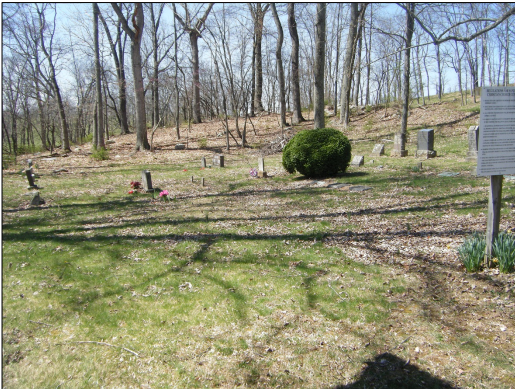
Photograph of 46-HM-180, looking northeast.