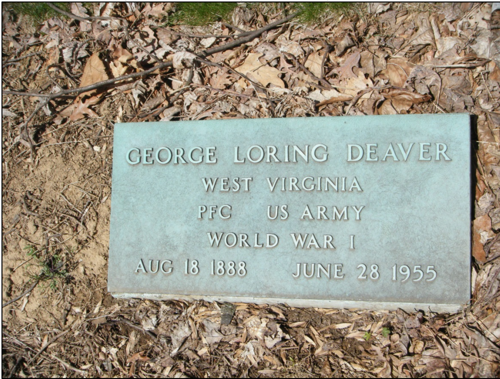
Photograph of a government issued World War I veteran marker/headstone documented at 46-HM-180.