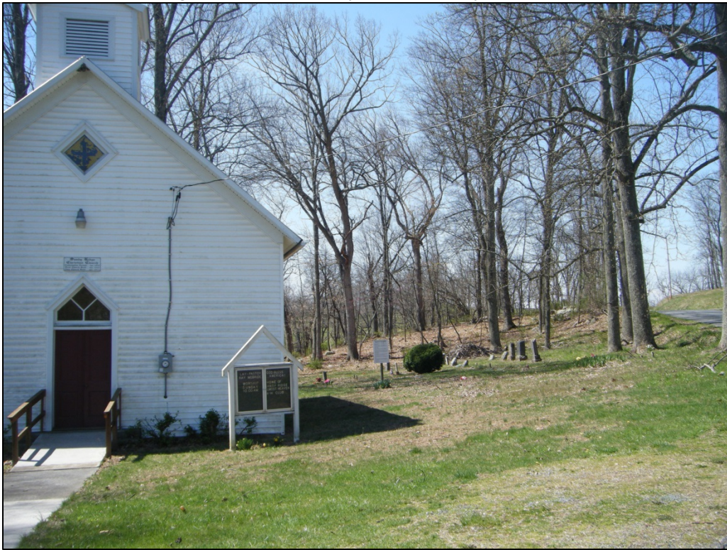
Photograph of 46-HM-180, looking north.