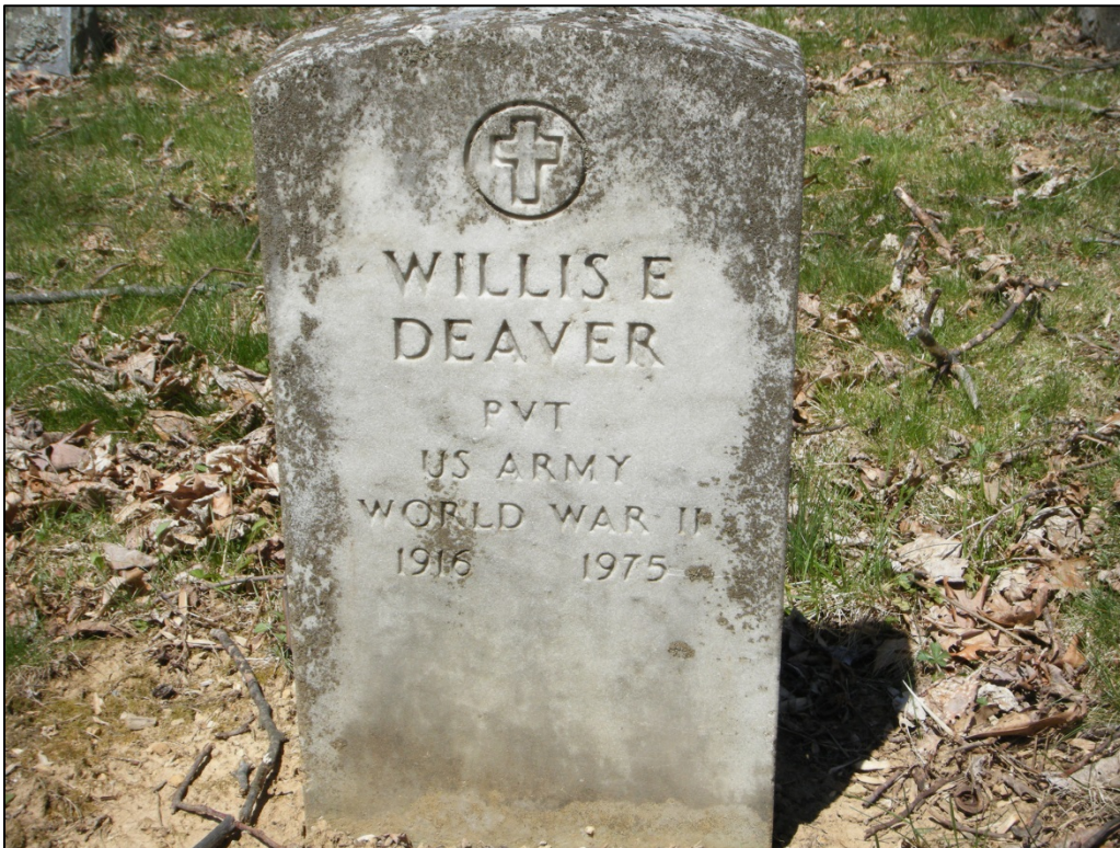
Photograph of a government issued World War II veteran headstone documented at 46-HM-180.