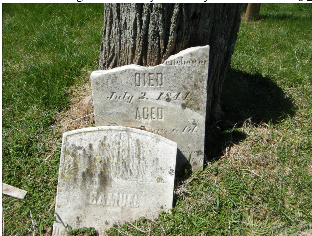
Photograph of a broken headstone documented at 46-HM-183.