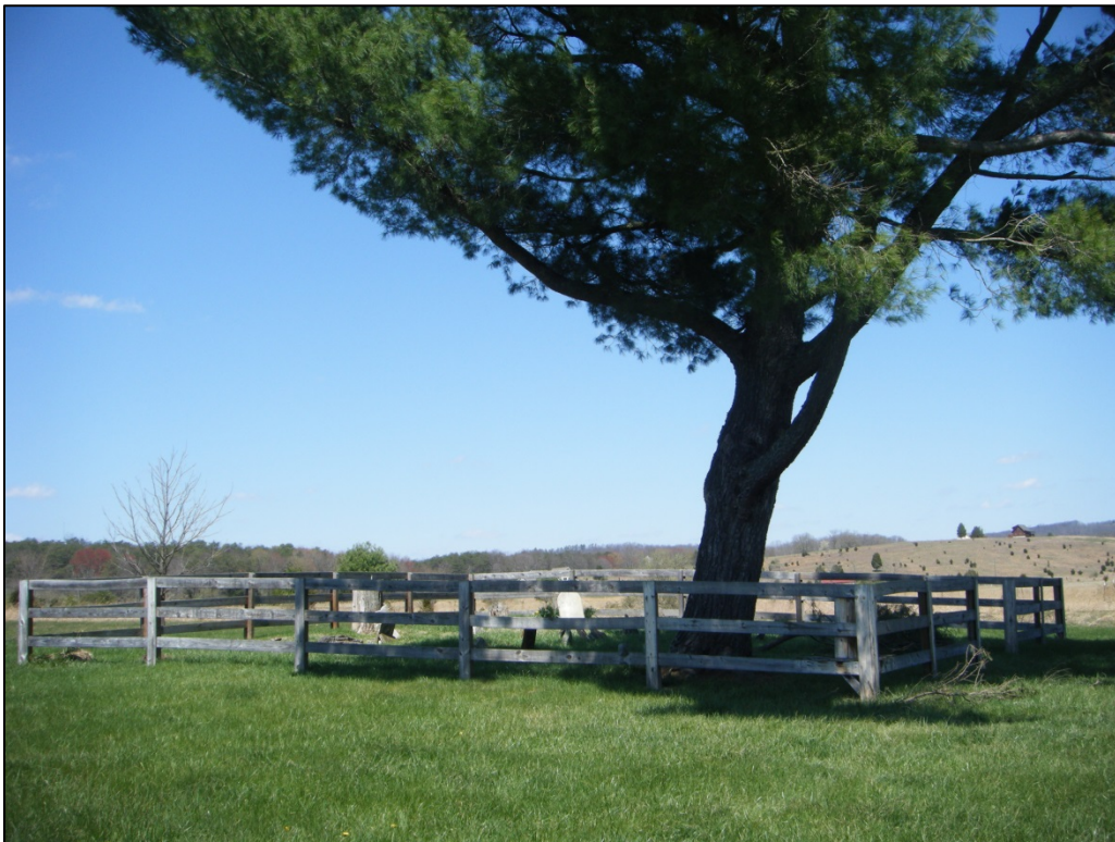
Photograph of 46-HM-183, looking north.