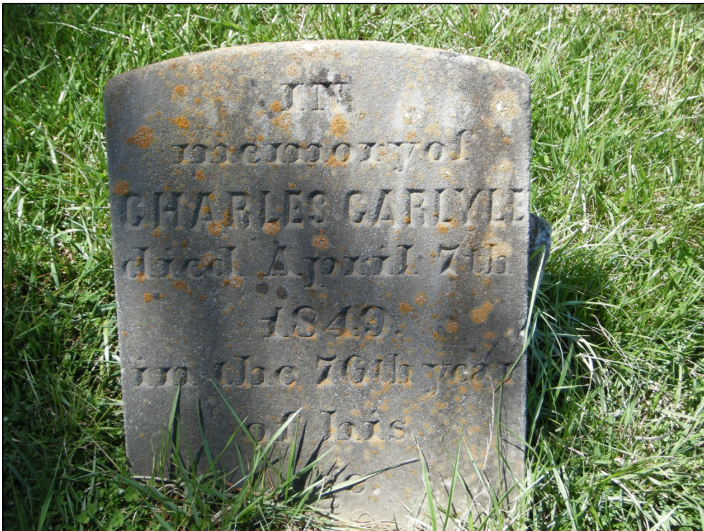
Photograph of a headstone encountered at 46-HM-183.