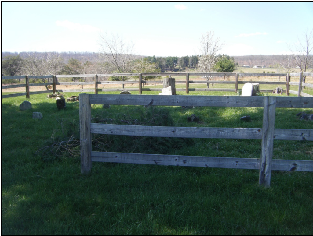
Photograph of 46-HM-183, looking west.