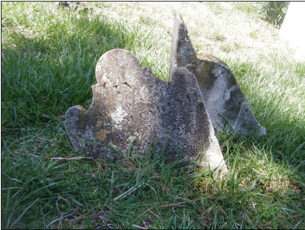
Photograph of a broken headstone documented at 46-HM-183.