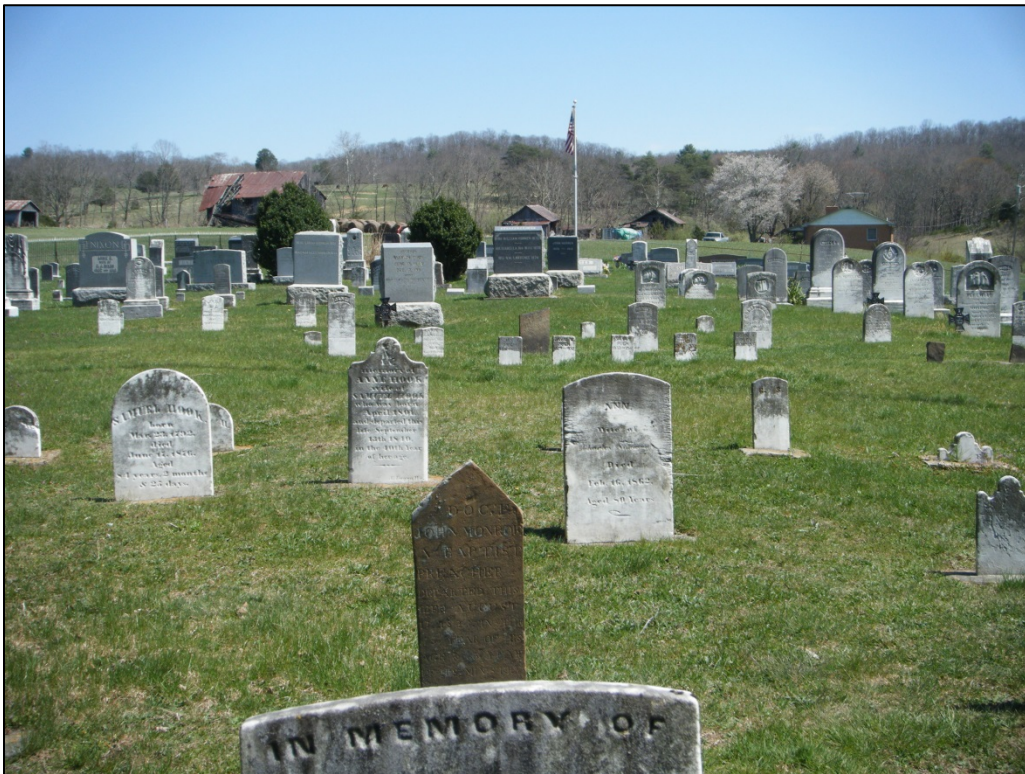
Photograph of 46-HM-184, looking east.