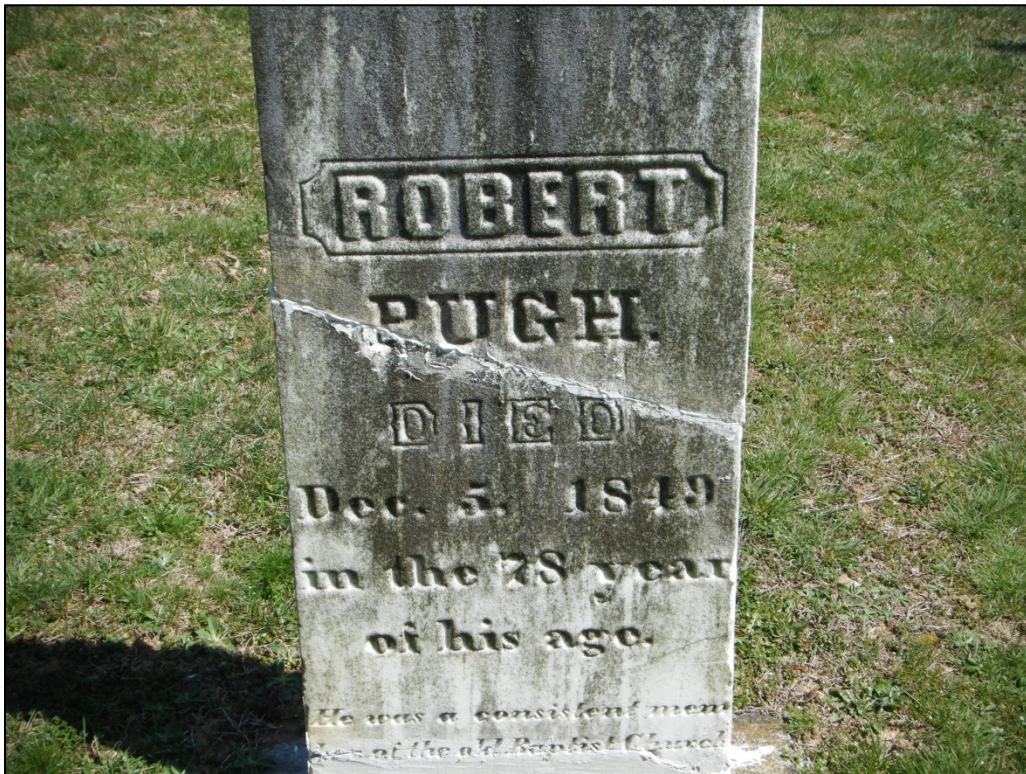
Photograph of a headstone documented at 46-HM-184.