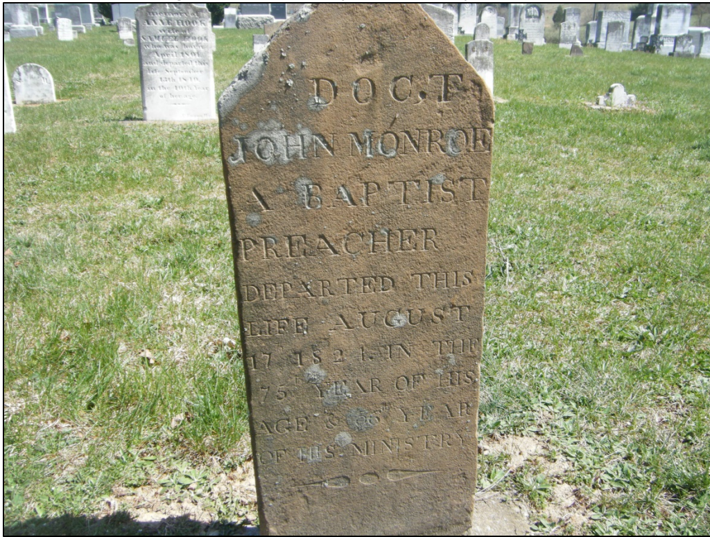
Photograph of a headstone documented at 46-HM-184.