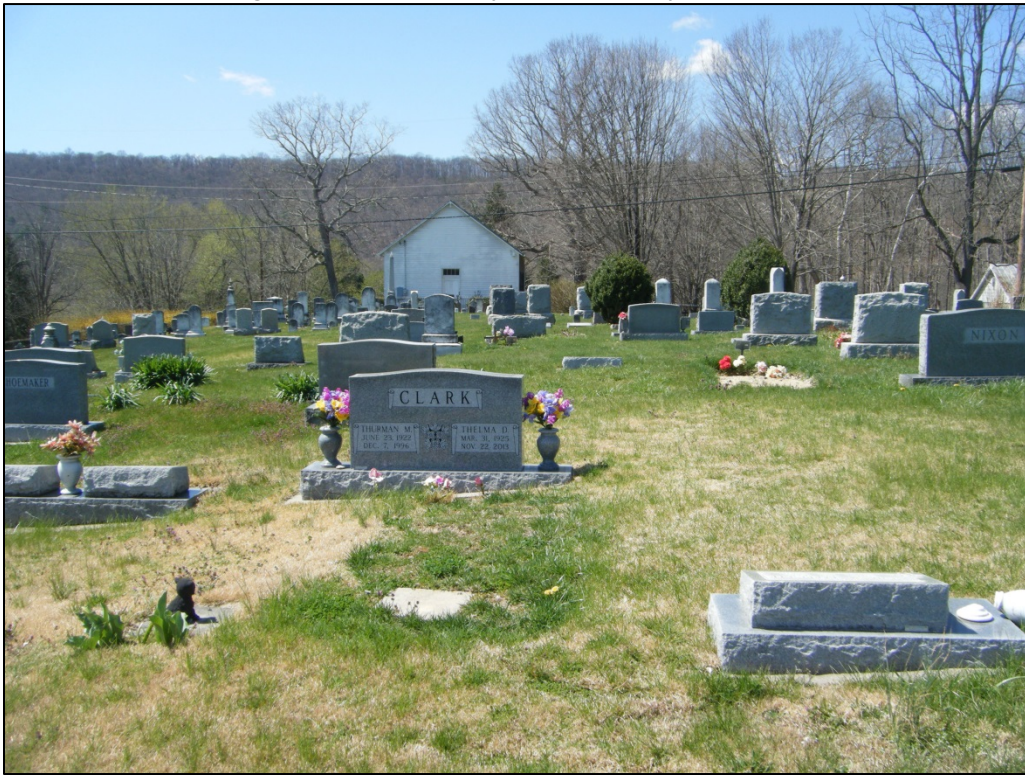
Photograph of 46-HM-184, looking west.