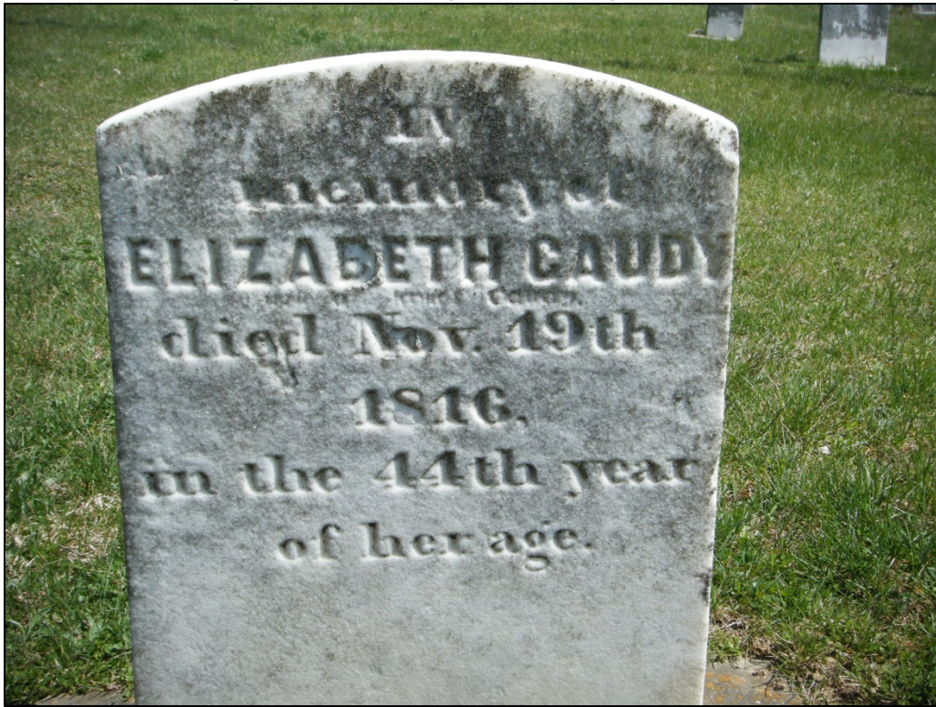
Photograph of the earliest headstone documented at 46-HM-184.