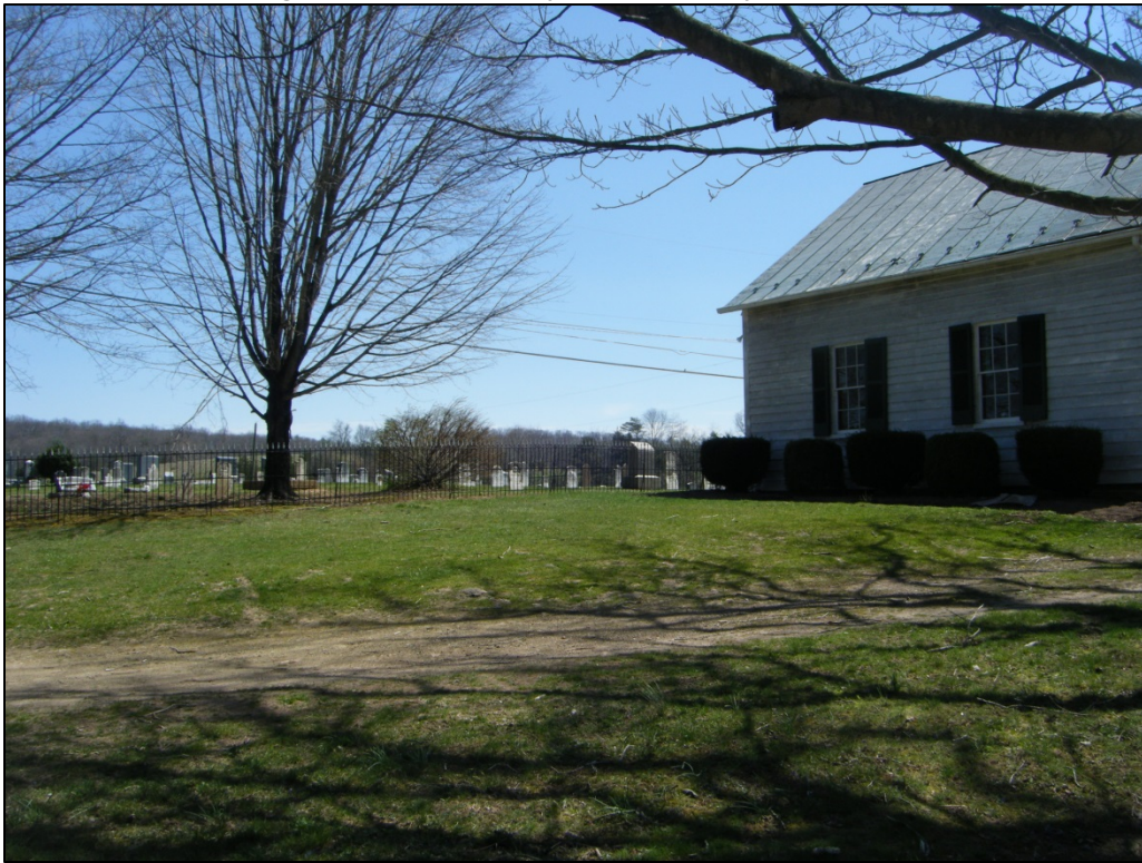
Photograph of 46-HM-184, looking southeast.