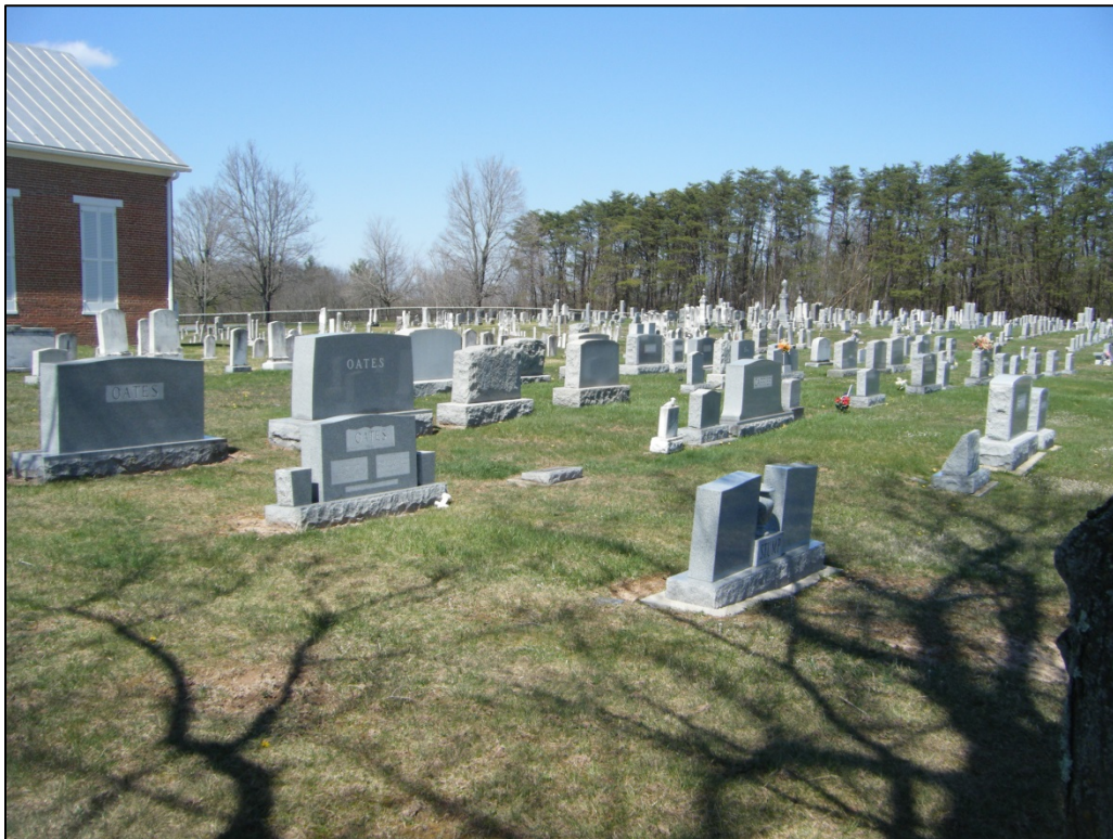
Photograph of 46-HM-185, looking northeast.