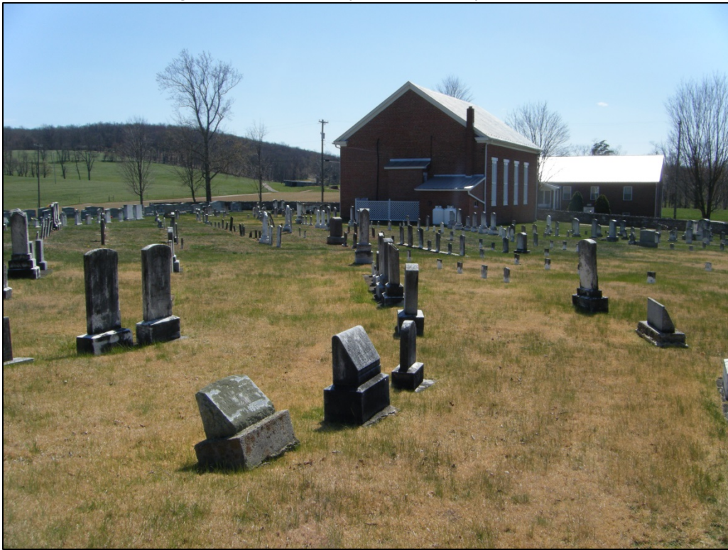
Photograph of 46-HM-185 showing the curving rows, looking southwest.