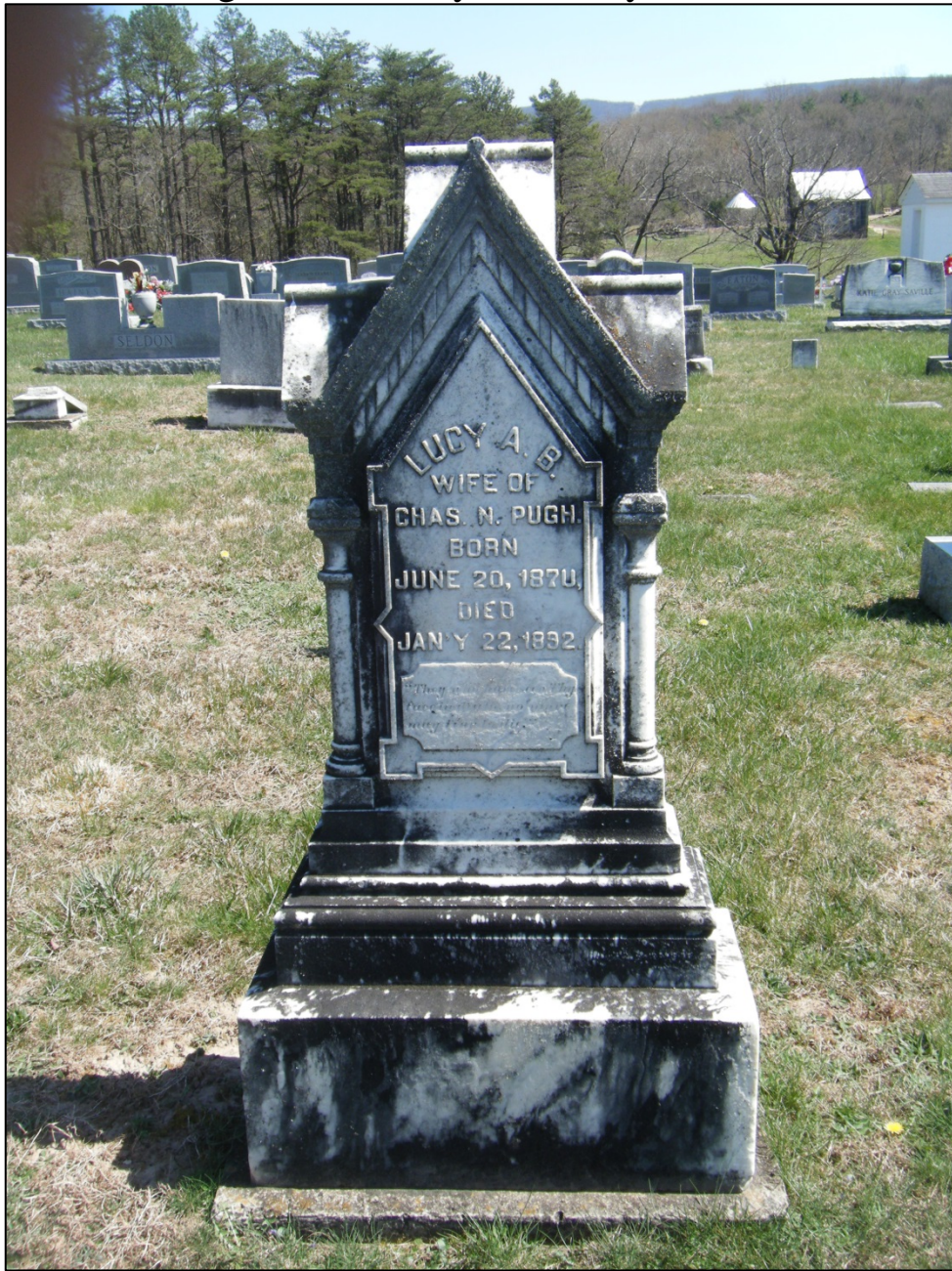
Photograph of a headstone documented at 46-HM-185.