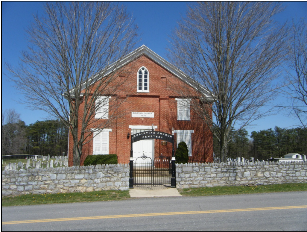
Photograph of 46-HM-185, looking east.