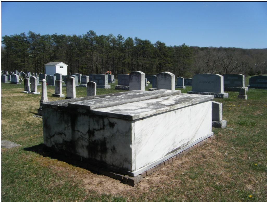
Photograph of an above ground crypt documented at 46-HM-185.