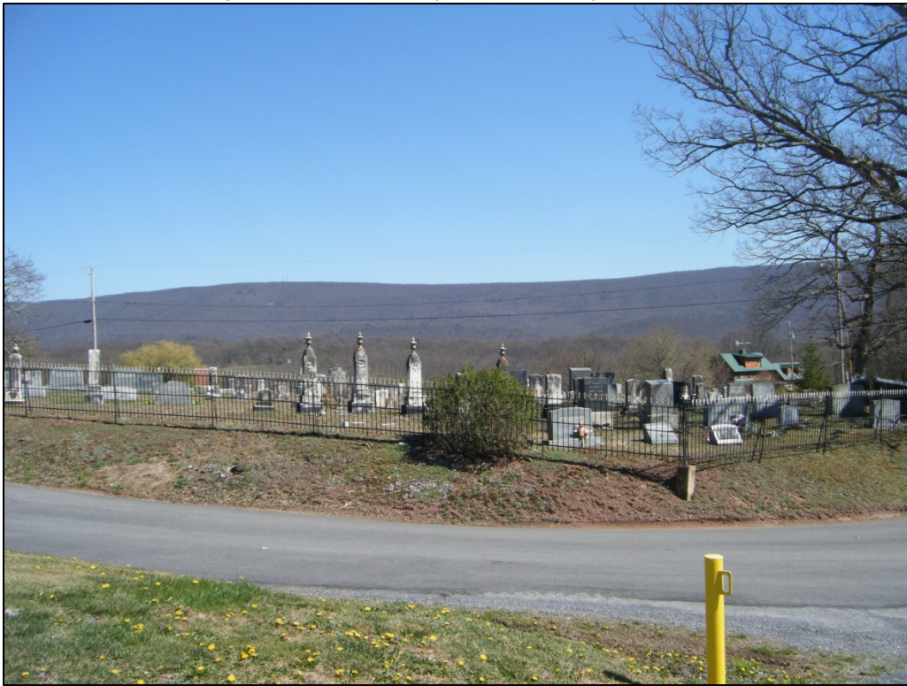
Photograph of 46-HM-189, looking east.