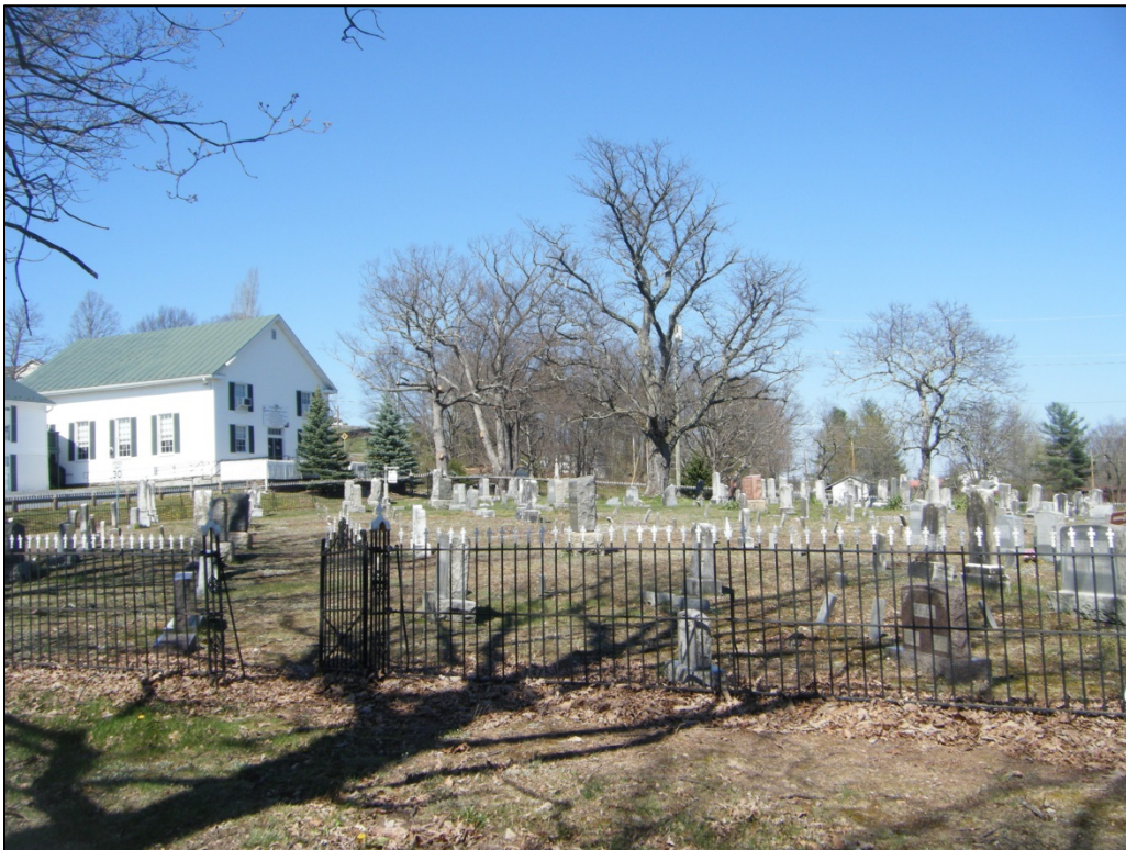
Photograph of 46-HM-189, looking north.