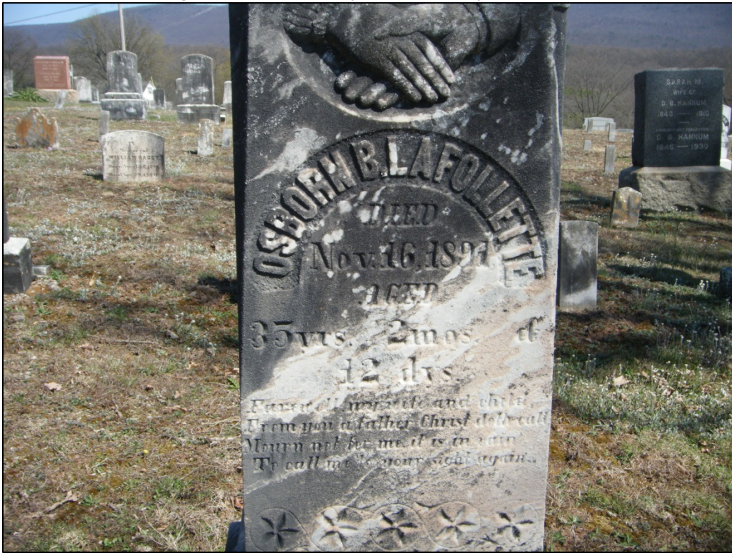
Photograph of a headstone with a clasped hand motif documented at 46-HM-189.