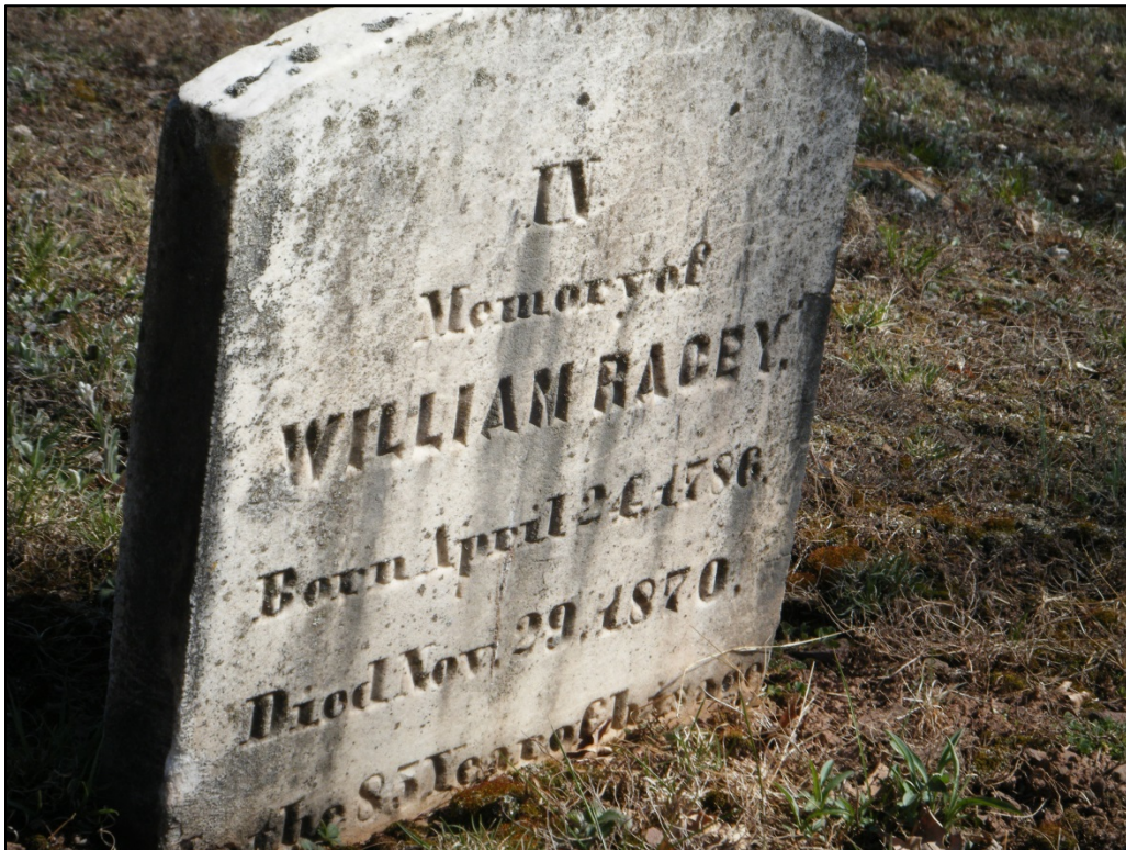
Photograph of a broken and replaced headstone documented at 46-HM-189.