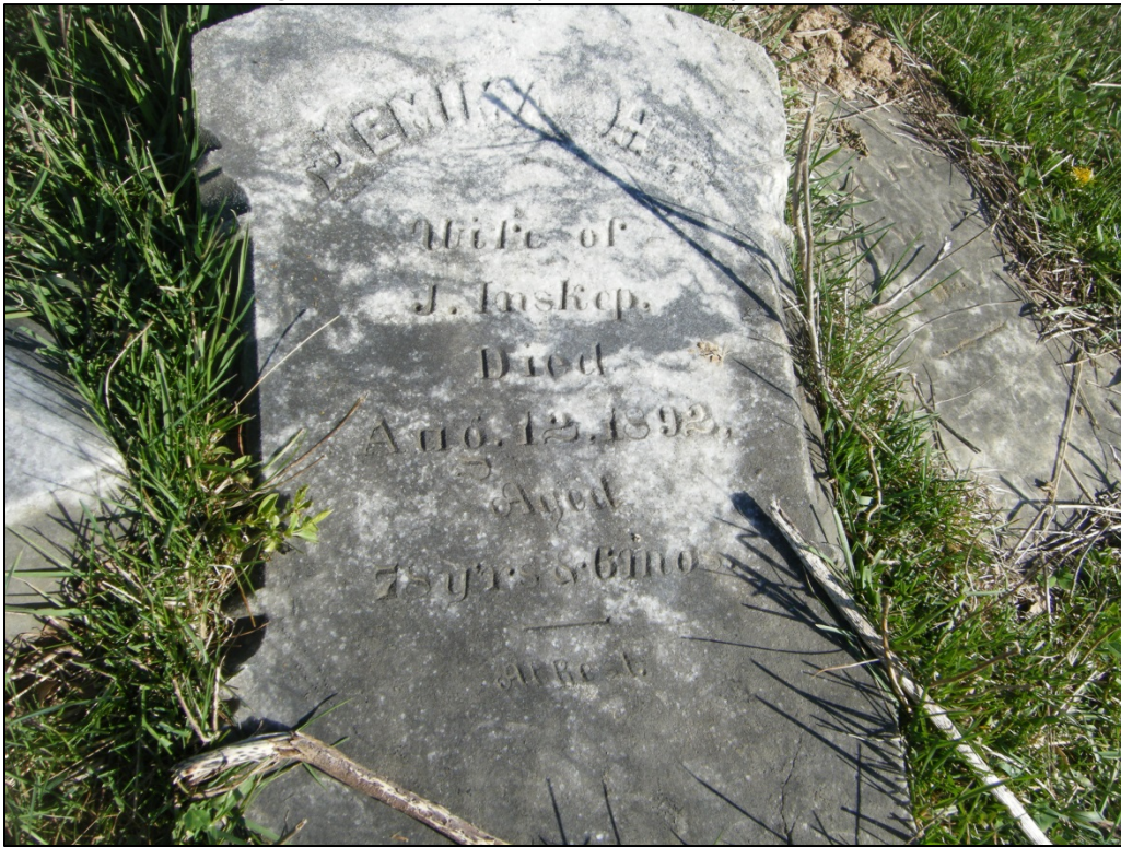
Photograph of a fallen headstone documented at 46-HM-191.