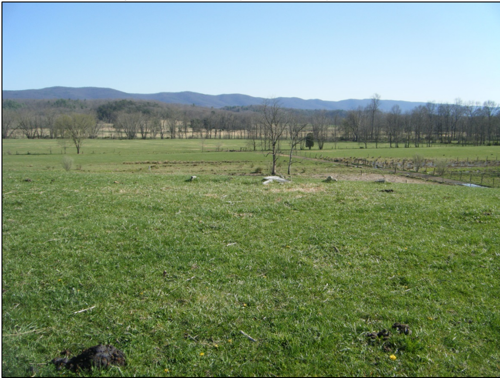
Photograph of 46-HM-191, looking southeast.