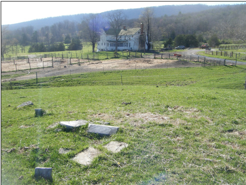
Photograph of 46-HM-191, looking southwest.