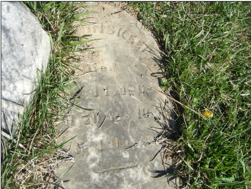
Photograph of a partially buried headstone documented at 46-HM-191.