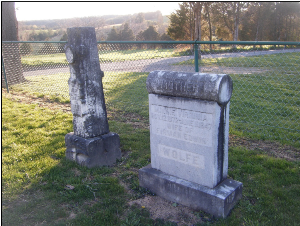
Photograph of headstones documented at 46-HM-196.