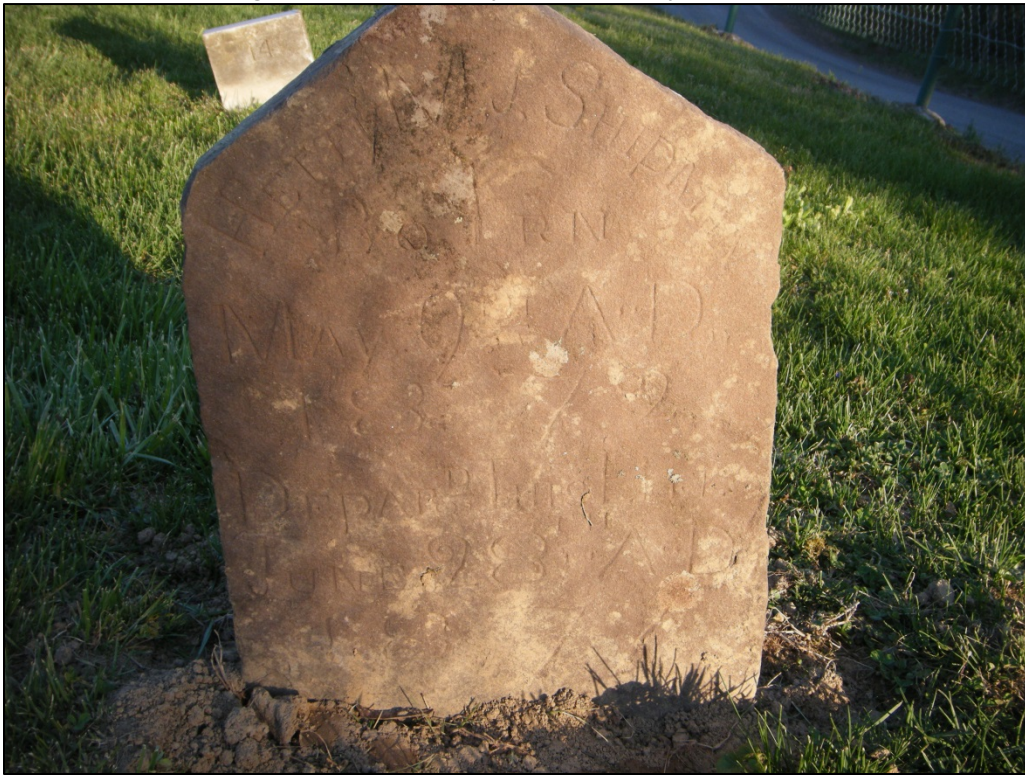
Photograph of an early headstone encountered at 46-HM-196.