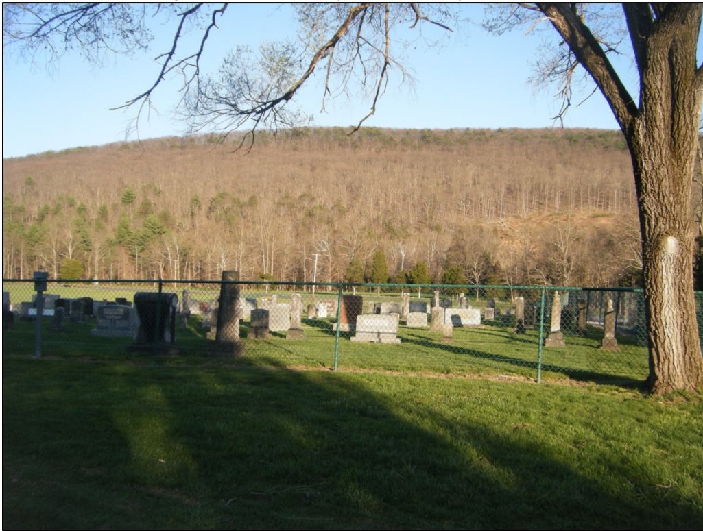
Photograph of 46-HM-196, looking east.