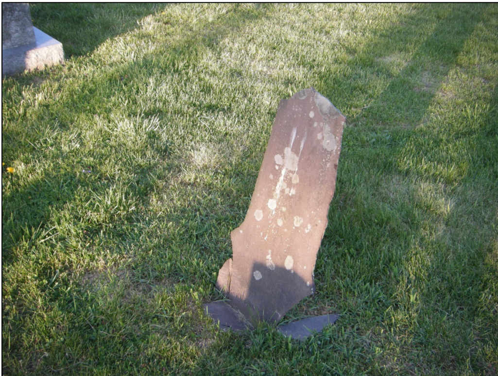
Photograph of a tilted and slightly broken headstone documented at 46-HM-196.