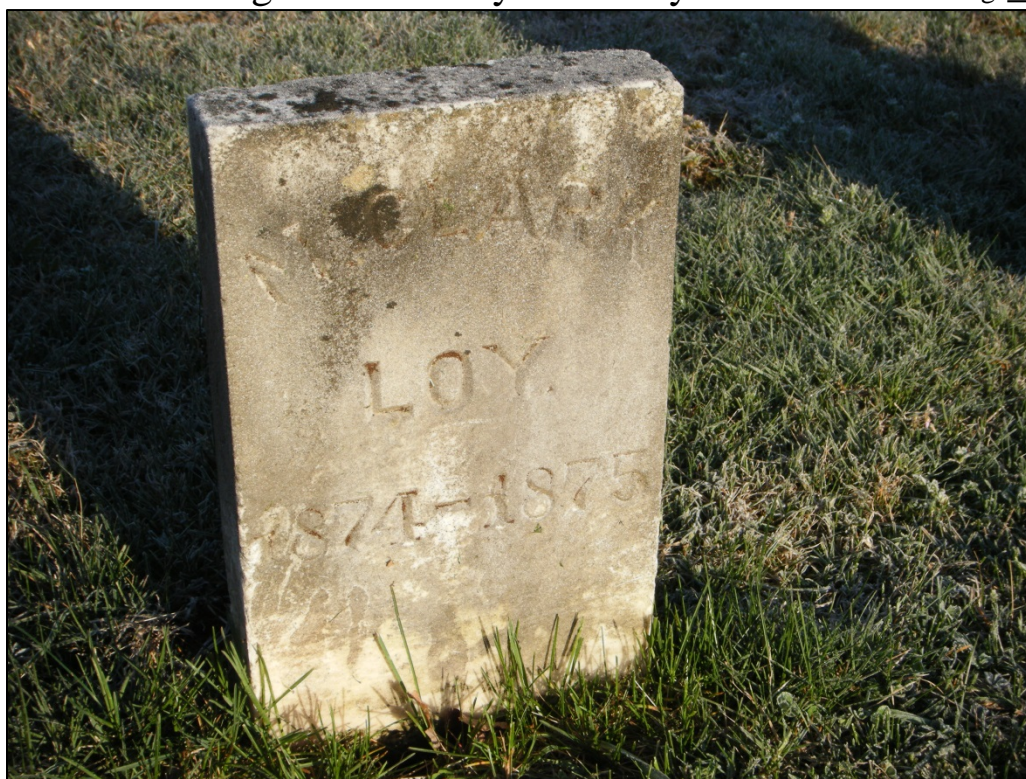
Photograph of a headstone encountered at 46-HM-198.