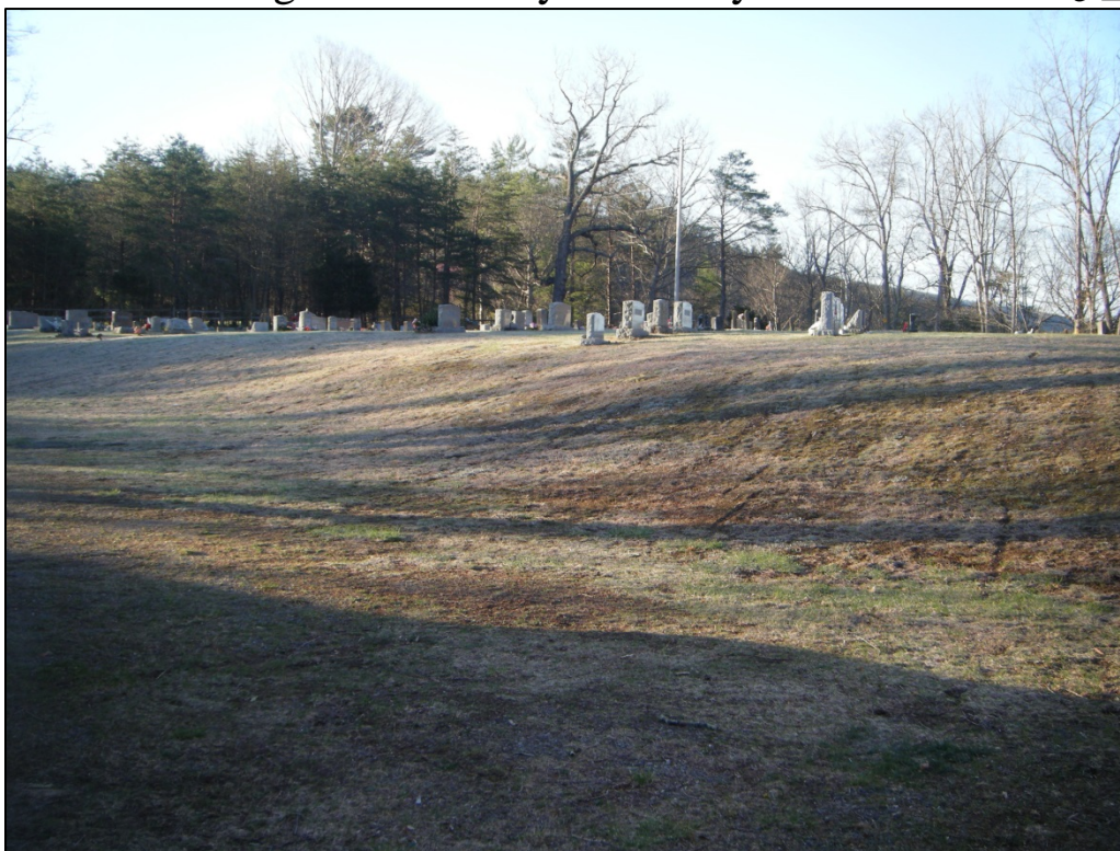
Photograph of 46-HM-198, looking south.