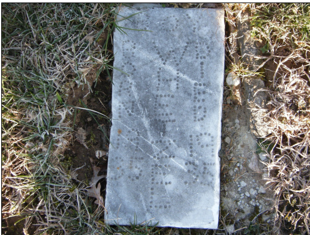
Photograph of a handmade infant headstone documented at 46-HM-198.