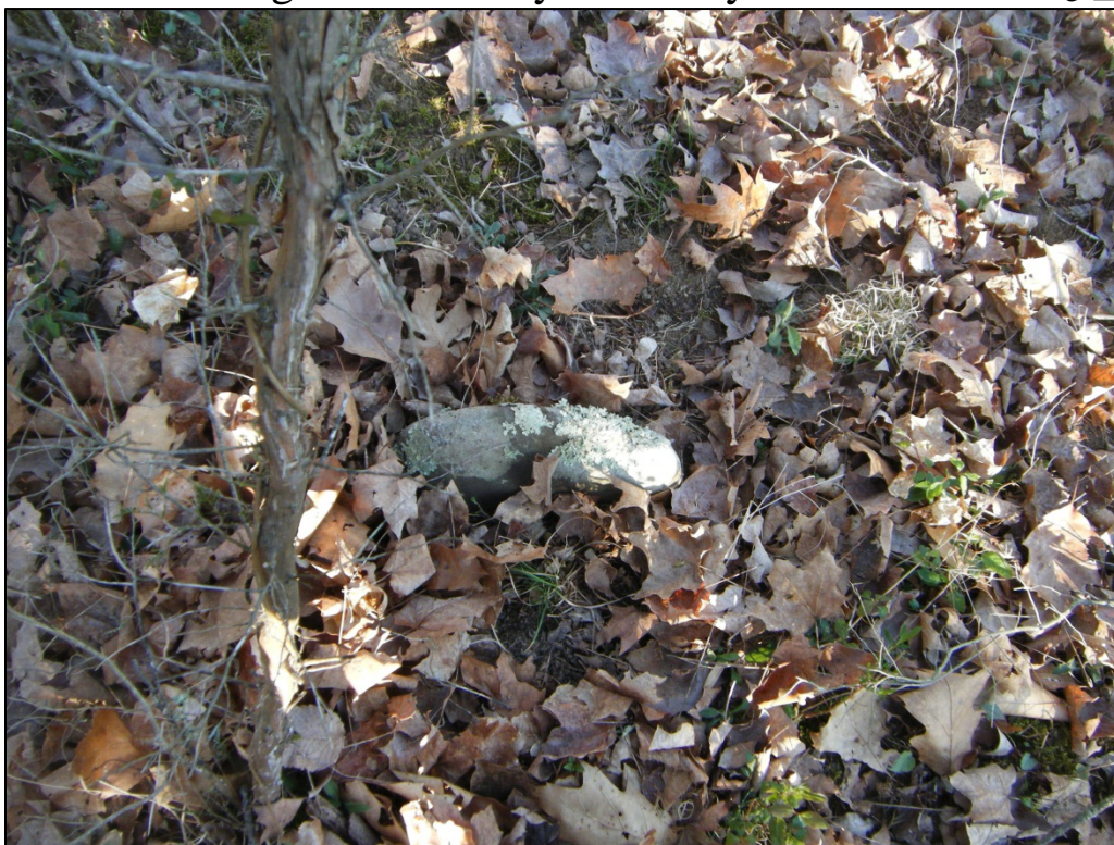
Photograph of a typical headstone/marker encountered at 46-HM-199.