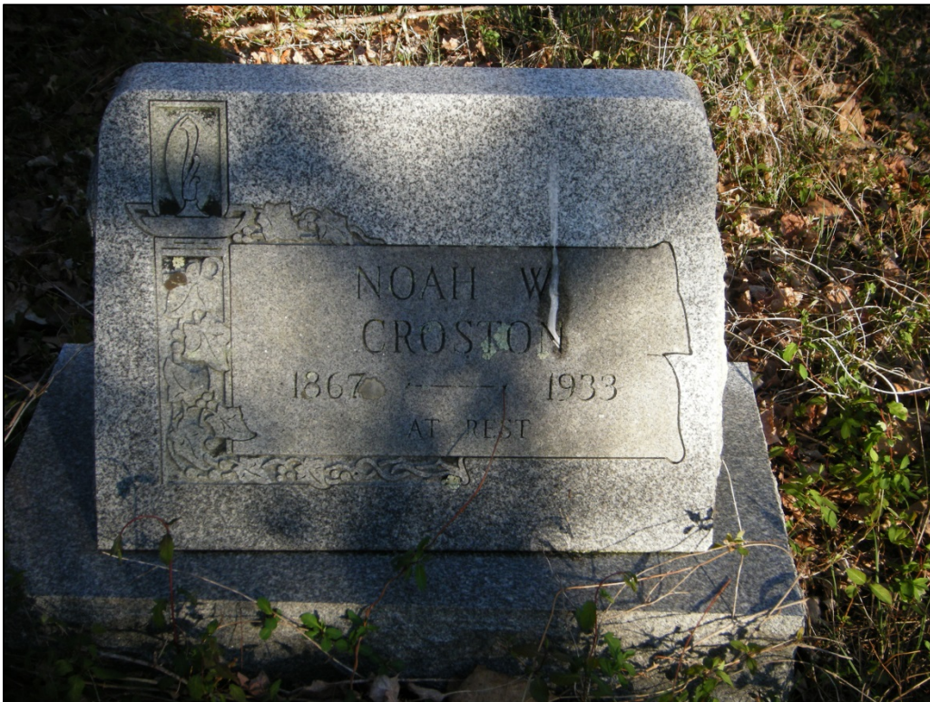
Photograph of the only legible headstone documented at 46-HM-199.