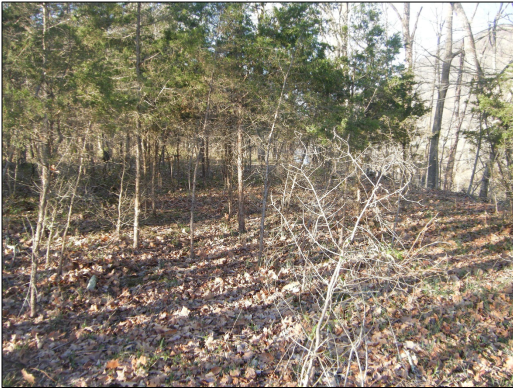
Photograph of 46-HM-199, looking south.