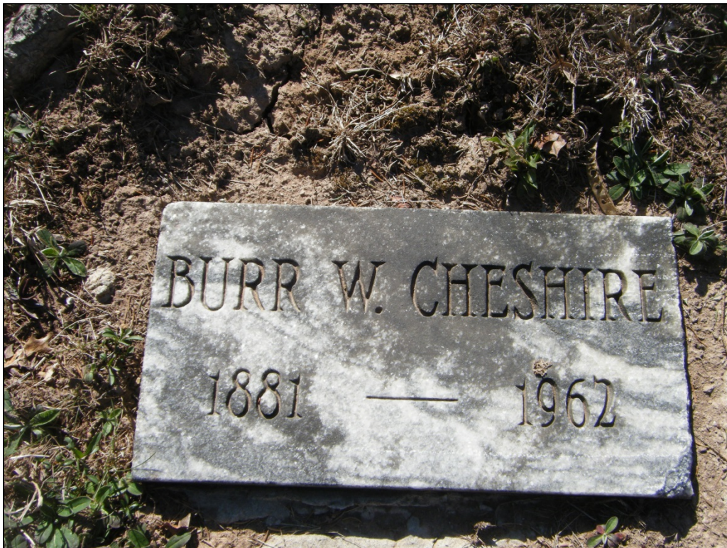
Photograph of a headstone/marker documented at 46-HM-202.