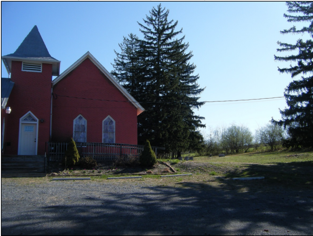
Photograph of 46-HM-202, looking southeast.