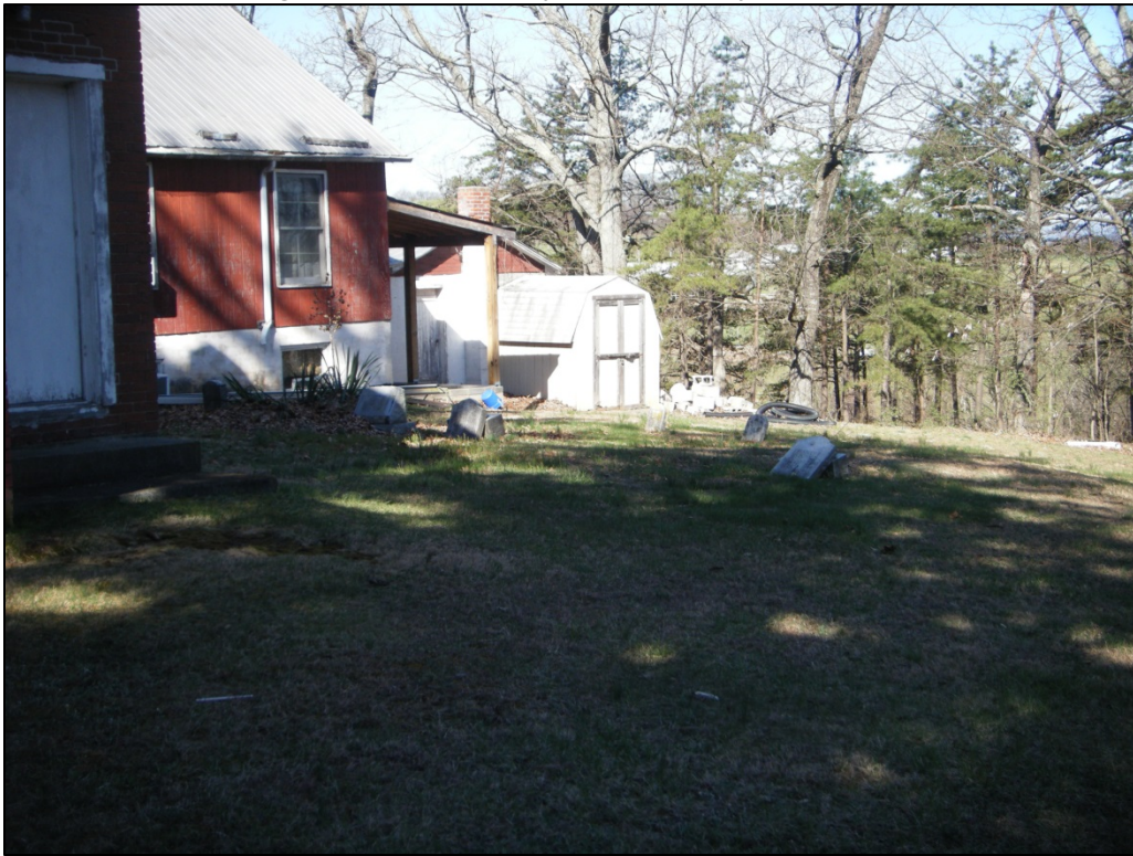
Photograph from behind the church showing a propped up headstone, looking north.