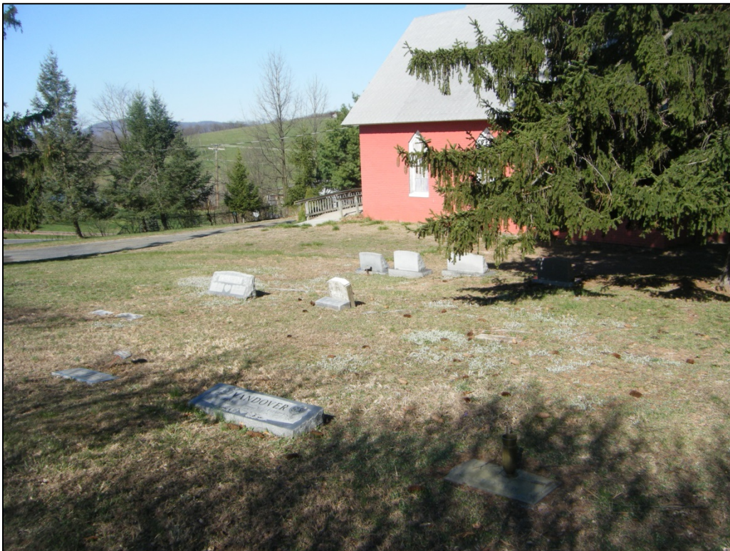
Photograph of 46-HM-202, looking northwest.