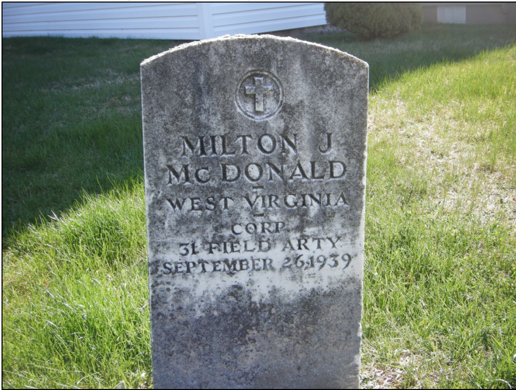
Photograph of a government issued veteran headstone documented at 46-HM-203.