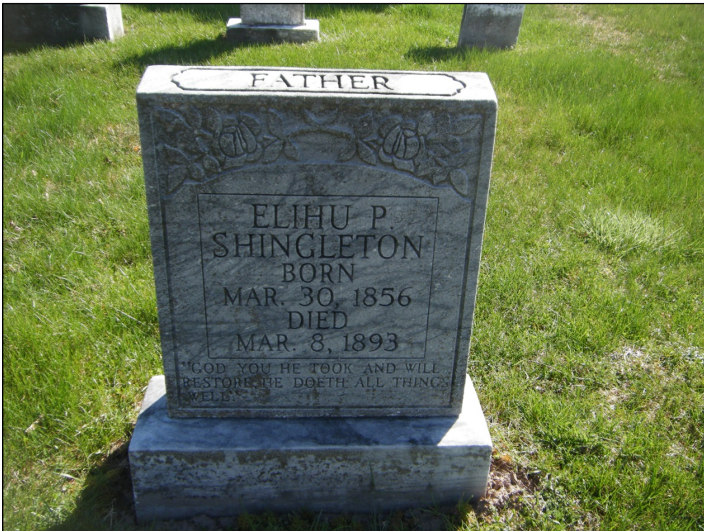
Photograph of a headstone documented at 46-HM-203.