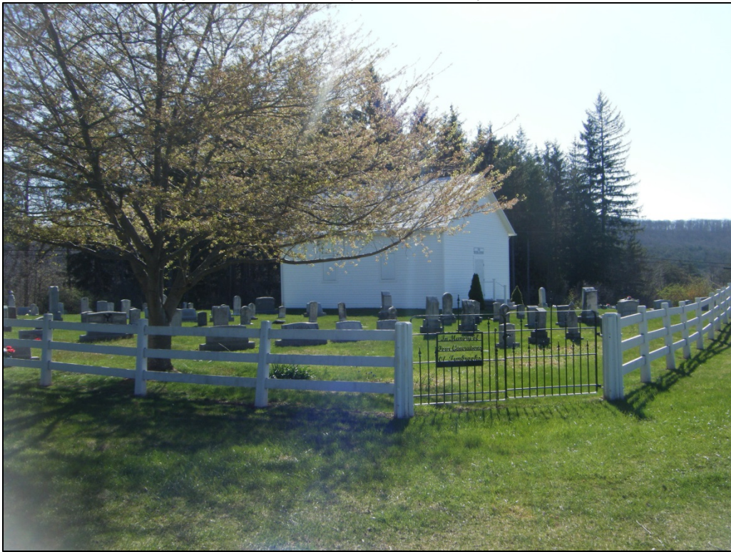
Photograph of 46-HM-203, looking southeast.