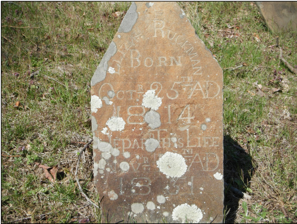
Photograph of a headstone documented at 46-HM-204.