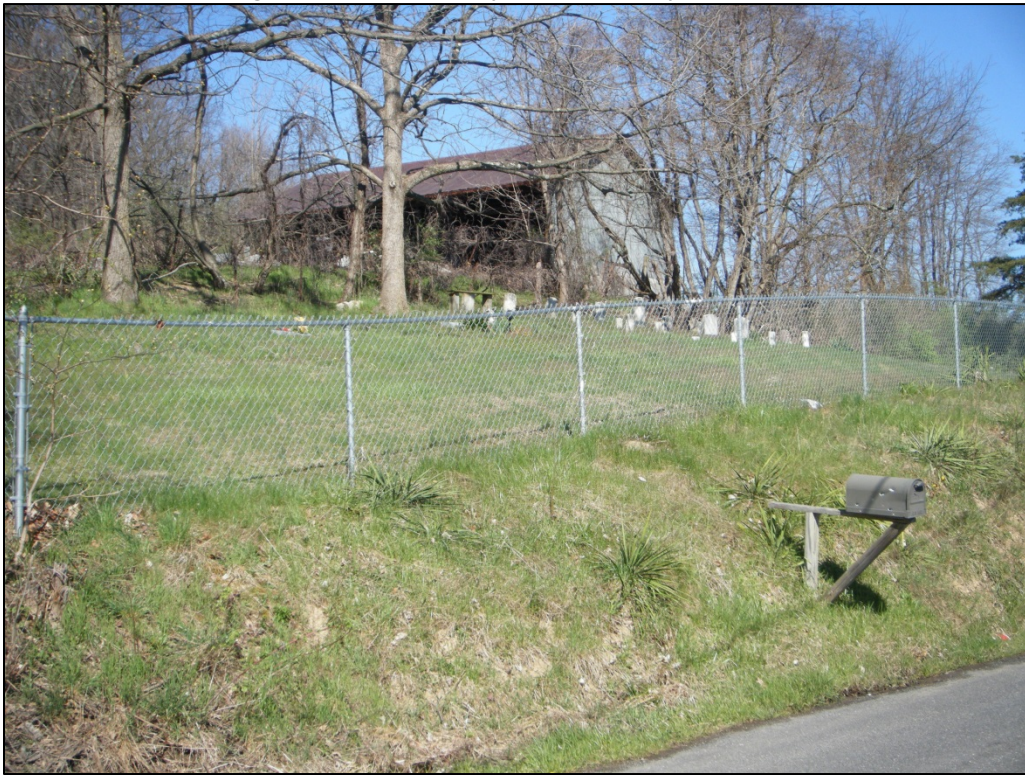
Photograph of 46-HM-204, looking northwest.