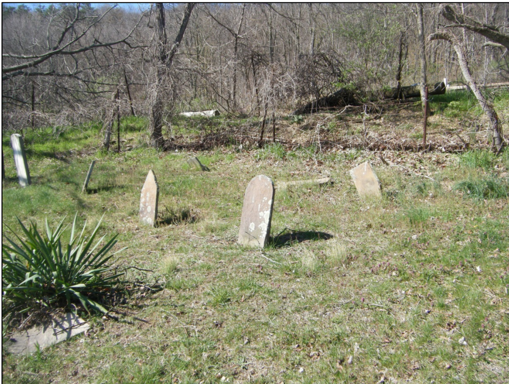
Photograph of 46-HM-204, looking north.