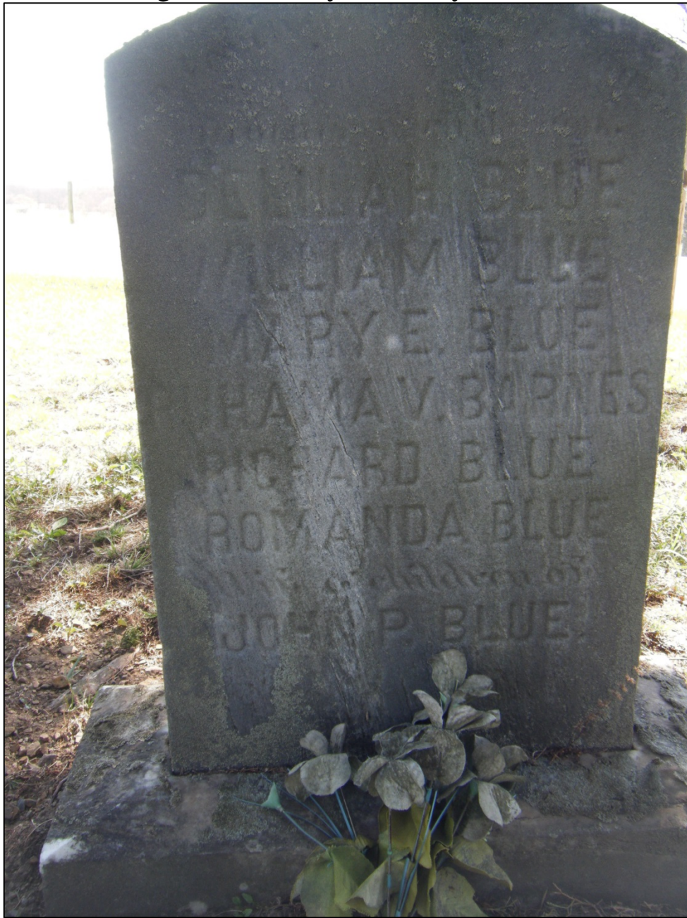
Photograph of a headstone documented at 46-HM-205.