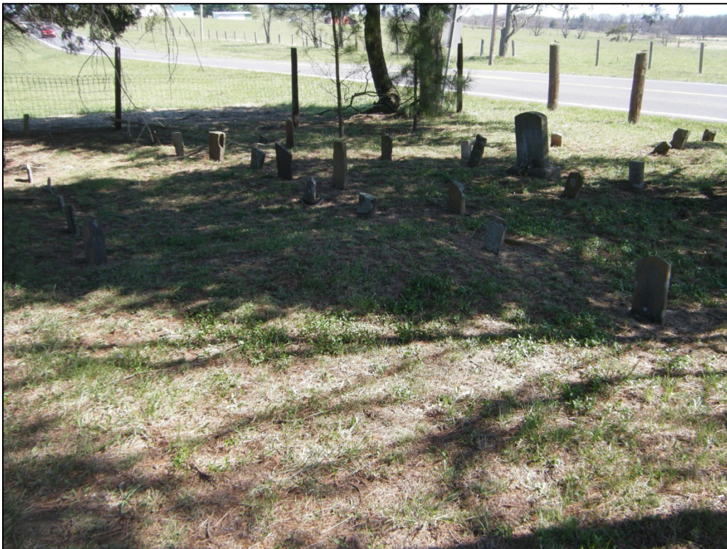
Photograph of 46-HM-205, looking northeast.