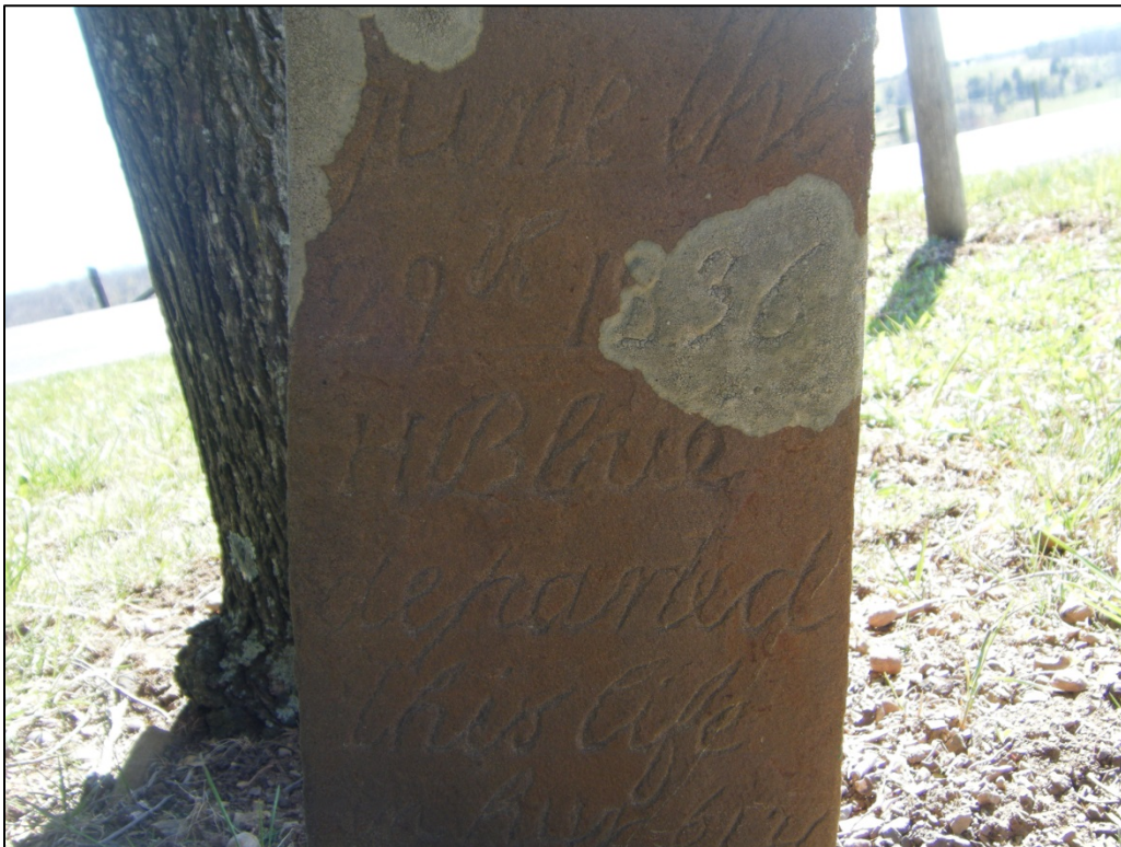
Photograph of a headstone encountered at 46-HM-205.