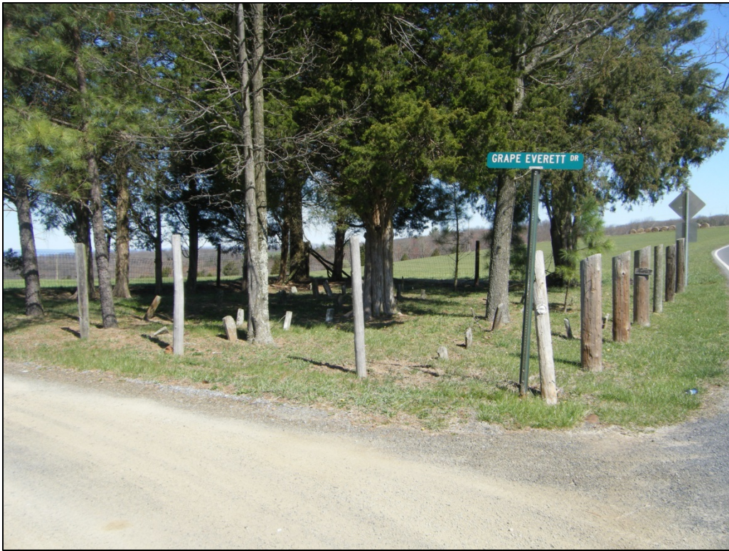
Photograph of 46-HM-205, looking northwest.