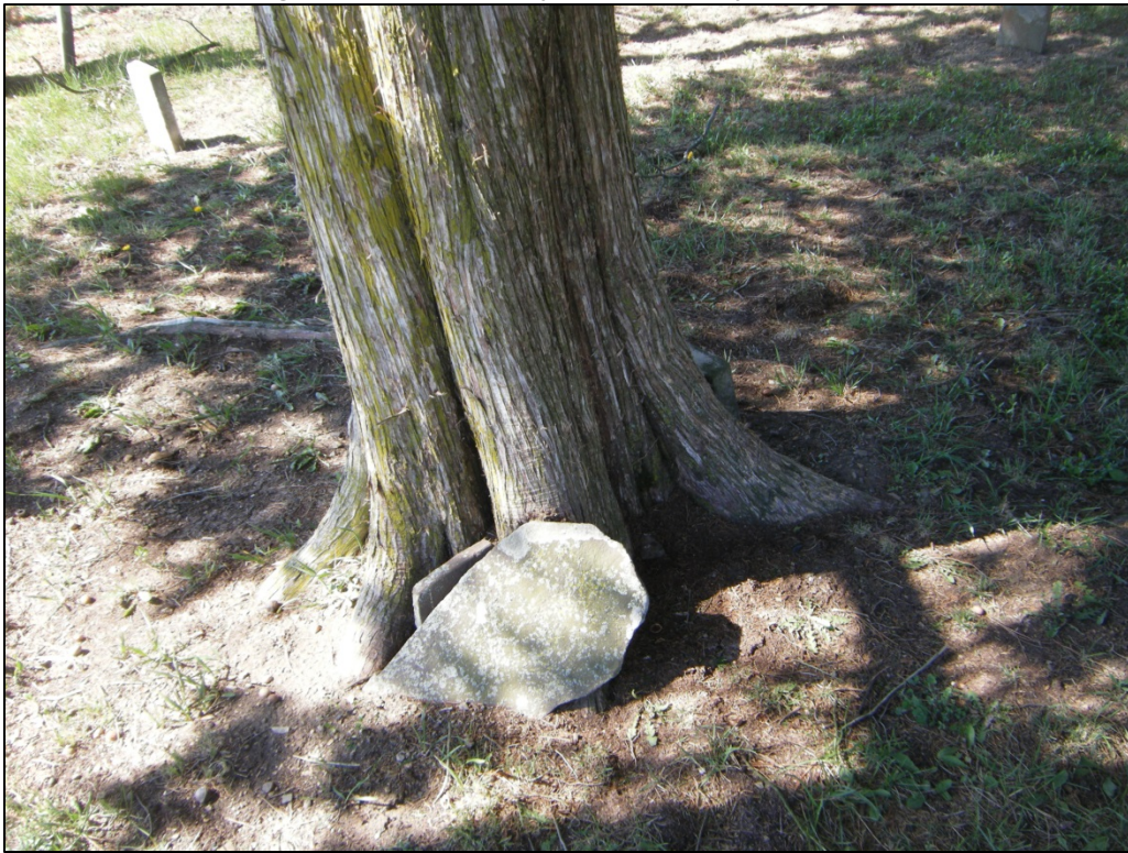
Photograph of a broken headstone placed against a tree documented at 46-HM-205.