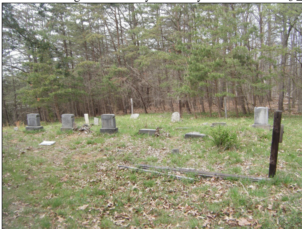
Photograph of 46-HM-208, looking west.