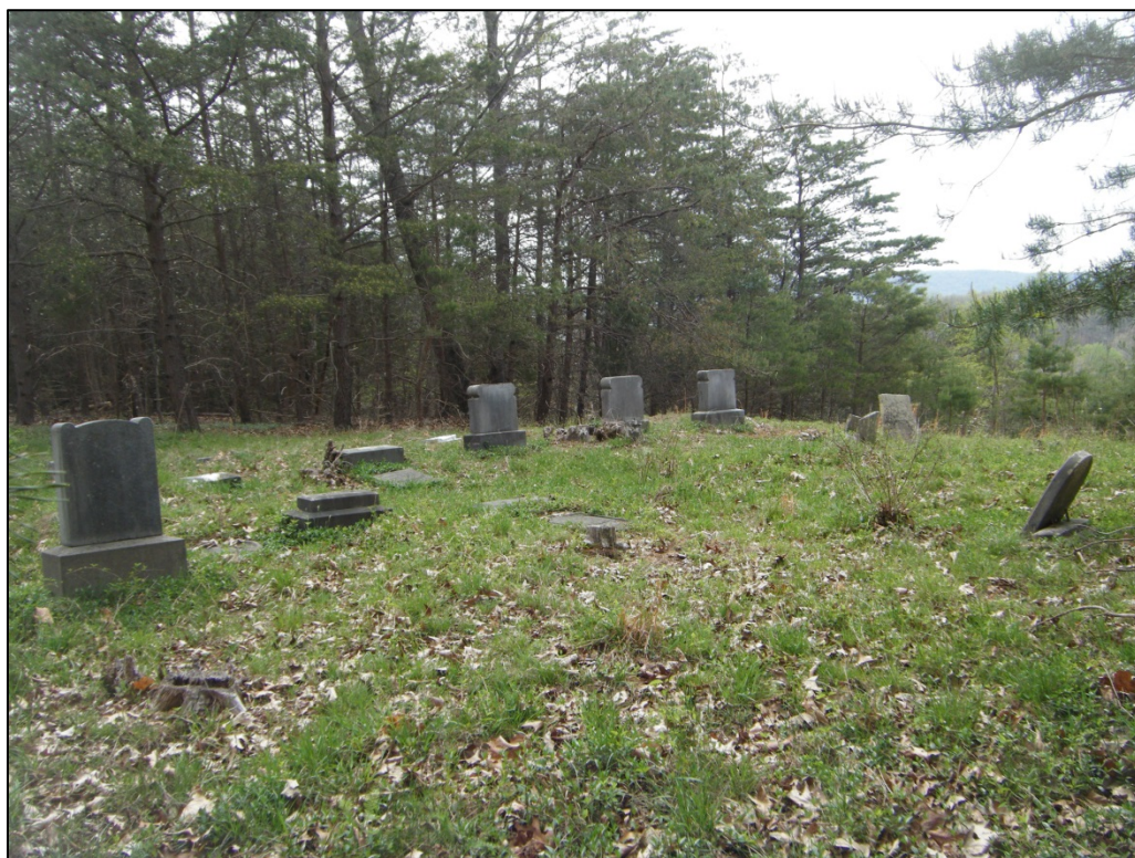
Photograph of 46-HM-208, looking southeast.