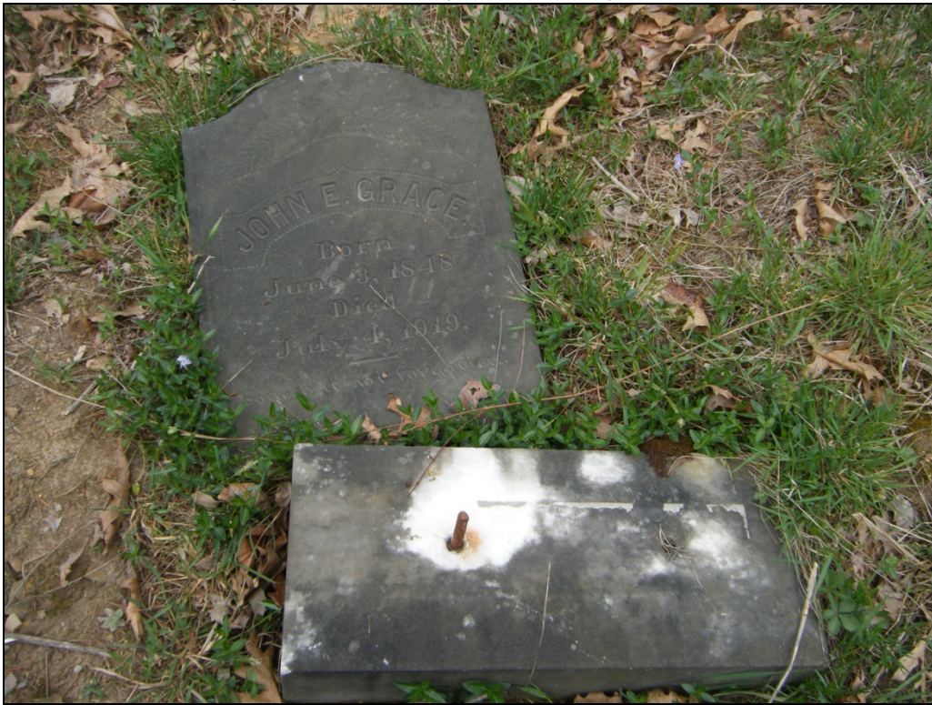
Photograph of a stand and fallen headstone documented at 46-HM-208.