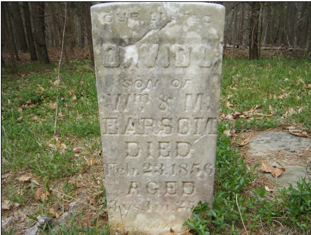
Photograph of a headstone encountered at 46-HM-208.