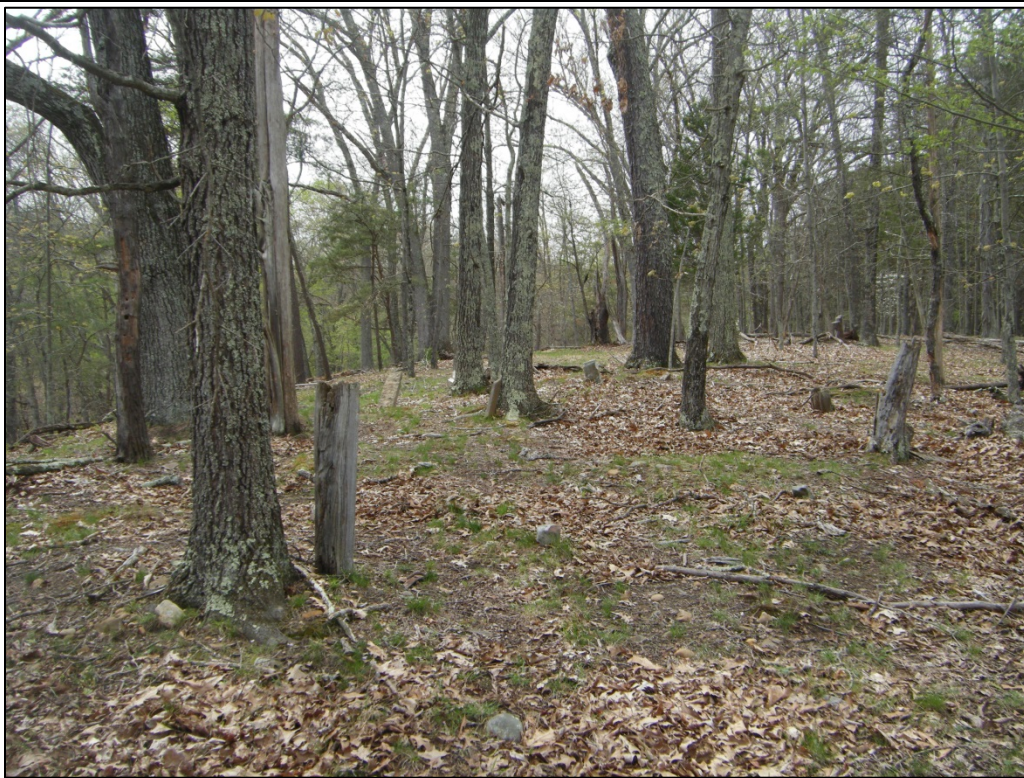
Photograph of 46-HM-215, looking south.