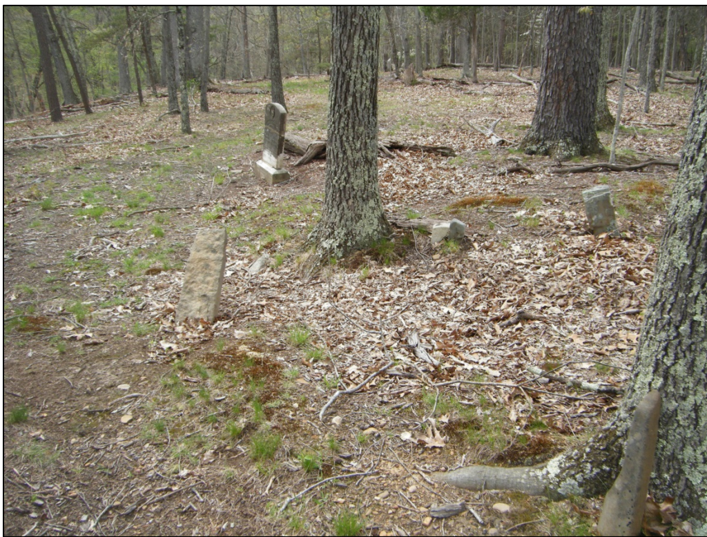
Photograph of 46-HM-215, looking southeast.