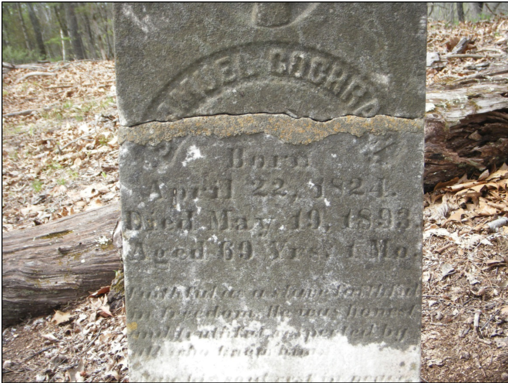
Photograph of a cracked and partially restored headstone documented at 46-HM-215.