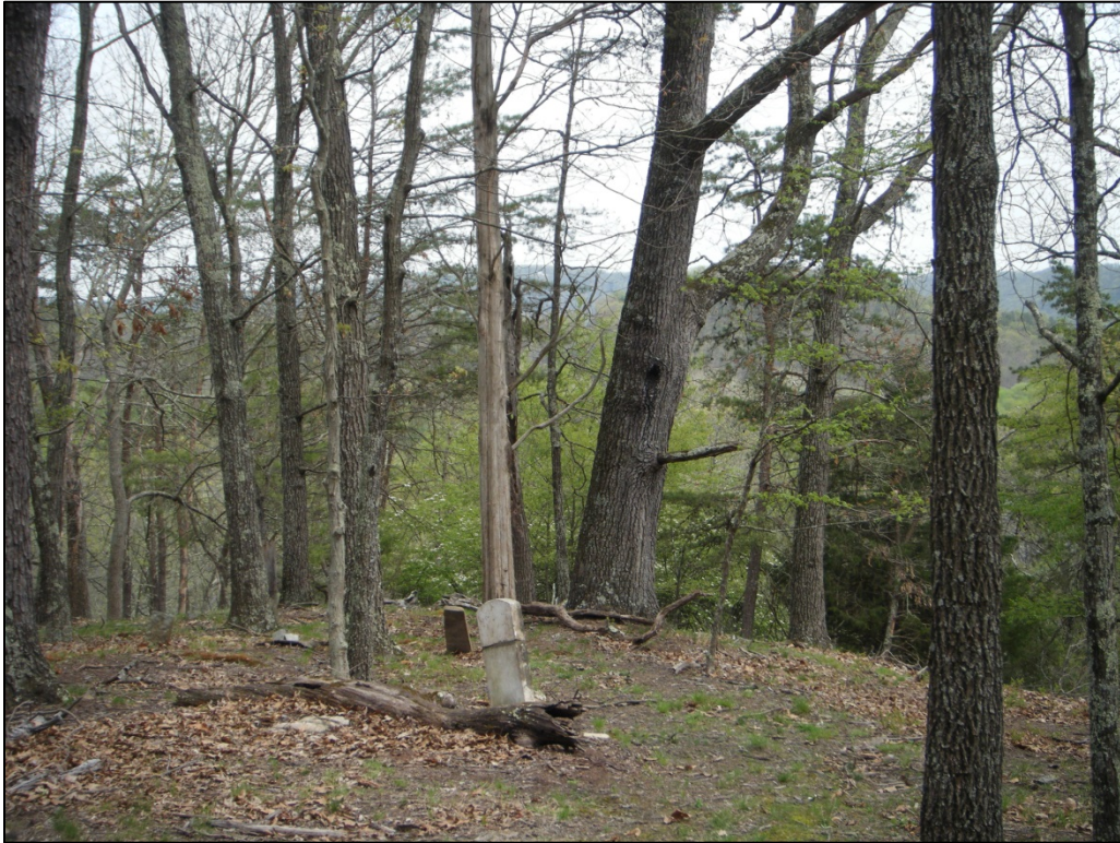
Photograph of 46-HM-215, looking north.