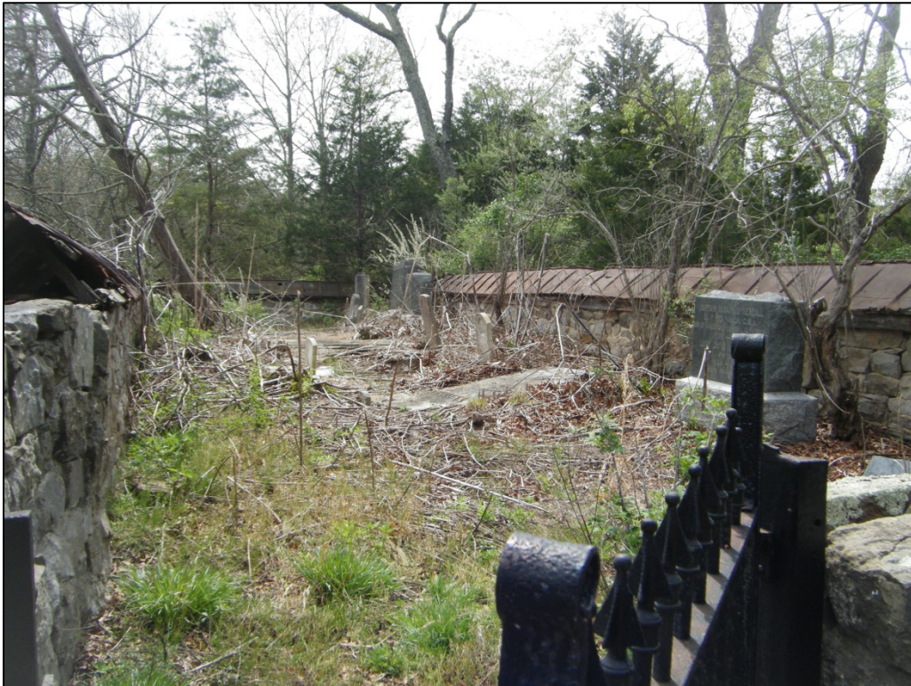
Photograph of 46-HM-216, looking east.