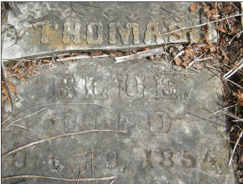
Photograph of a broken/cracked crypt documented at 46-HM-216.