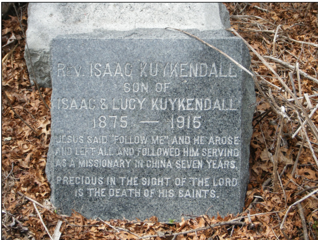
Photograph of a placard/marker documented at 46-HM-216.