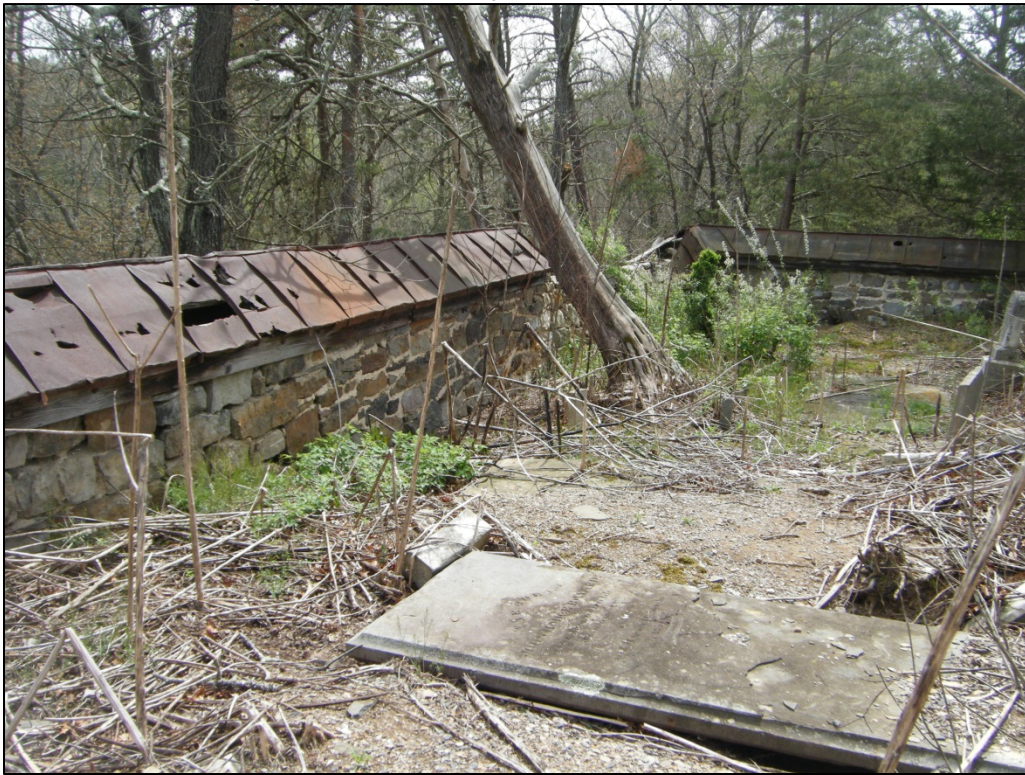
Photograph of 46-HM-216, looking east.