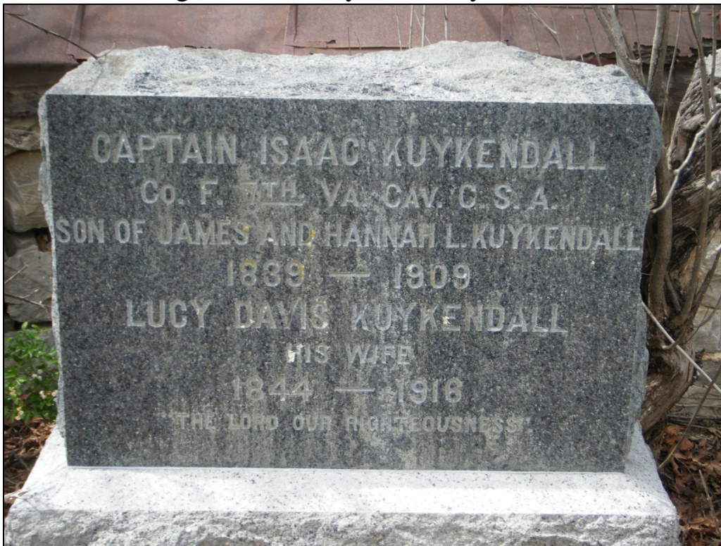
Photograph of a headstone/monument documented at 46-HM-216.