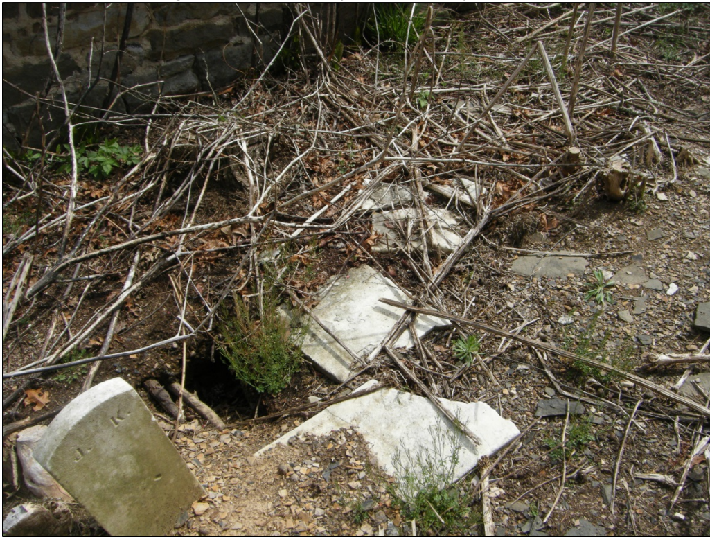
Photograph of damage headstones/markers and evidence of burrowing activities at 46-HM-216.