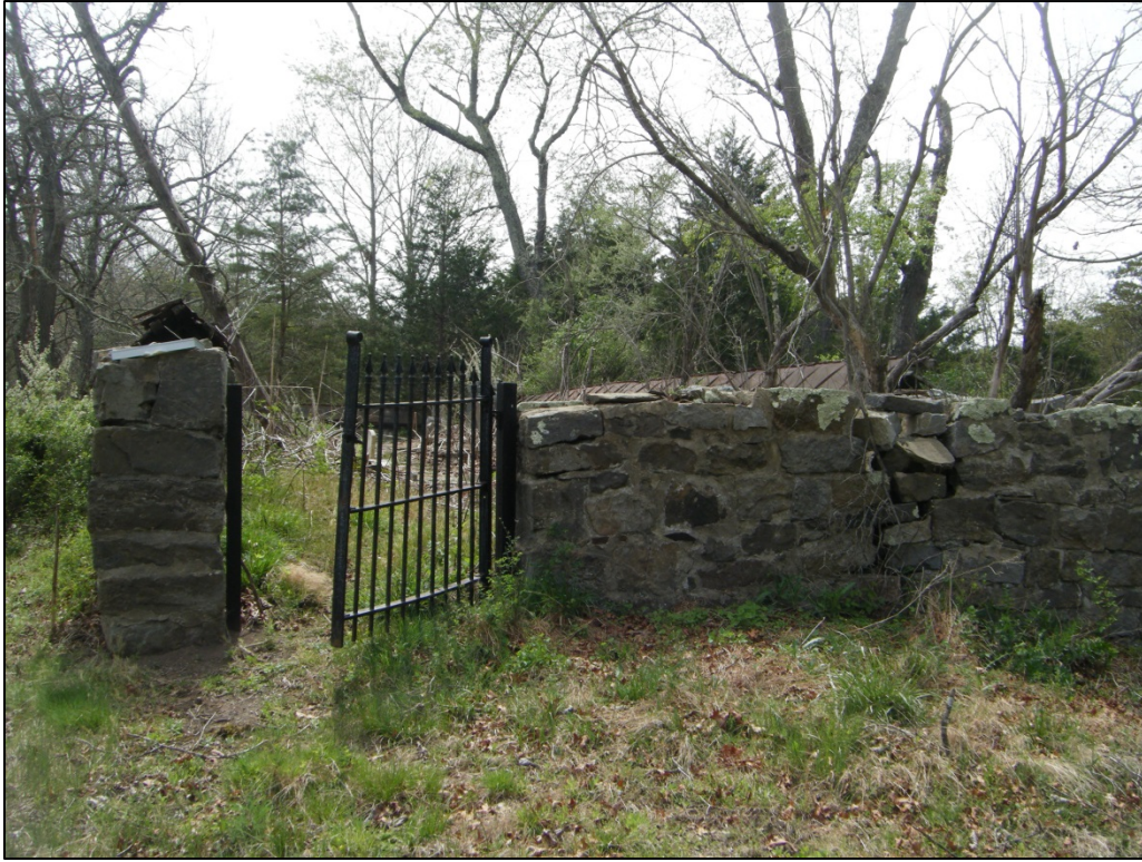
Photograph of 46-HM-216, looking east.