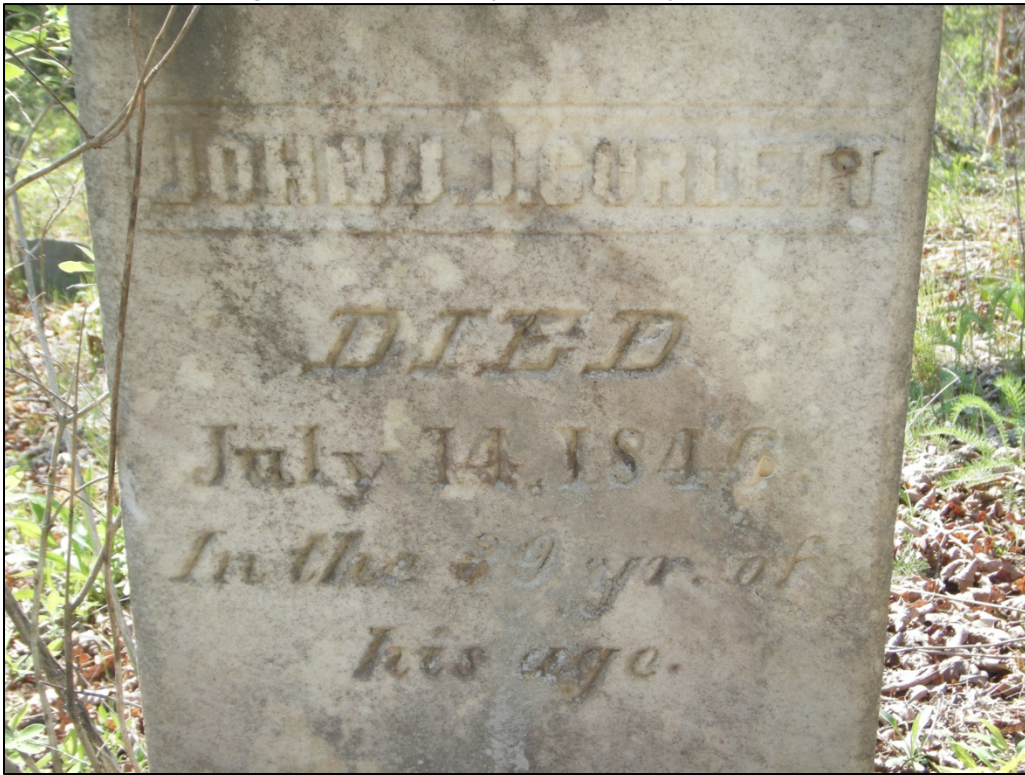
Photograph of an early headstone documented at 46-HM-217.