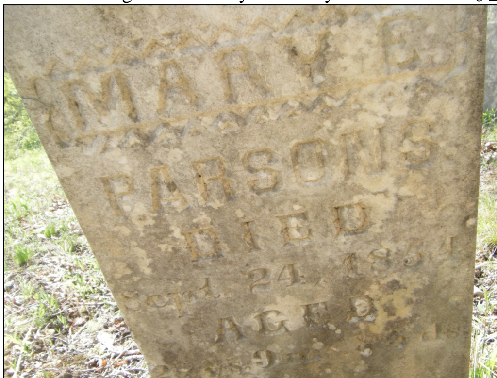
Photograph of a headstone documented at 46-HM-217.