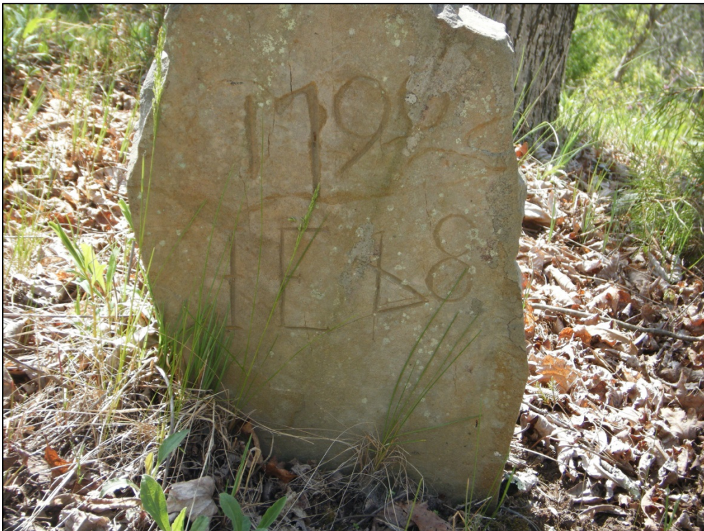
Photograph of a hand inscribed fieldstone marker encountered at 46-HM-217.