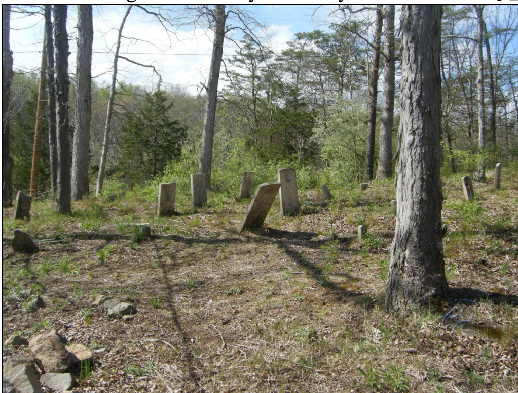
Photograph of 46-HM-217, looking northwest.