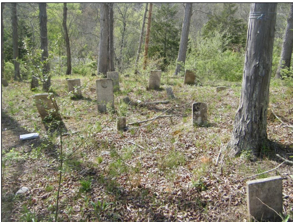
Photograph of 46-HM-217, looking west.