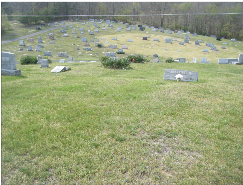
Photograph of 46-HM-218, looking north.