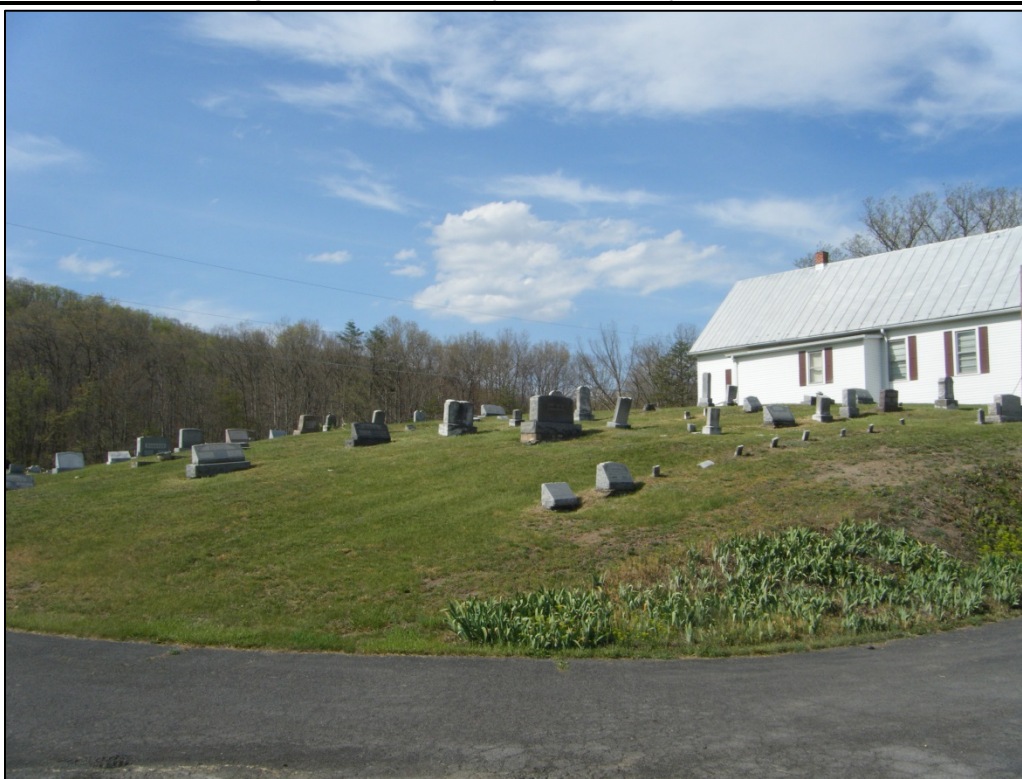
Photograph of 46-HM-218, looking northeast.