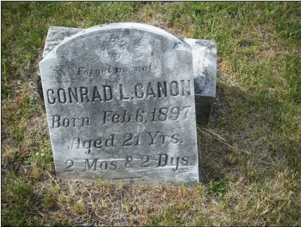
Photograph of a stand and fallen headstone (leaning against the stand) documented at 46-HM-218.