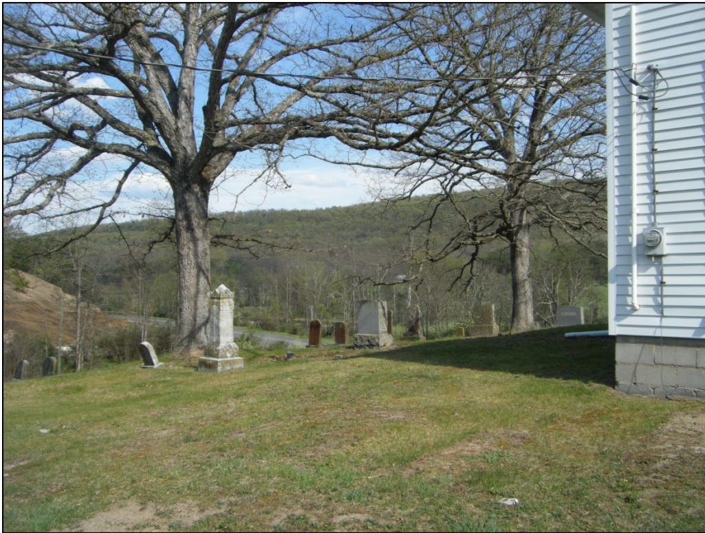
Photograph of 46-HM-218.