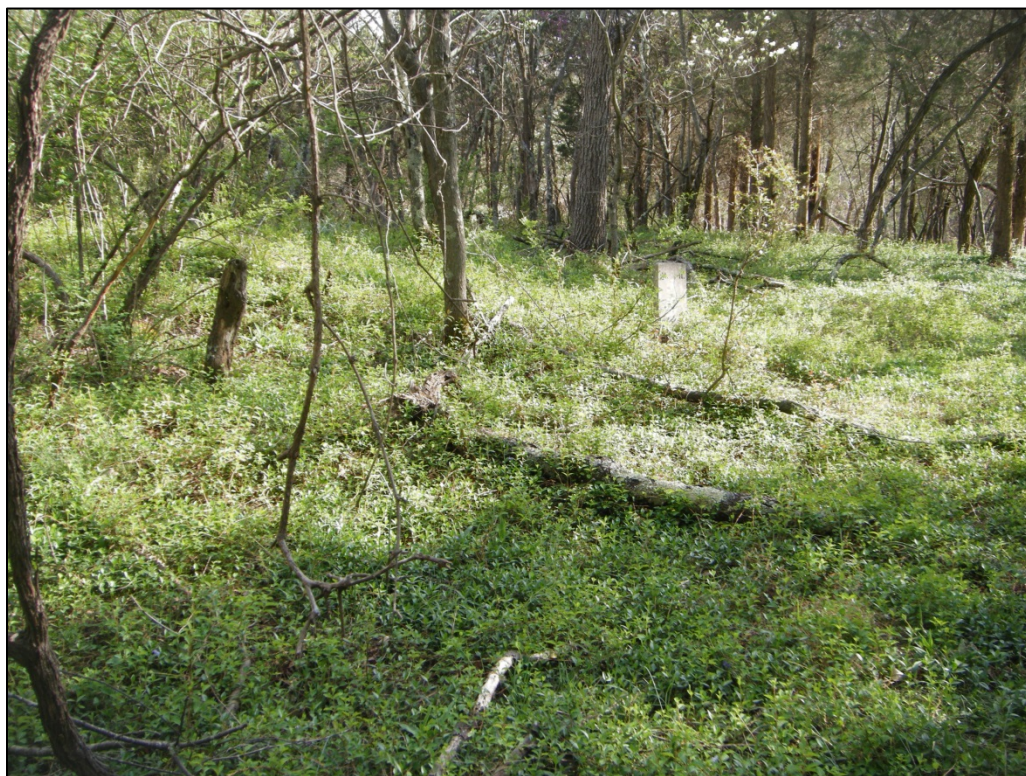
Photograph of 46-HM-219, looking west.