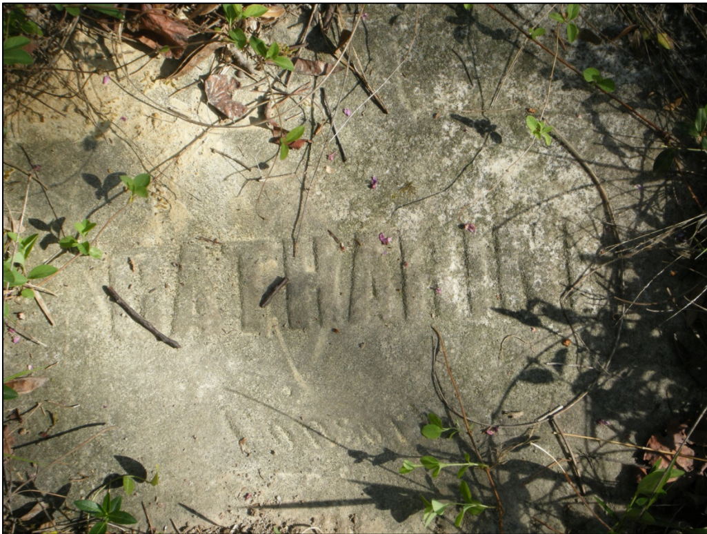
Photograph of a partially buried headstone encountered at 46-HM-219.