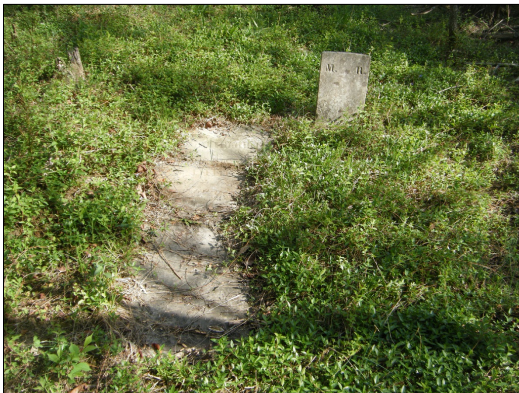
Photograph of 46-HM-219, looking south.