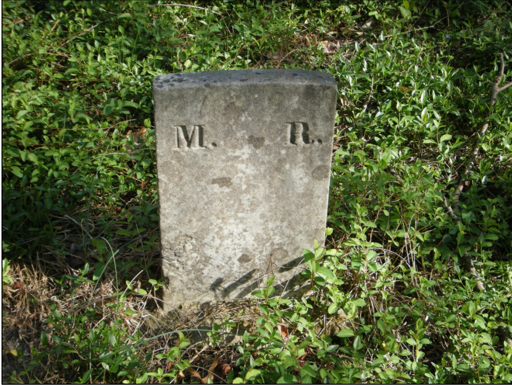
Photograph of a footstone/marker documented at 46-HM-219.