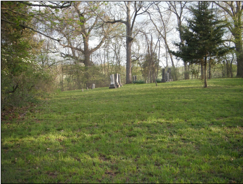
Photograph of 46-HM-222, looking southwest.