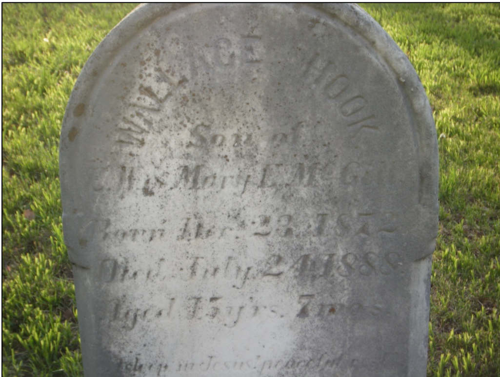
Photograph of a headstone encountered at 46-HM-222.