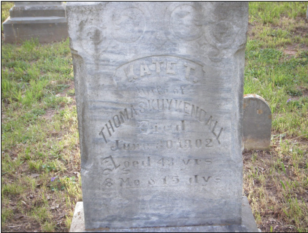
Photograph of a headstone/monument documented at 46-HM-222.