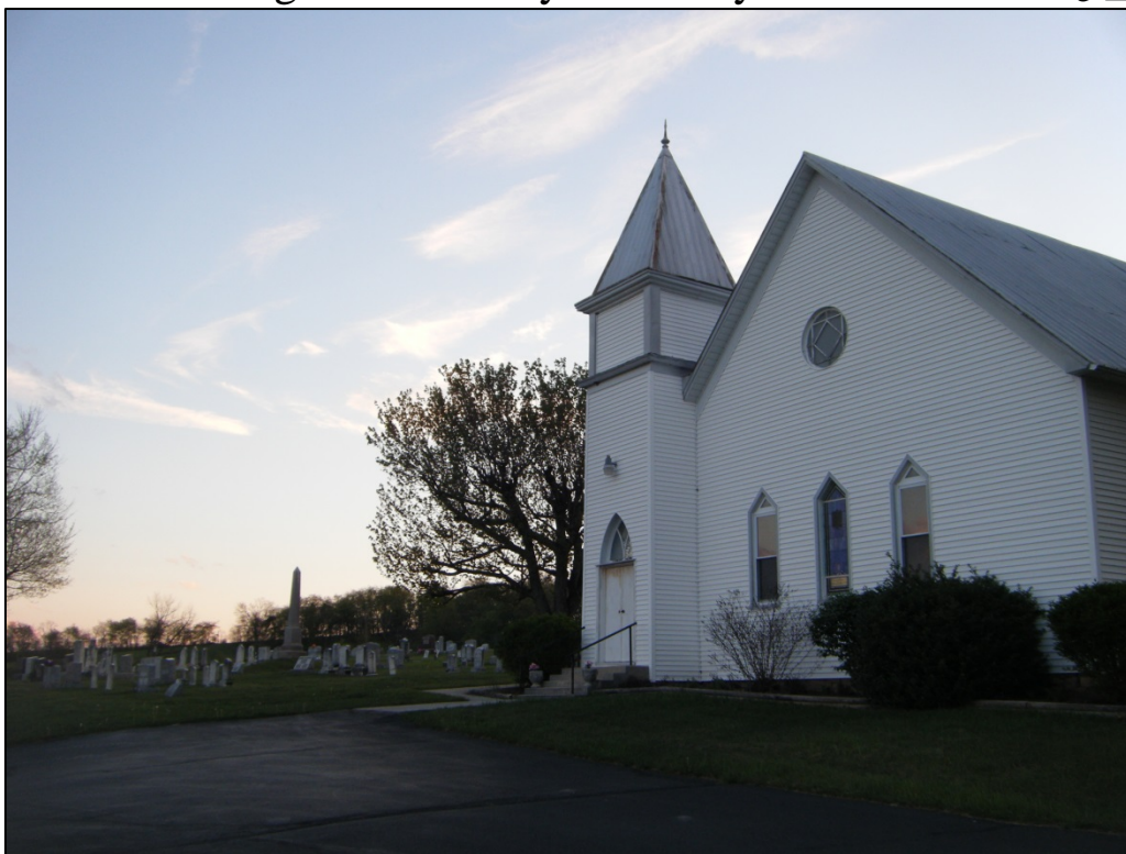
Photograph of 46-HM-224, looking southwest.