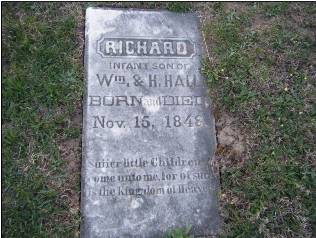
Photograph of a fallen headstone encountered at 46-HM-224.