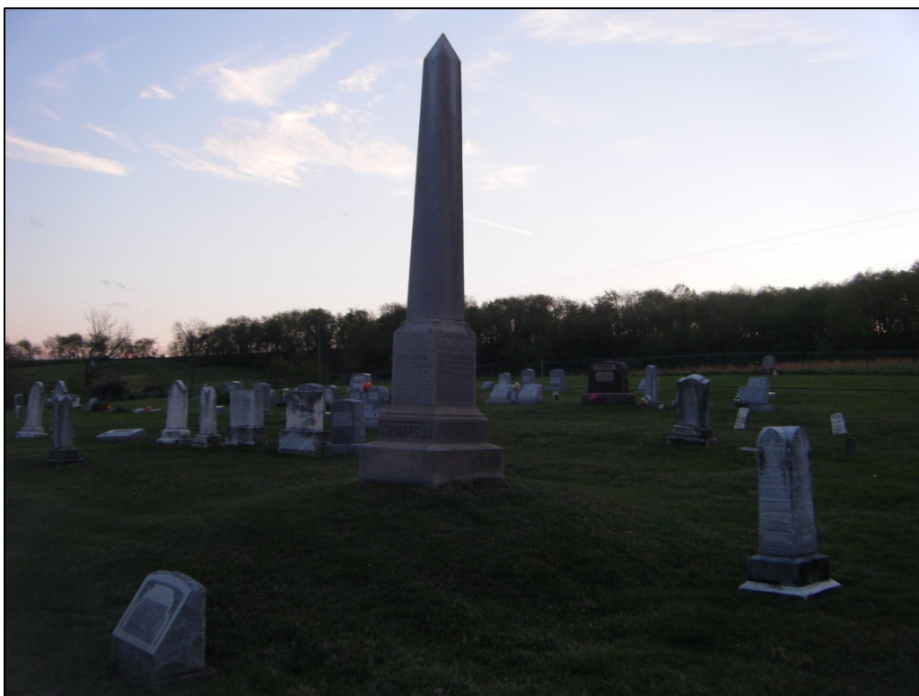
Photograph of 46-HM-224, looking southwest.