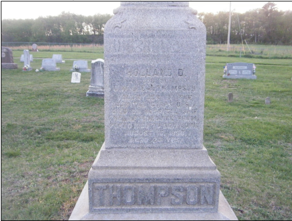
Photograph of a monument documented at 46-HM-224.