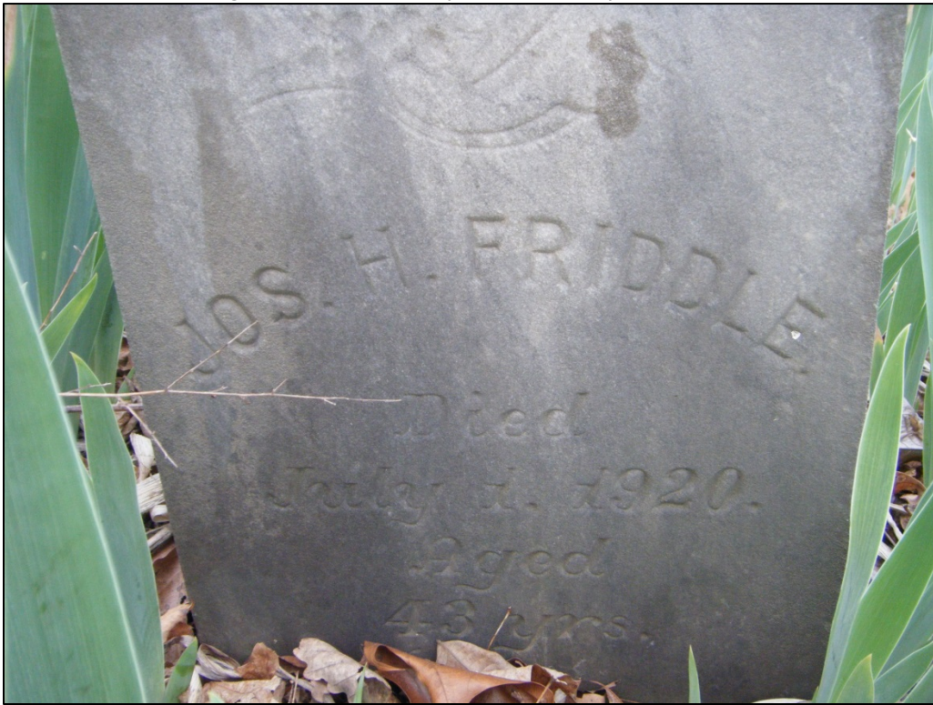
Photograph of a headstone documented at 46-HM-225.