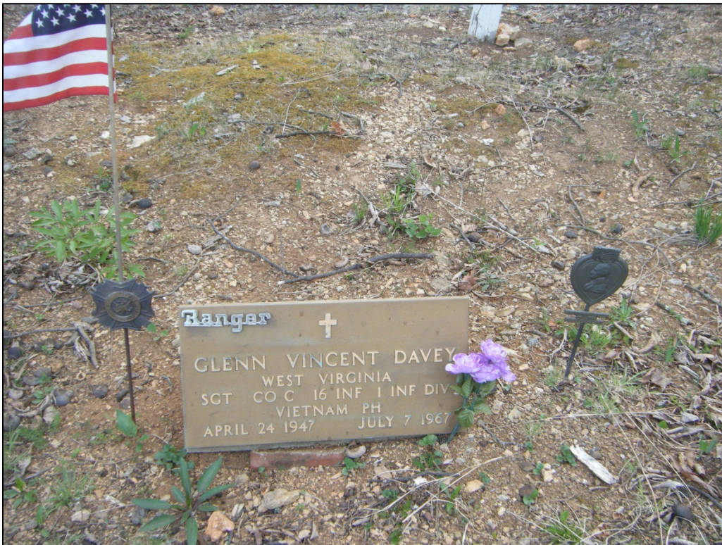
Photograph of a government issued Vietnam veteran marker documented at 46-HM-225.