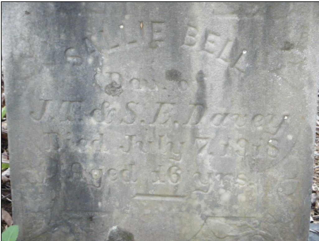
Photograph of a headstone encountered at 46-HM-225.