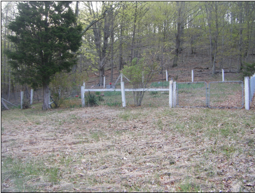
Photograph of 46-HM-225, looking east.